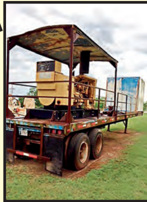
225 KVA CATERPILLAR GENERATOR SET