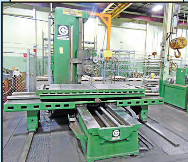
TABLE TYPE HORIZONTAL BORING MILL

GIDDINGS & LEWIS 6" MDL. 70-H6-F , Allen Bradley 9 Series CNC control, 168" X, 96" Y, 48" Z-axis travel, #50 NST w/PDB, 1,020 RPM, 40 HP, ballscrew drive on head and column, S/N 425-41-68.