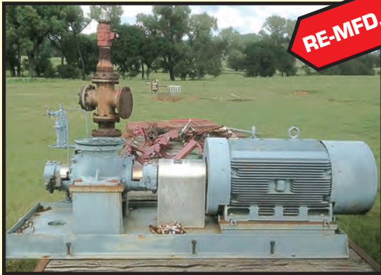
BINGHAM 500 HP CENTRIFUGAL PUMP