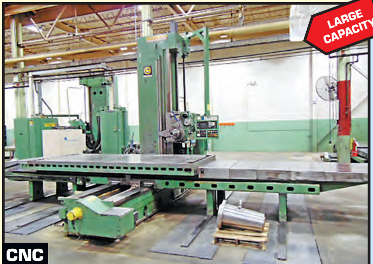
5" CINCINNATI GILBERT MDL. J CNC TABLE TYPE HORIZ. BORING MILL