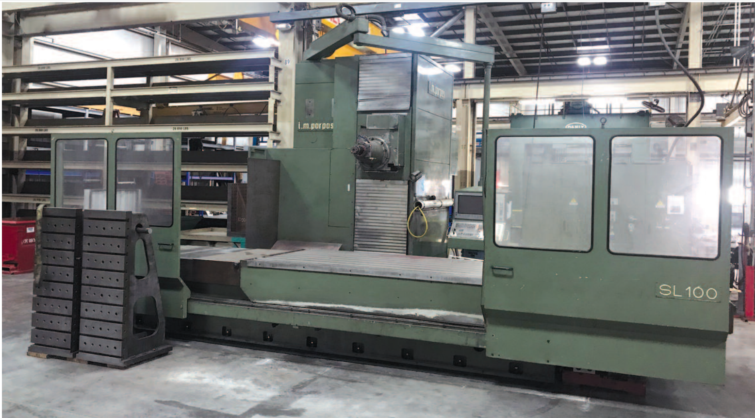
I.M. PARPAS SL100-3000 4" CNC Horizontal Boring Machine