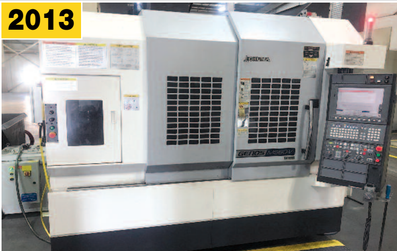
OKUMA GENO M560V CNC Vertical Machining Center