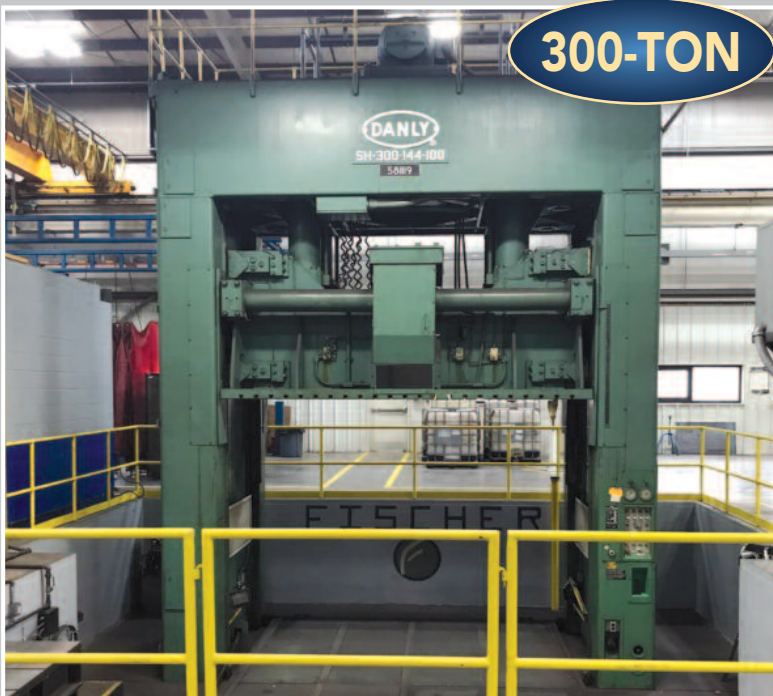
DANLY SH-300-144-100 300-Ton Spotting Press