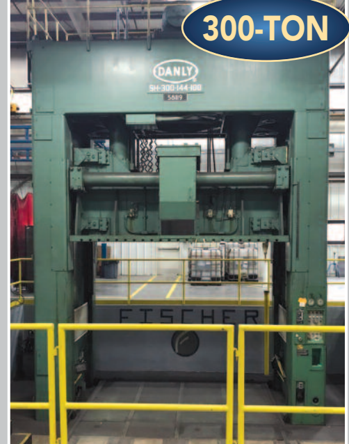
DANLY SH-300-144-100 300-Ton Spotting Press