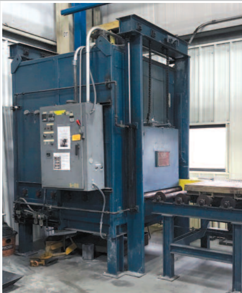
CEC Burn-Off Oven