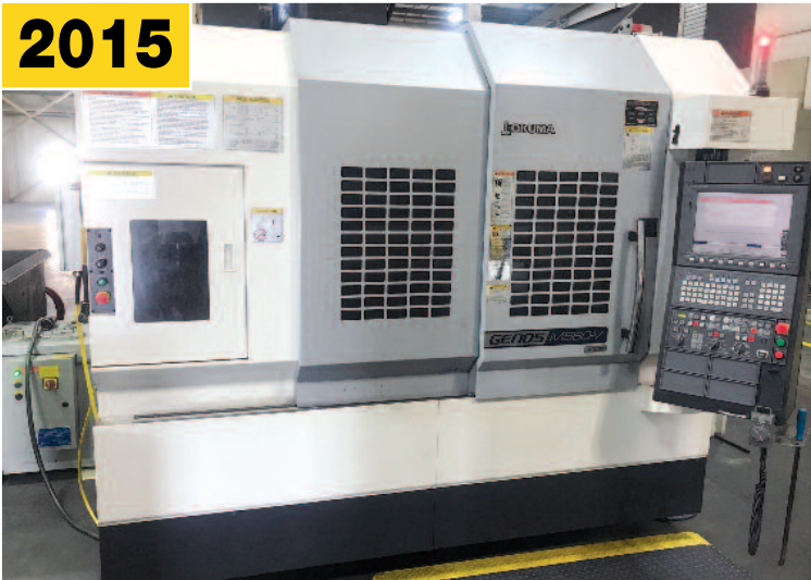
OKUMA GENO M560V CNC Vertical Machining Center