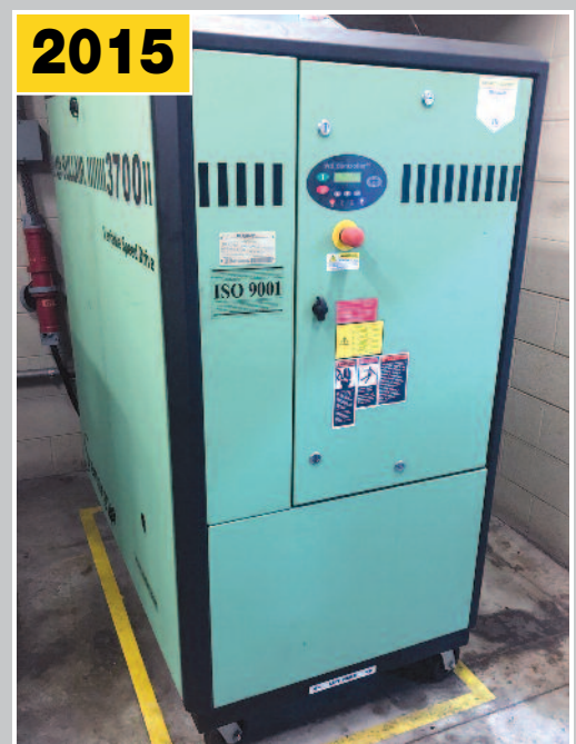
SULLAIR 50 HP Var. Speed Drive Air Compressor