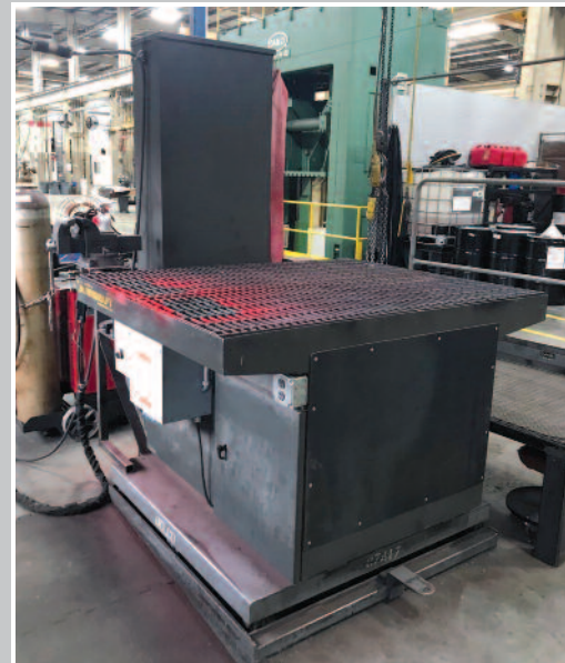
DIVERSIFIED Down Draft Booth