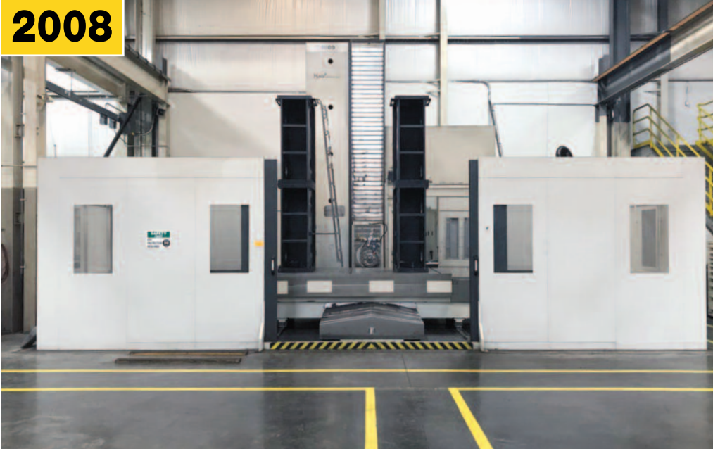
MAG G&L PT1800 CNC Horizontal Boring Machine