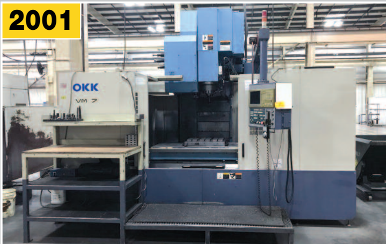
OKK VM-7 CNC Vertical Machining Center