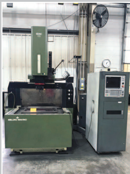
LEBLOND MAKINO EDNC-65 Ram Type EDM