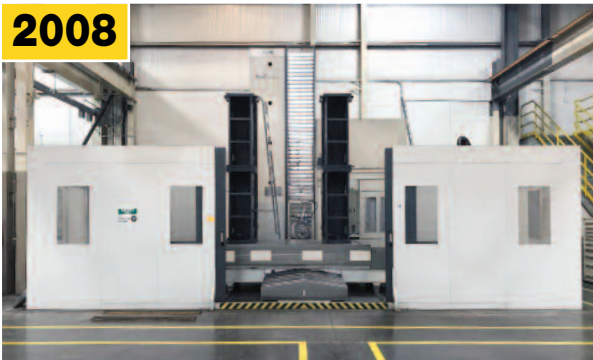
MAG G&L PT1800 CNC Horizontal Boring Machine