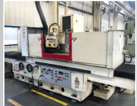
OKAMOTO ACC-28-60DX Surface Grinder

TERMS & CONDITIONS | PAYMENT: Full payment within 24 hours. Payment is Cash, Cashier's check, Certified Check, or Wire Transfer. No other forms of payments will be accepted. Full Payment Must be Made before removal of Purchase. Everything is Sold "As-Is, Where-Is". All Sales Final. Cost and Responsibility for Removal of Purchase Remains with the Purchaser. Every Effort will be Made to Facilitate Removal. While Quantities and Descriptions are Believed to be Accurate, the Auctioneer, Owners or Counsel Make no Warranties or Guarantees Either Expressed or Implied as to Authenticity, Genuineness of, or Defects in Any Lot and will not be Held Responsible for any Advertising Discrepancies or Inaccuracies. No Warranties Whatsoever are Made as to Condition Merchantability or Fitness for Use of Any Item. May we Suggest you Take Full Advantage of the Preview and Inspection Period. Sale Subject to Additions, Deletions and Prior Sales. Please Check Availability of Equipment.