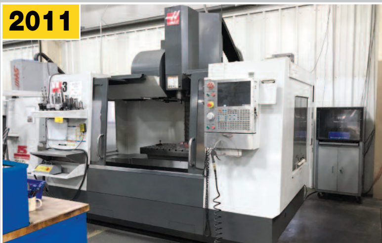
HAAS VM-3 CNC VMC