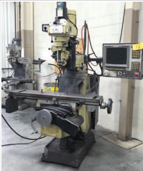
WILLIS MICROCUT 1050II Vertical Mill