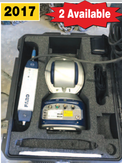
FARO TRACKER Vantage S_USiADM Laser