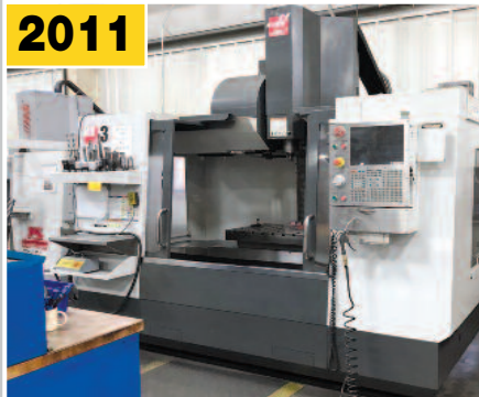
HAAS VM-3 CNC Vertical Machining Center