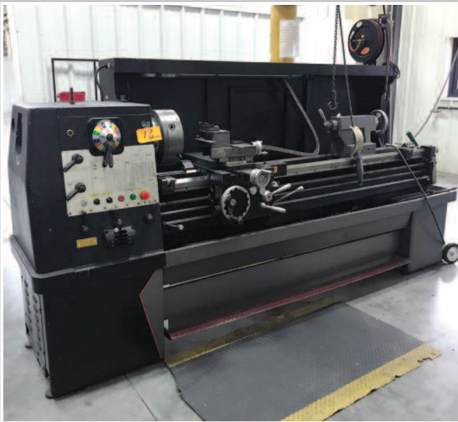
CLAUSING COLCHESTER Engine Lathe