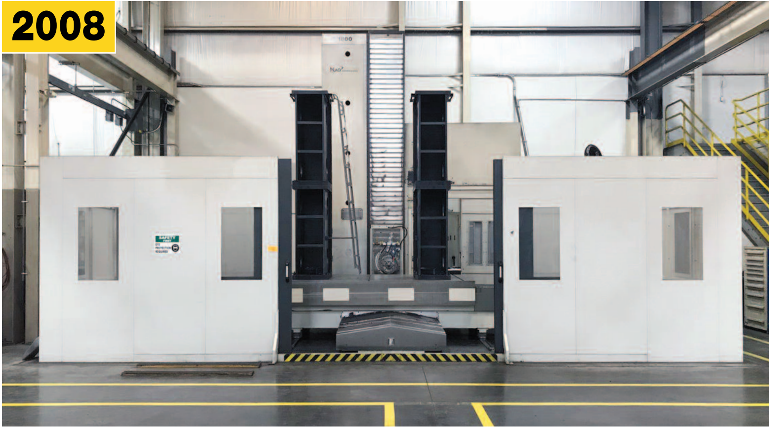
MAG G&L PT1800 CNC Horizontal Boring Machine