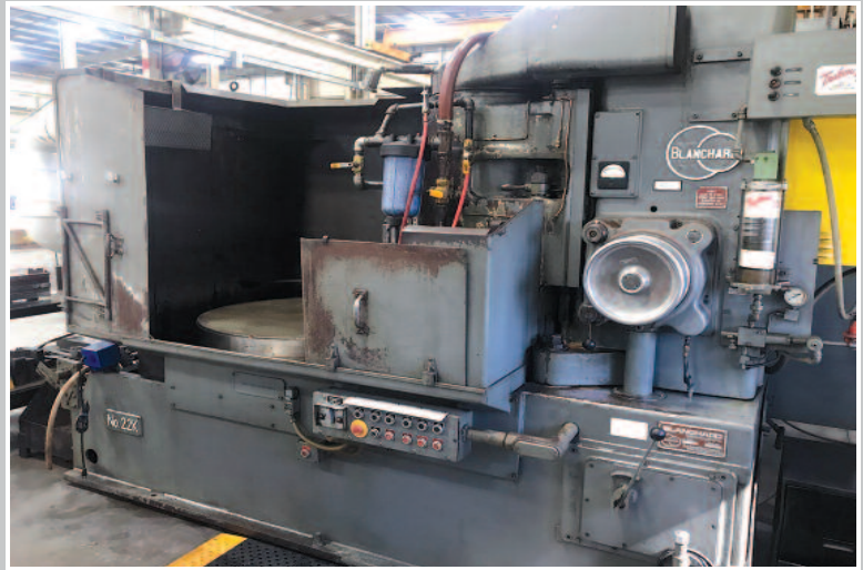
BLANCHARD 22K-42 Rotary Surface Grinder