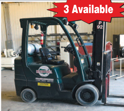
HYSTER 6,000 Lb. LP Forklift