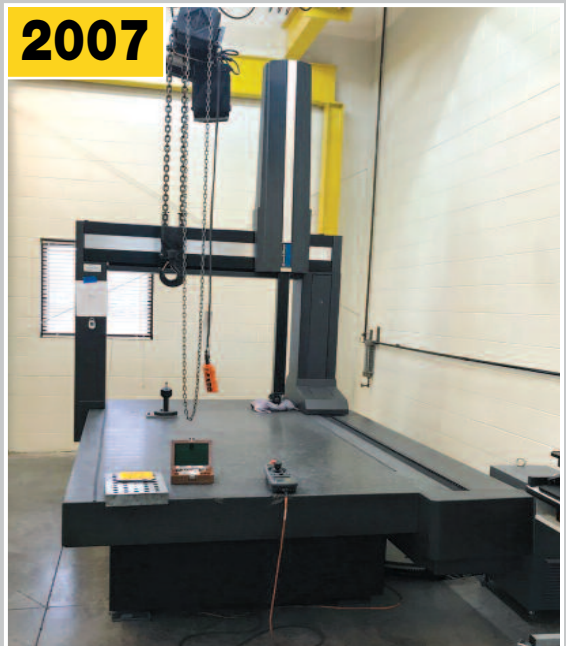
Brown & Sharp Excel 12-20-10 CMM