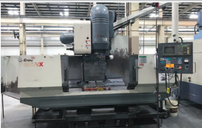
ENSHU 650VX CNC Vertical Machining Center