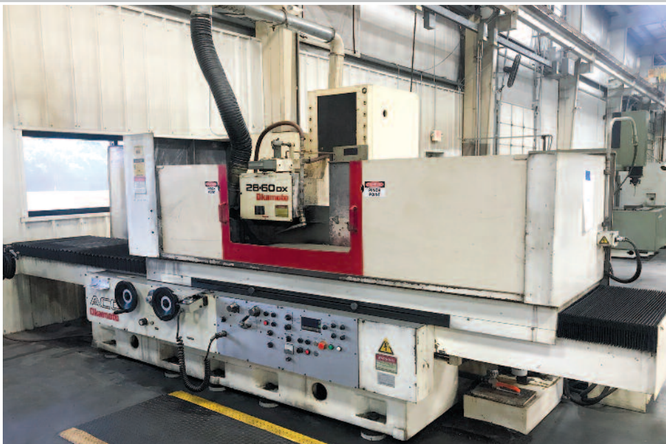
OKAMOTO ACC-28-60DX Surface Grinder