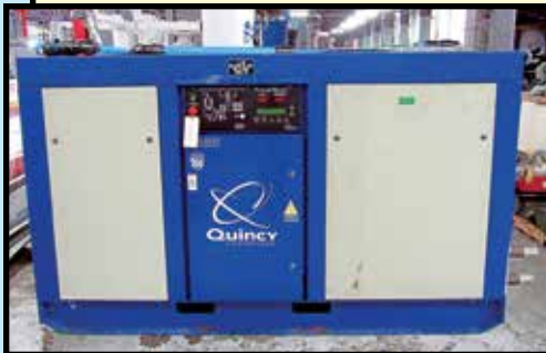
QUINCY 125 HP AIR COMPRESSOR