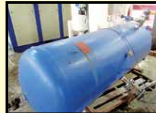
AIR RECEIVING TANK