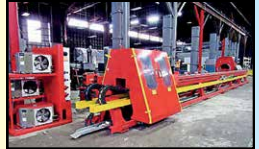
FRONIUS ID PIPE CLADDING MACHINE