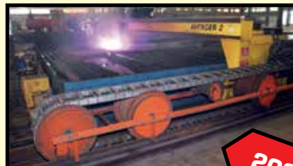
ESAB MDL. AVENGER S-6V15PC PLASMA PLATE BURNING MACHINE