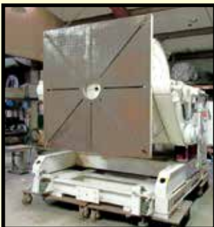
< ARONSON MDL. GE-500EXP WELDING POSITIONER