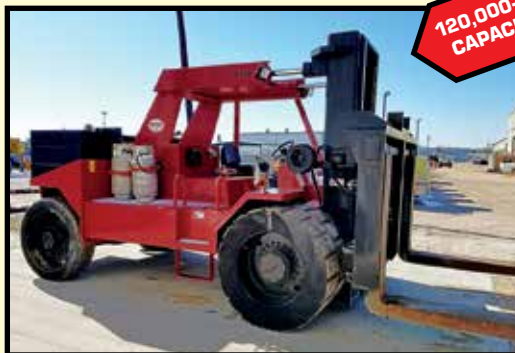
RIGGER EXTREME X-120 FORKLIFT W/HYD. BOOM LIFT

ONLINE BIDDING: YOU MUST REGISTER IN ADVANCE FOR ONLINE BIDDING AT THIS AUCTION.