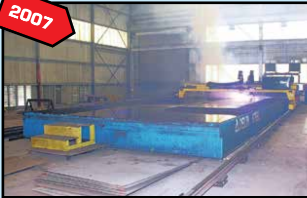
< ESAB MDL. AVENGER S-6V15PC PLASMA PLATE BURNING MACHINE