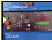
QUINCY 125 HP AIR COMPRESSOR CONTROL

FRONIUS ID PIPE CLADDING MACHINE POWER SOURCE