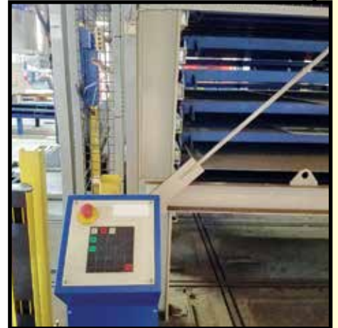
CONTROL FOR THE TRUMPF TKL/STOPA DUAL TOWER MATERIAL STORAGE SYSTEM