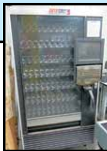
AUTO CRIB MDL. STUDIO 3 INDUSTRIAL VENDING MACHINE