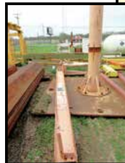
SAMPLE VIEW OF JIB CRANES