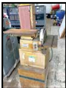
POWERMATIC BELT SANDER