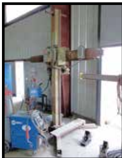
ARONSON MDL. SG8VRA8CL-PK WELDING MANIPULATOR