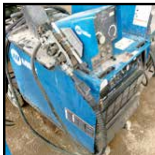
MILLER DIMENSION 452 W/WIRE FEEDER