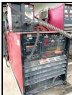
LINCOLN IDEALARC POWER PULSE 500