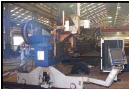
MESSER MDL. TMC4531 PLASMA PLATE BURNING MACHINE