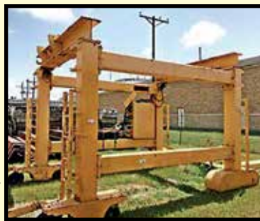
> AIR TECHNICAL INDUSTRIES TELE-MAST STRADDLE CRANE

Read Partial Terms and Conditions on Back Page of Brochure