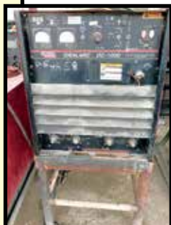
LINCOLN IDEALARC DC-1000