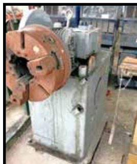
PANDJIRIS WELDING POSITIONER