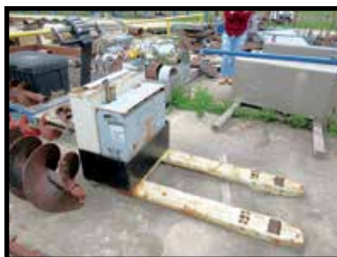
ELECTRIC PALLET JACK