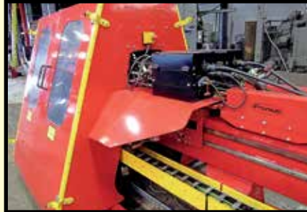
FRONIUS ID PIPE CLADDING MACHINE