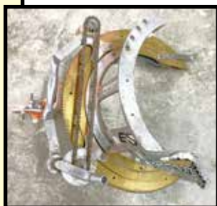
PIPE BEVELING MACHINE

3-ROLLER POWERED ROLLER CONVEYOR , (4) 18'L. x 3'W. belt driven conveyor tpls., (1) discharge tbl. w/hydraulic tilting.