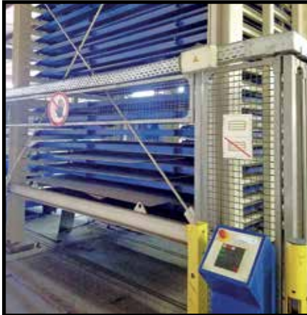
ANOTHER VIEW OF THE TRUMPF TKL/STOPA DUAL TOWER MATERIAL STORAGE SYSTEM