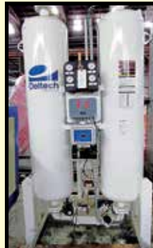
DELTECH AIR DRYER

QUINCY 125 HP AIR COMPRESSOR: Rated cap. (inlet/outlet): 750/650 SCFM at 100 PSIG and 100 deg. F min./max. working pressure: 60/150 PSIG at 100 deg. F min./max. operating temperature: 35 deg. F/140 deg. F, desiccant type: activated alumina, input power: 85- 264 vac/1 P/47-63 HZ, H.O.M.: 21,770.76