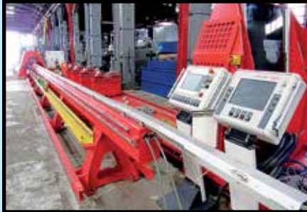
FRONIUS ID PIPE CLADDING MACHINE CONTROL

NOTE: THE FRONIUS OVERLAY WELDING (FOW) SYSTEM IS EQUIPPED TO PERFORM INTERNAL CLADDING WELDS OF PIPES USING TIG-HOTWIRE TWIN WELDING PROCESS