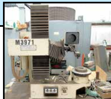
ROYAL TOOL PRESETTER