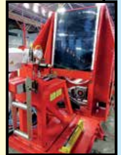
FRONIUS ID PIPE CLADDING MACHINE

QUINCY 125 HP AIR COMPRESSOR: Rated cap. (inlet/outlet): 750/650 SCFM at 100 PSIG and 100 deg. F min./max. working pressure: 60/150 PSIG at 100 deg. F min./max. operating temperature: 35 deg. F/140 deg. F, desiccant type: activated alumina, input power: 85- 264 vac/1 P/47-63 HZ, H.O.M.: 21,770.76