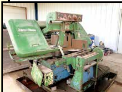
JOHNSON ARMADA H450-HD BANDSAW