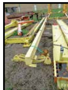
SAMPLE VIEW OF JIB CRANES