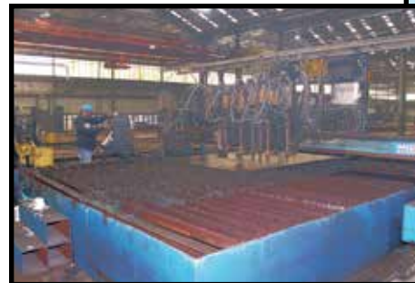
MG INDUSTRIES MDL. MG4516 PLASMA AND OXYFUEL PLATE BURNING MACHINE