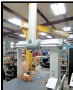
BROWN & SHARPE GLOBAL PERFORMANCE C.M.M.

T-SLOTTED SUB TABLE , 24.75" x 24.75" x 3.75"; CINCINNATI MILACRON T-30 PALLET , 31.5" x 31.5"; 24"; PRATT & WHITNEY PLAIN ROTARY TABLE ; (2) ANGLE PLATES , 36" x 6"; CROWN ELECTRIC MDL. 40GPW-4-14 PALLET JACK , needs repair; TOOL POST AND TOOL HOLDER .