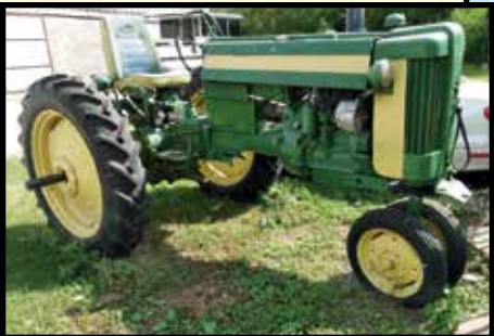
JOHN DEERE MDL. 420 T TRACTOR