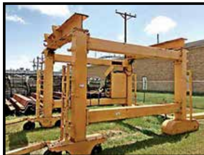
AIR TECHNICAL INDUSTRIES TELE-MAST STRADDLE CRANE