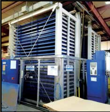
TRUMPF TKL/STOPA DUAL TOWER MATERIAL STORAGE SYSTEM