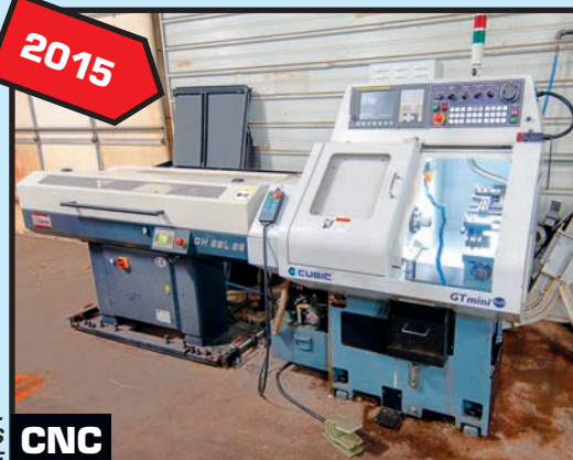
CUBIC MDL. GT MINI PLUS CNC LATHE