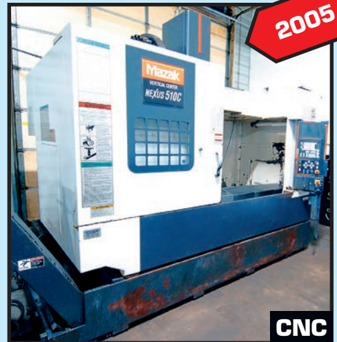
(1 OF 2) MAZAK NEXUS MDL. 510 C CNC VERTICAL MACHINING CENTERS