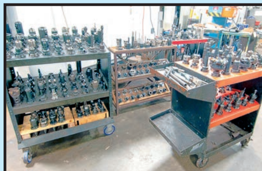
CAT 40 TOOL HOLDERS