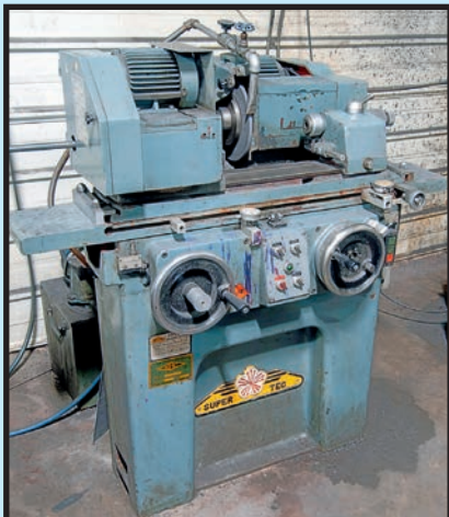
SUPERTECH 4" X 12" PLAIN CYLINDRICAL GRINDER