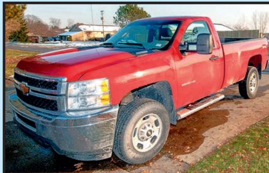
2013 CHEVROLET MD. 2500HD PICKUP TRUCK