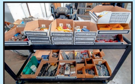
SAMPLE VIEW OF PERISHABLE TOOLING