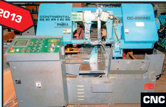
DOALL CONTINENTAL SERIES MDL. DC280NC CNC HORIZONTAL BANDSAW