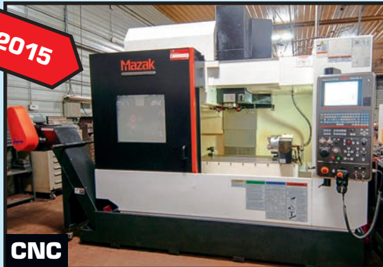
MAZAK NEXUS MDL. 530C 4-AXIS CNC VERTICAL MACHINING CENTERS