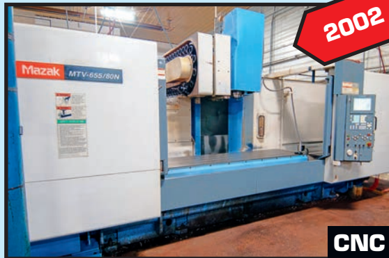
MAZAK MDL. MTV655/80N CNC VERT. MACHINING CENTER

HARDINGE MDL. HC CHUCKER , 6-pos. turret, spds.: 125-3,000 RPM, lever type collet closer, assorted turning tools & collets, S/N HC-5882-T.