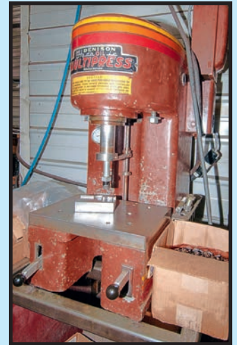
DENNISON 4 T. MDL. DB4C01013A59 MULTI PRESS HYDRAULIC C-FRAME