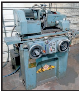
SUPERTECH 4" X 12" PLAIN CYLINDRICAL GRINDER