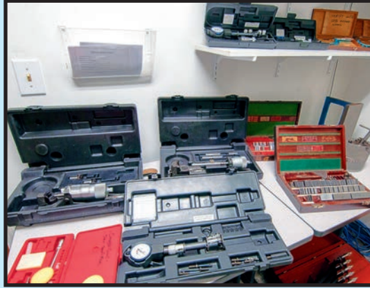
SUNNEN GAUGE SETTING FIXTURES