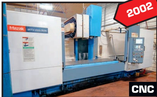
MAZAK MDL. MTV655/80N CNC VERTICAL MACHINING CENTER

ATTENTION: PLANT MANAGER OR EQUIPMENT BUYER