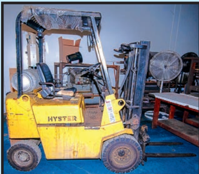
HYSTER 2,000-LB. CAP. FORKLIFT

INGERSOLL RAND , 10 HP motor, 120 gal. horiz. tank, S/N 30T725616.