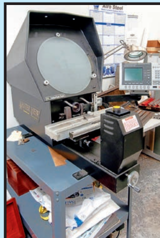
SUBURBAN TOOL MASTerview 14" OPTICAL COMPARATOR

HYSTER 2,000-LB. CAP. MDL. H25XL-MII , LPG pwr'd., 2,000-lb. cap. @ 24" L.C., 3-stage mast, 169.5" lift ht., 42" forks, S/N C001G8007K.