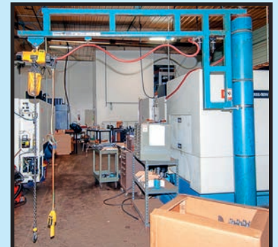
GORBEL JIB CRANE