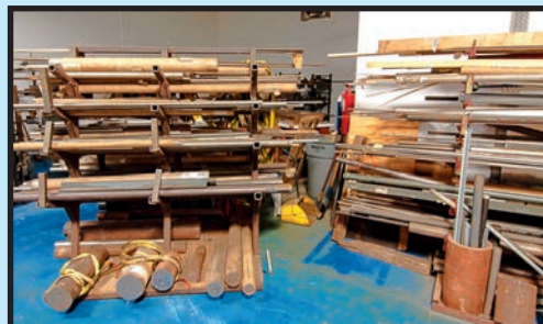
HUGE QUANTITY OF RAW MATERIAL