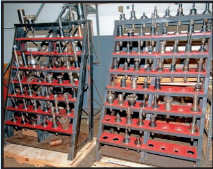
CAT 50 TOOL HOLDERS

STEEL; ALUMINUM; POLISHED & GROUND BAR; LARGE DIA. ROUNDS, ANGLES, PLATS; DIE STEEL OF ALL GRADES; HEAVY WALL TUBING.