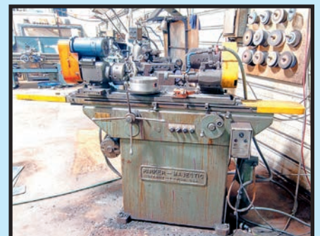
PARKER MAJESTIC INTERNAL GRINDER