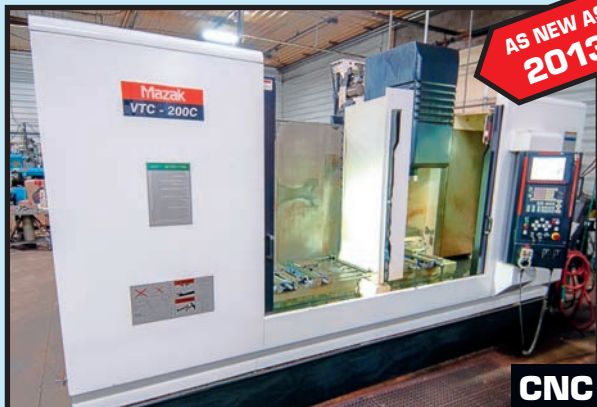
(1 OF 2) MAZAK MDL. VTC200C CNC VERT. MACHINING CENTERS

Featuring: 2015 Mazak Nexus 530C VMC, (2) 2005 Mazak Nexus 510C VMCs, (2) 2013-2011 Mazak VTC-200C VMC's, 2002 Mazak MTV-655/80N VMC, 2013 Mazak Quickturn Smart 300M CNC Lathe w/Milling, 2003 Mazak Nexus 250, 2015 Cubic GT-Mini CNC Lathe, Mazak QT-10 CNC Lathe, Wide Array of Milling Machines, Grinders, Drills & Other Support Machinery, B&S CMM Measuring Tools, Huge Assortment of Vises, Toolholders & Perishables, 2013 Doall DC-280NC Horiz. Bandsaw, Late Model IR Air Compressor, Material Handling Equipment, Forklift, & Much More!