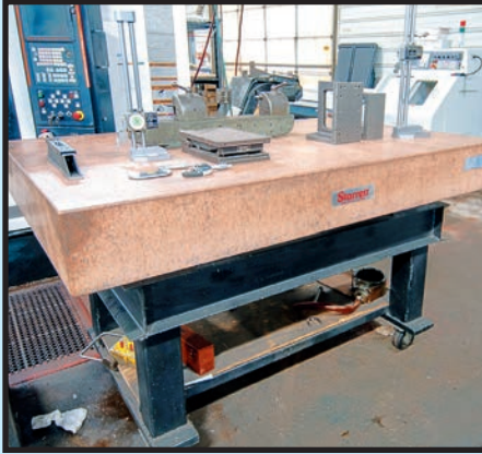
STARRETT PINK GRANITE SURFACE PLATE

On-Site Bidding in Walled Lake, Michigan or Bid Via Webcast at BidSpotter.com