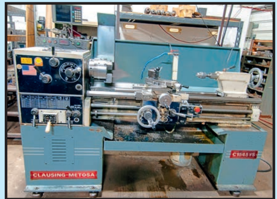
CLAUSING METOSA 15" X 45" MDL. C1545VS ENGINE LATHE