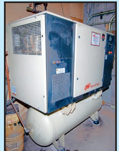
INGERSOLL RAND AIR COMPRESSOR