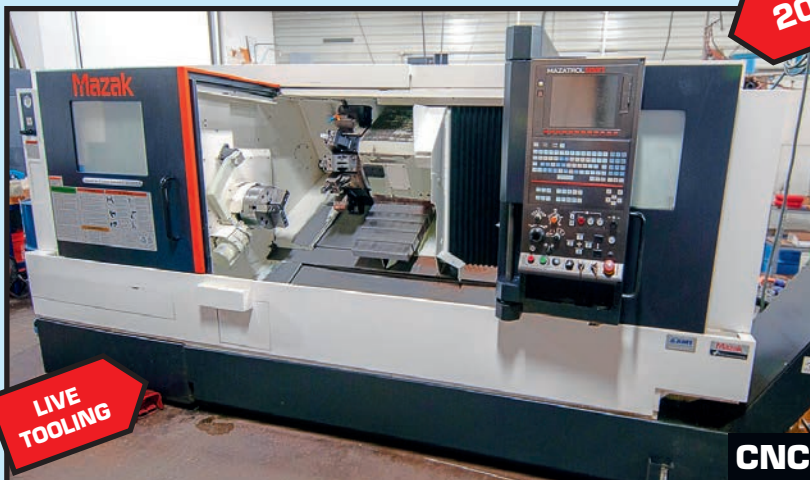
MAZAK QUICK TURN SMART MDL. 300M CNC LATHE