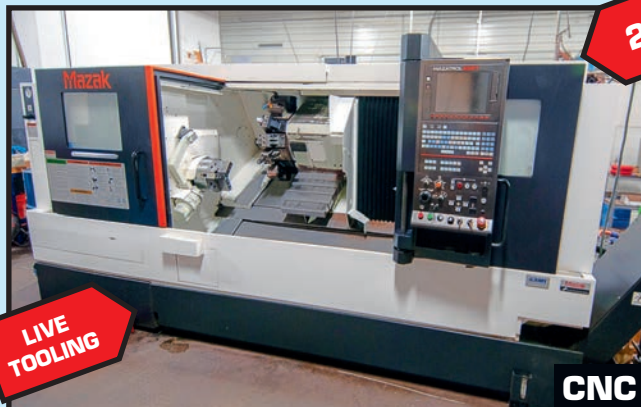
MAZAK QUICK TURN SMART MDL. 300M CNC LATHE

At the Premises of PAGE MACHINE TOOL 1144 RIG STREET WALLED LAKE, MICHIGAN 48390 (DETROIT AREA)