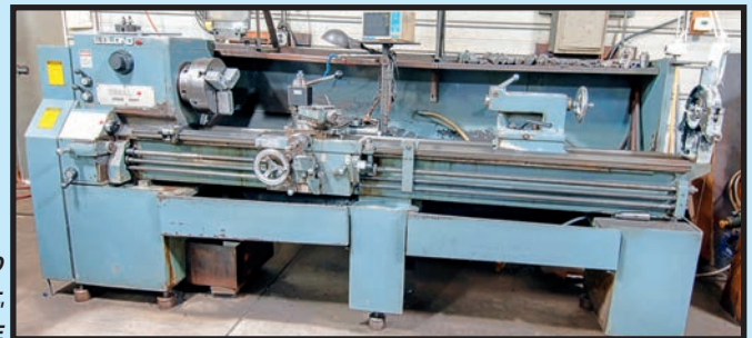
LEBLOND REGAL 19" X 78" ENGINE LATHE