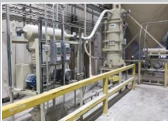
Smoot Blower System for Pneumatic Transfer/Conveying