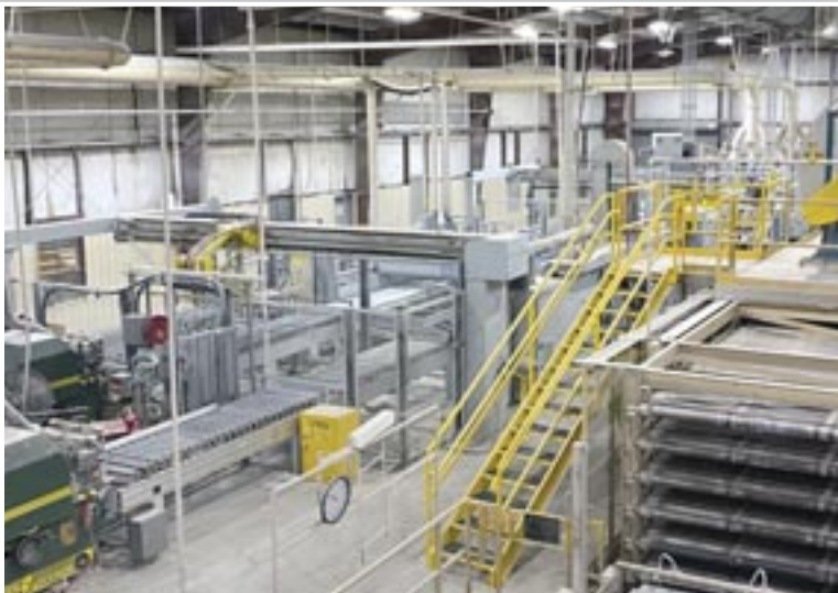
HOLZMA HPP33 Panel Saw Cell (Firestop Saw)