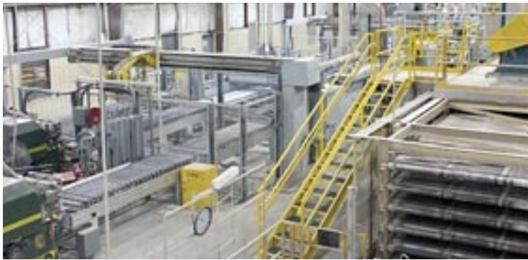
HOLZMA HPP33 Panel Saw Cell

21700 Northwestern Hwy. Suite 1180 Southfield, MI 48075