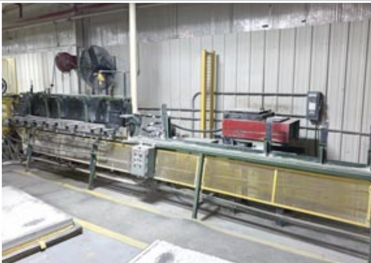
Laminator 1 w/Saws