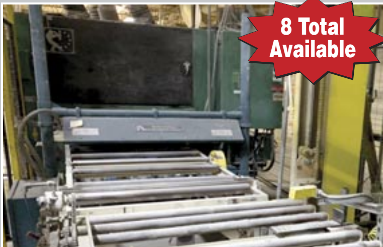
TIMESAVER Mdl. 452-1FA 52" Belt Sander