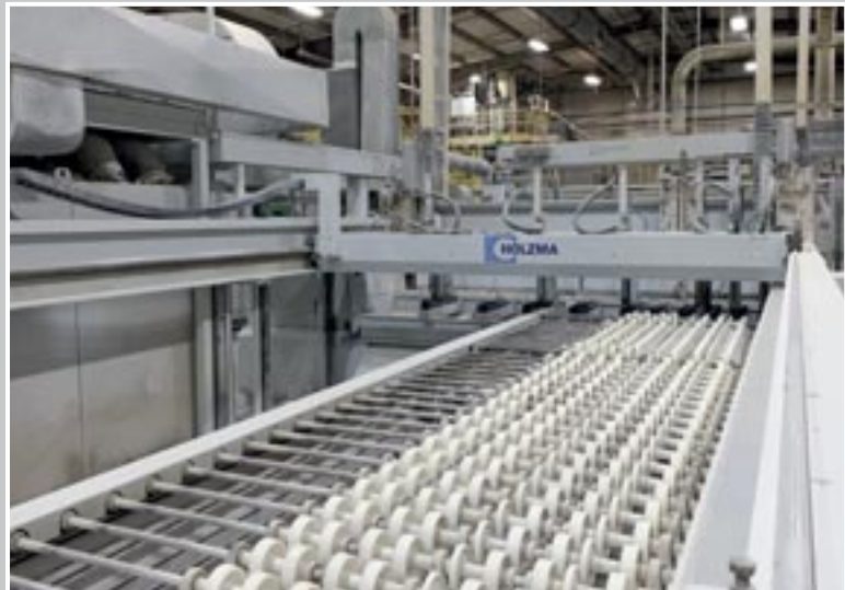
HOLZMA HPP33 Panel Saw Cell (Firestop Saw)