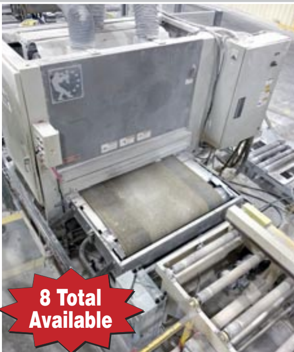
8 Total Available TIMESAVER Mdl. 452-1FA 52" Belt Sander