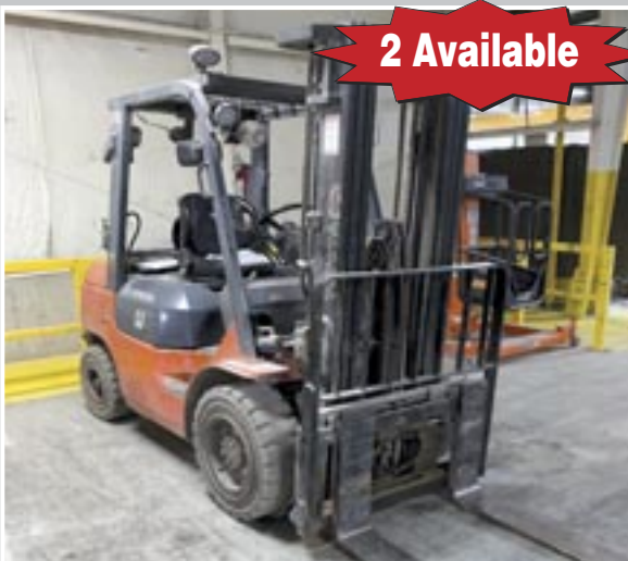
TOYOTA 5,600 Lb. Cap. Propane Forklift