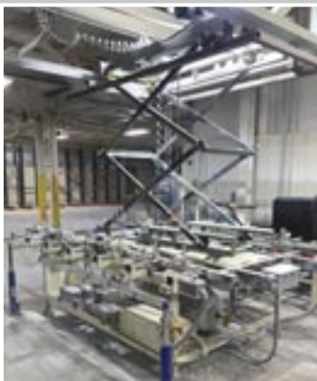
Lift Assist Station