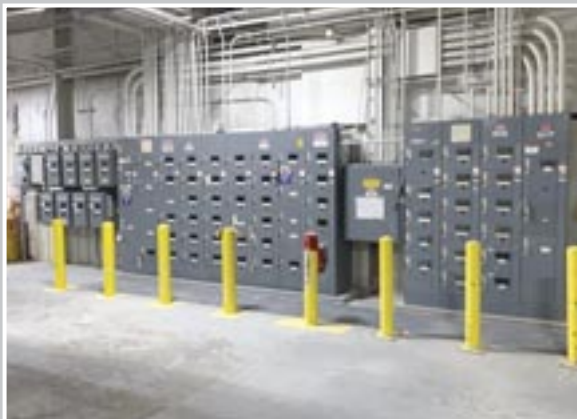
Square D MCC