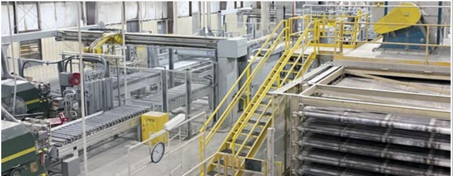
HOLZMA HPP33 Panel Saw Cell

Core Department • Firestop Department • Saws/CNC • Banding/Laminating • Sealant Line General Plant Support Equipment • Forklifts/Rolling Stock • Air Compressors