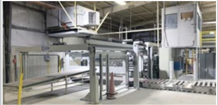
HOLZMA HFV33 Panel Saw Cell

TERMS & CONDITIONS | PAYMENT: Full payment within 24 hours. Payment is Cash, Cashier's check, Certified Check, or Wire Transfer. No other forms of payments will be accepted. Full Payment Must be Made before removal of Purchase. Everything is Sold "As-Is, Where-Is." All Sales Final. Cost and Responsibility for Removal of Purchase Remains with the Purchaser. Every Effort will be Made to Facilitate Removal. While Quantities and Descriptions are Believed to be Accurate, the Auctioneer, Owners or Counsel Make no Warranties or Guarantees Either Expressed or Implied as to Authenticity, Genuineness of, or Defects in Any Lot and will not be Held Responsible for any Advertising Discrepancies or Inaccuracies. No Warranties Whatsoever are Made as to Condition Merchantability or Fitness for Use of Any Item. May we Suggest you Take Full Advantage of the Preview and Inspection Period. Sale Subject to Additions, Deletions and Prior Sales. Please Check Availability of Equipment.