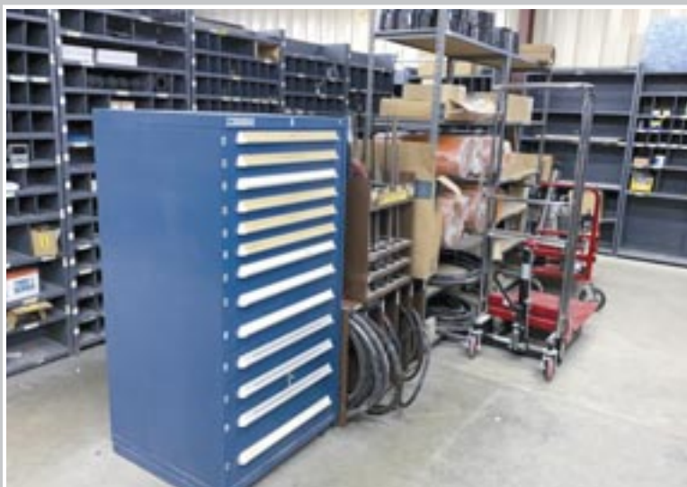
View of Parts Crib Room