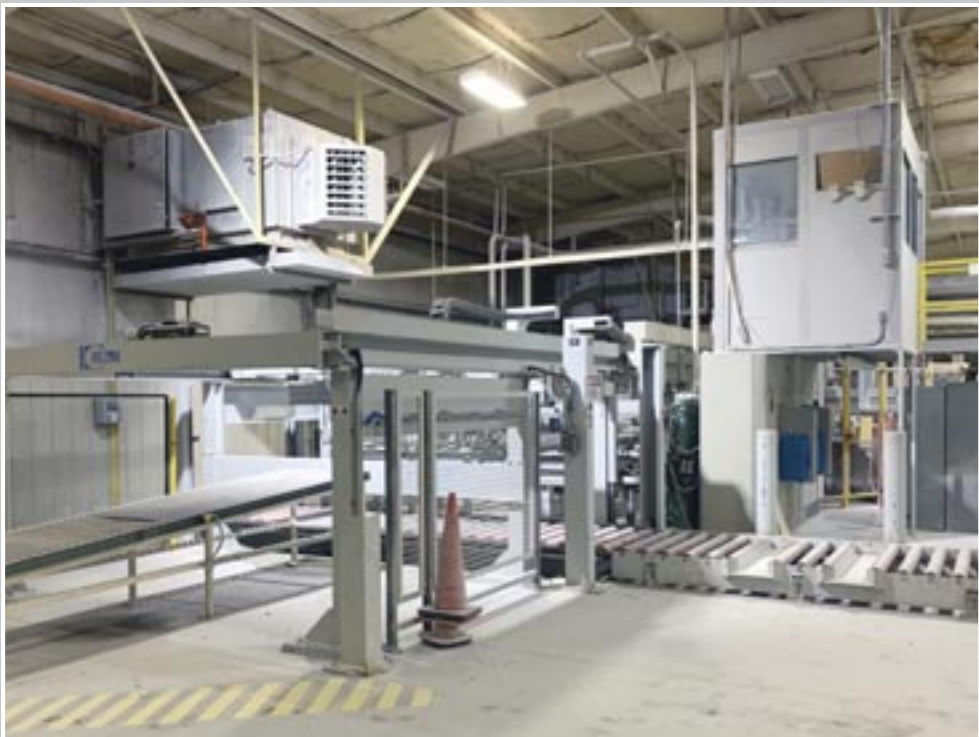
HOLZMA HFV33/33/16 Panel Saw Cell (Core Saw)