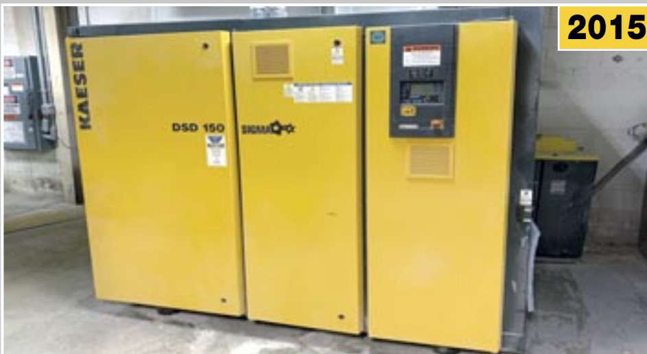
KAESER 150 HP Air Compressor