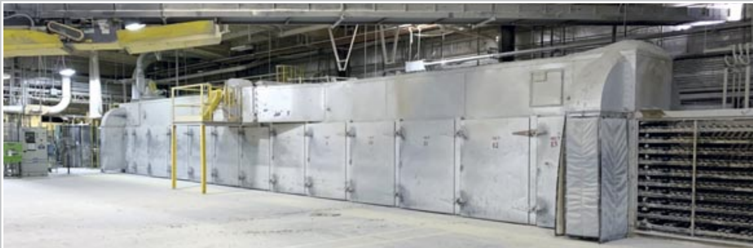
UNITHERM 13-Zone Dryer