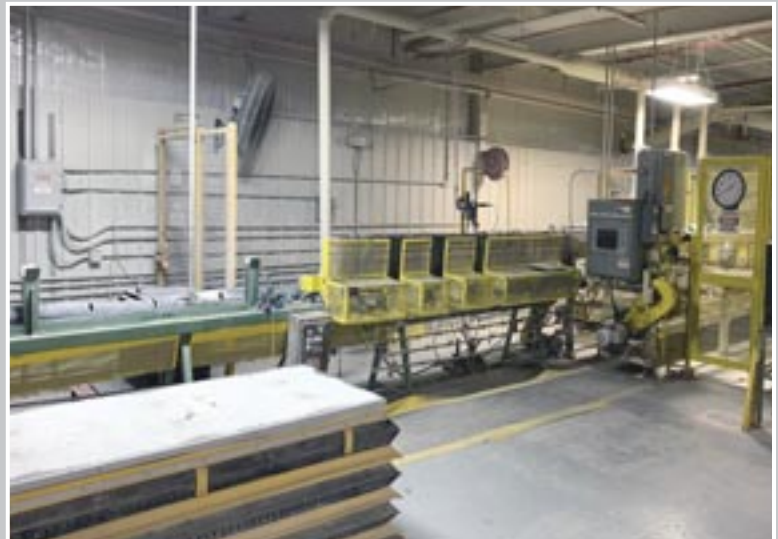
Laminator 2 w/Saws