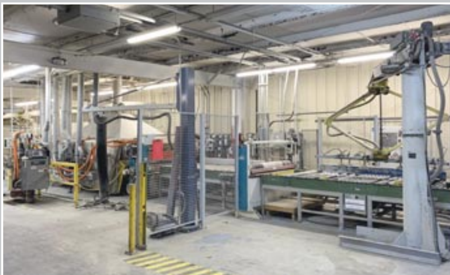
Sealant Line w/Infeed & Outfeed Stacker, Dryer