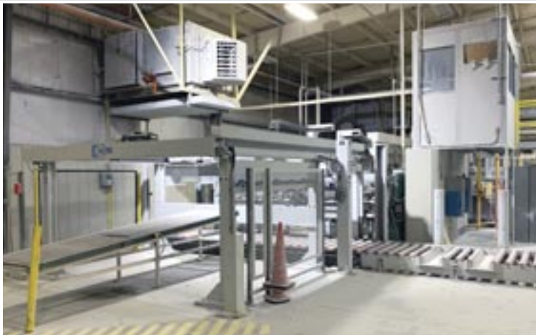
HOLZMA HFV33 Panel Saw Cell