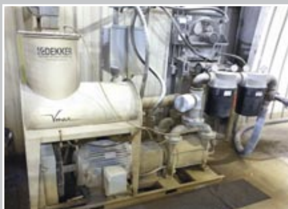
DEKKER Vacuum System