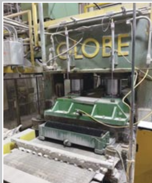
GLOBE Core Press (4' x 8' Cap.)