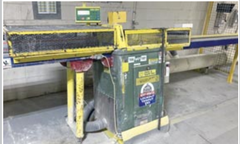
WHIRLWIND Upcut Saw w/TigerStop