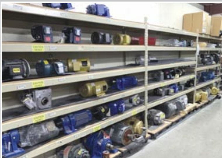
View of Motors