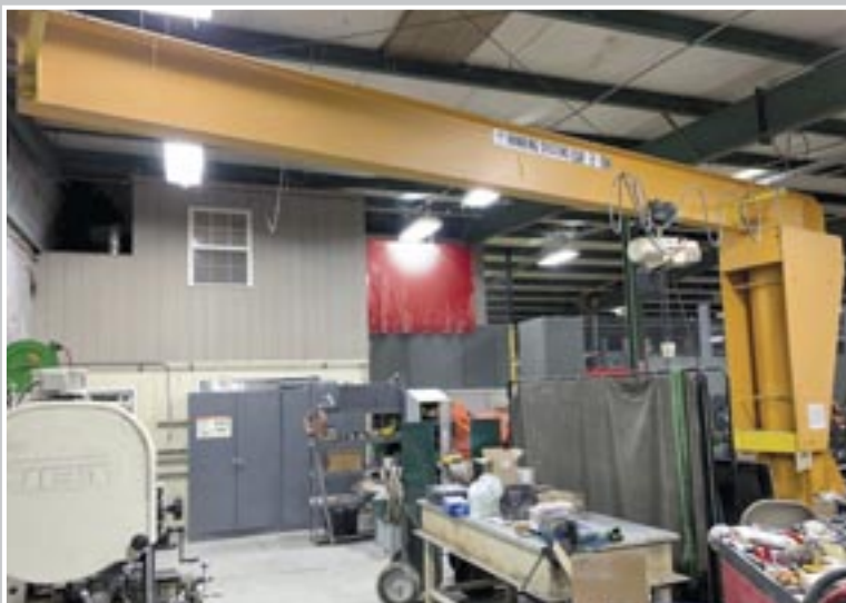
2-Ton Jib Crane