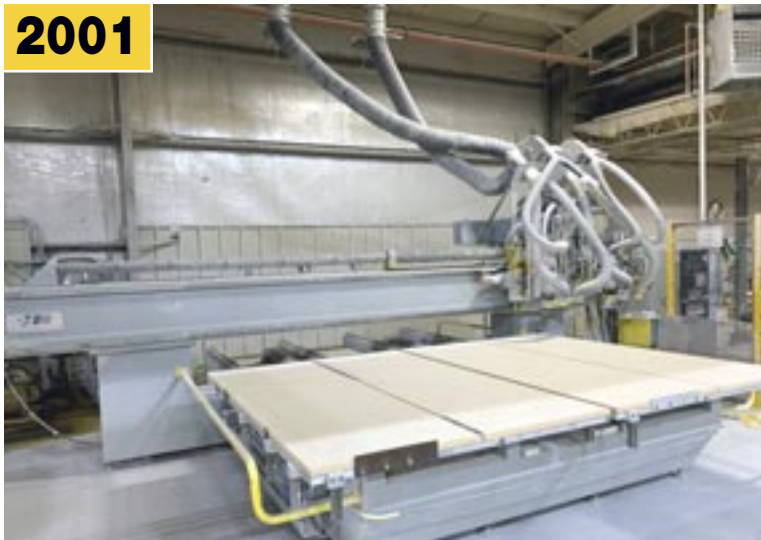
NORTHWOOD Multi-Head CNC Router