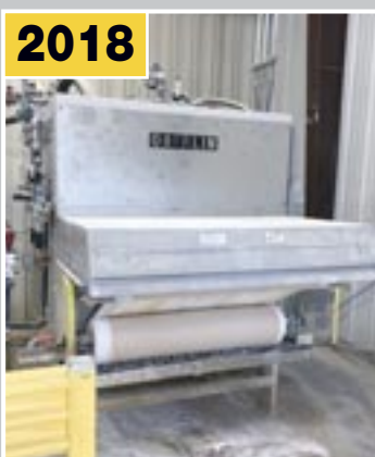
OBERLIN Pressure Filtration System