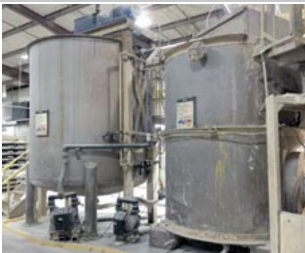
View of Pulp Tanks