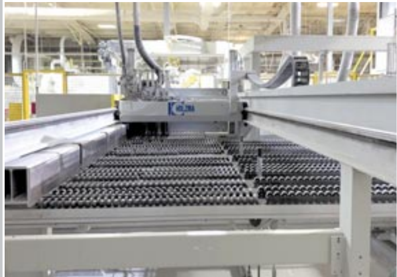
HOLZMA HFV33/33/16 Panel Saw Cell (Core Saw)