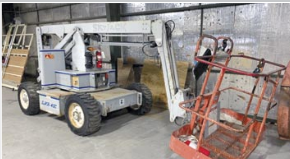
SKYJACK SJKB-40C Articulating Boom Lift