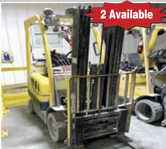
HYSTER 5,000 Lb. Cap. Propane Forklift