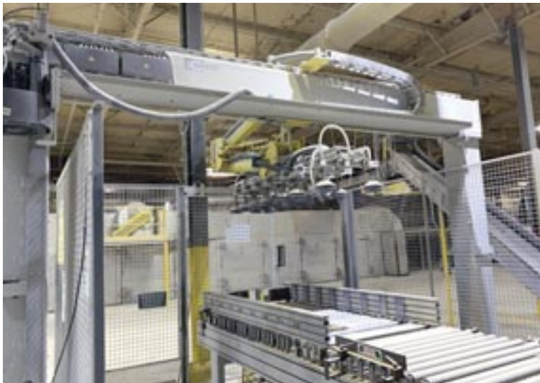
BARGSTEDT Vacuum Loader