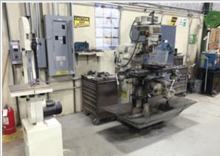
View of Maintenance Room