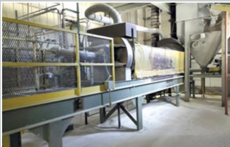
INCON PERLITE Expander (Natural Gas)