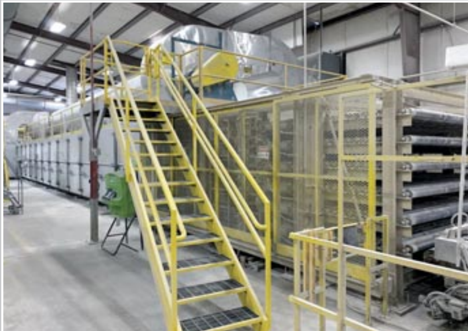
AKI 13-Zone Dryer