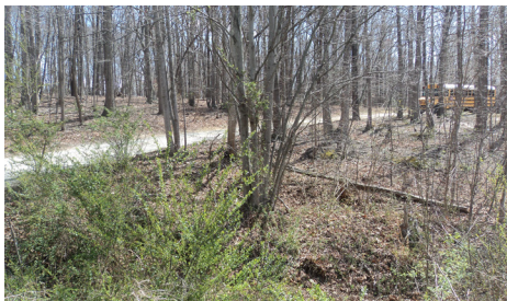
Lots 29-33 Pinecrest, Amherst ABSOLUTE AUCTION