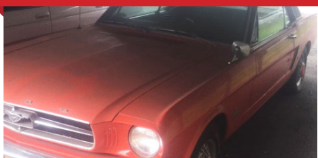
1965 Ford Mustang