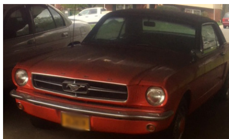
1965 Ford Mustang ABSOLUTE AUCTION

Sale Site: 828 Main St, Lynchburg VA 8th floor (Bank of the James Building)