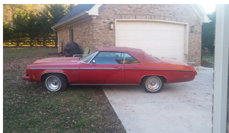
1973 Oldsmobile 88 Convertible ABSOLUTE AUCTION