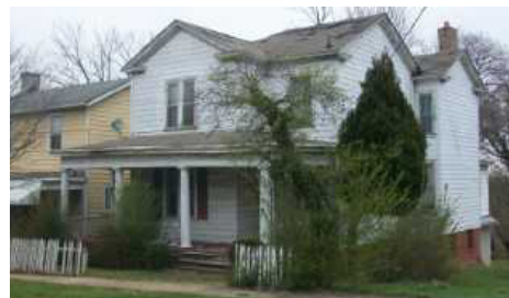
920 & 922 Wise St, Lynchburg REAL ESTATE AUCTION