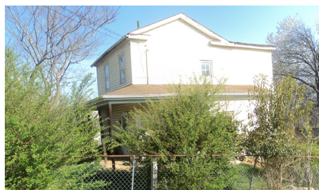
201 Chambers St, Lynchburg COURT ORDERED AUCTION