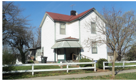
803 Pierce St, Lynchburg COURT ORDERED AUCTION