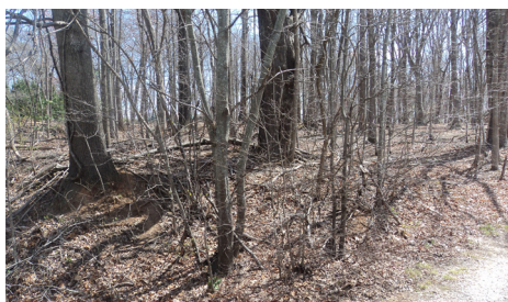
Lots 57-59 Pinecrest, Amherst ABSOLUTE AUCTION