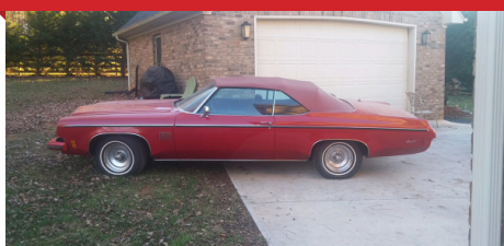
1973 Oldsmobile 88