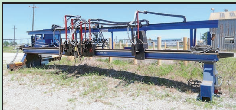
SHAPESTAR CNC PLASMA/OXY-FUEL SHAPE CUTTING MACHINE