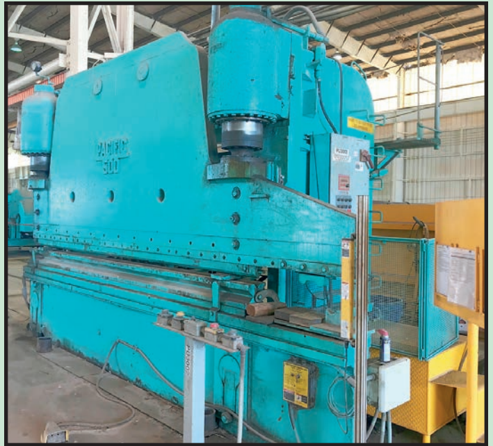
PACIFIC 500 T. X 17' MDL. #11 HYDRAULIC PRESS BRAKE