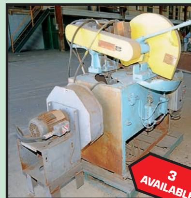
EVERETT ABRASIVE CUTOFF SAW