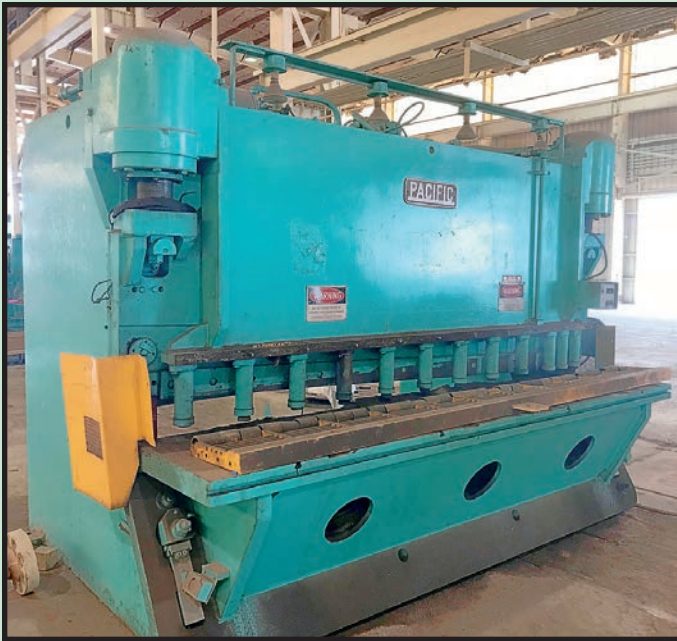
PACIFIC 10' X 1/2" HYDRAULIC PLATE SHEAR