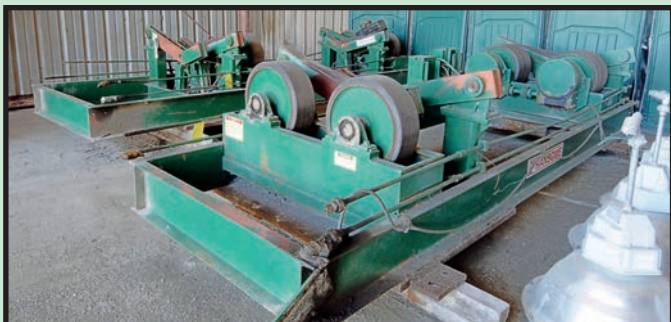
RANSOME UNITIZED TURNING ROLL SET