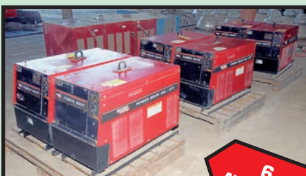
LINCOLN POWERWAVE 455/STT WELDING POWER SUPPLIES

Go to www.pmi-auction.com and click on BidSpotter.com on our calendar page for this auction sale.