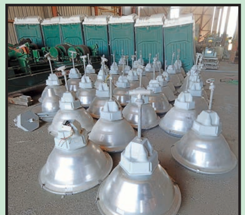
HID LIGHTING AND PORTABLE TOILETS

TUESDAY, JUNE 18 BIDS START CLOSING AT 10:00 A.M.