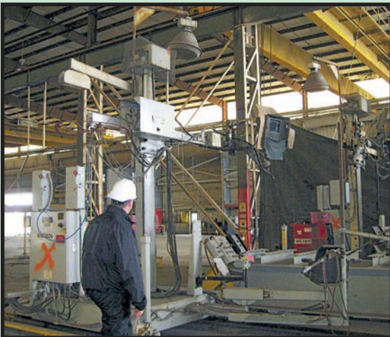
PLATE GIRDER FABRICATION SYSTEMS

NOTE: Original build sheets and capacity charts for these rolls are available on our website.