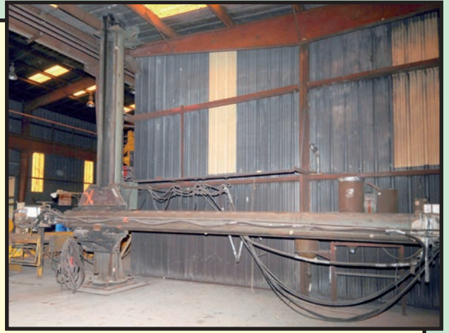
RANSOME 18' X 12' MANIPULATOR