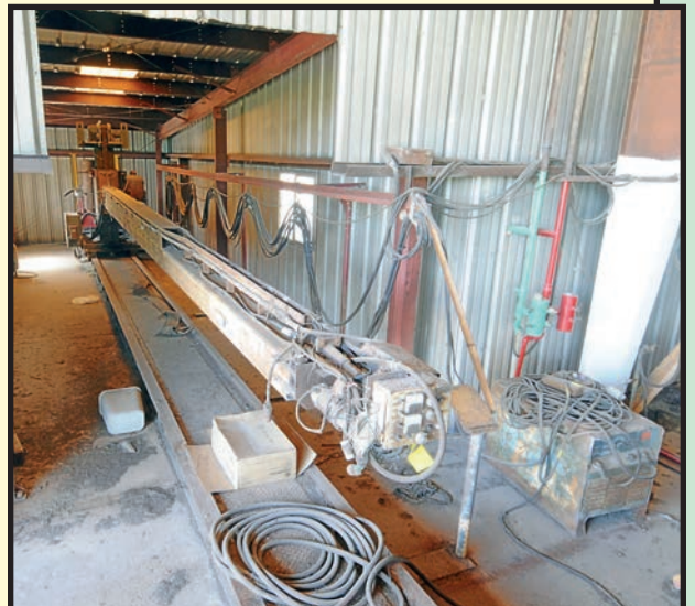
INTERNAL SUBARC SEAMER

CUSTOM INTERNAL SUBARC SEAMER , 30' max. seam length, Lincoln Mdl. NA3N subarc weld controller, Lincoln Mdl. DC1000 welding power supply, approx. 36" mandrel adj., moving carriage.