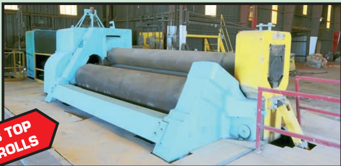
BERTSCH 160" X 2-1/4" MDL. #30 INITIAL PINCH PLATE ROLL

Read Partial Terms and Conditions on Back Page of Brochure