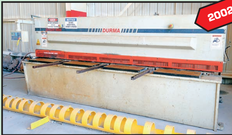
DURMA 13' X 1/4" HYDRAULIC SHEAR