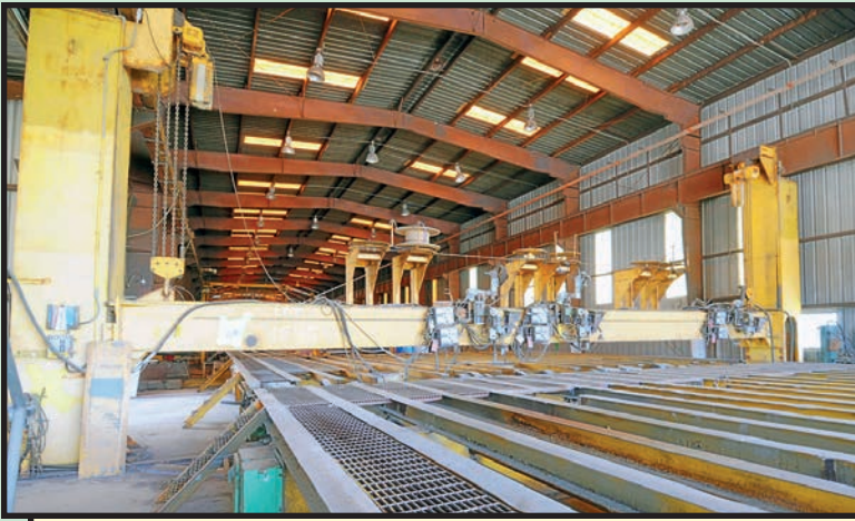
GIRTH SEAM WELDER