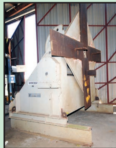
ARONSON 50,000-LB. WELDING POSITIONER

(3) EVERETT MDL. 20-DM-22 , 22" dia. blade, 20 HP drive motor, 1 HP exhaust fan system, fabricated steel base, miter capability, pneu. chain vise, S/N 99-1646, S/N 99-9645, S/N 5-9084.