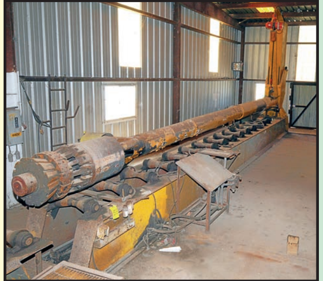
HYDRAULIC PIPE SHELL RE-ROUNDER