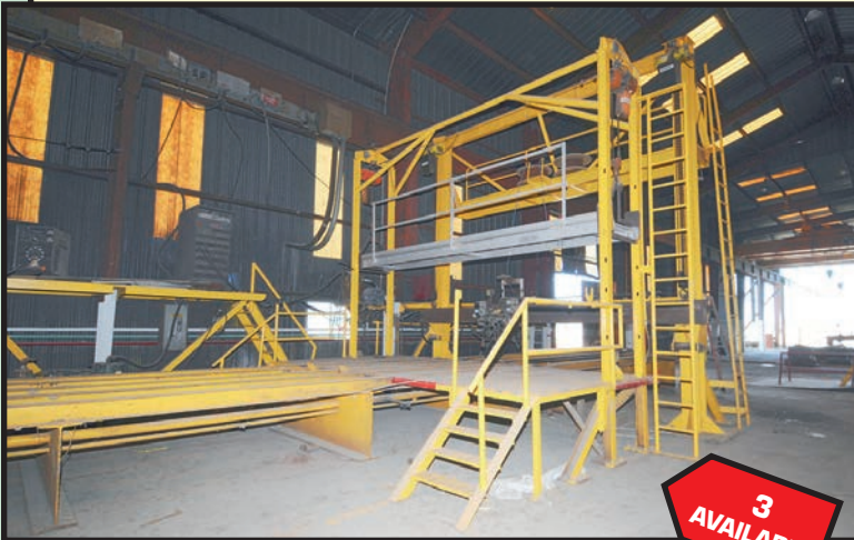
SIDE BEAM WELDING SYSTEM