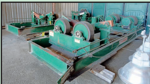
RANSOME UNITIZED TURNING ROLL SET