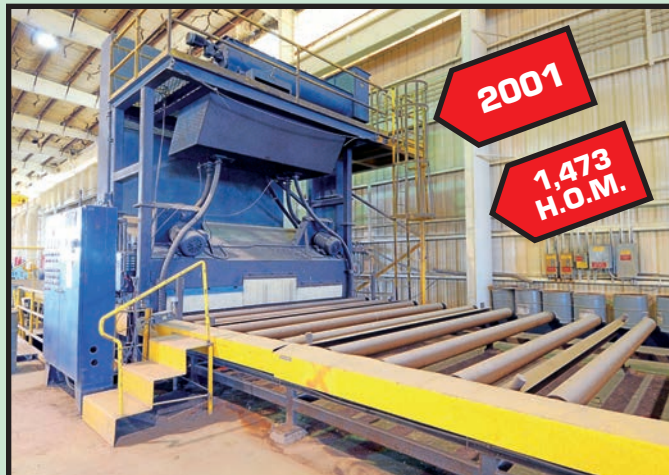
BLAS-TEC 12' PLATE AND STRUCTURAL BLAST MACHINE