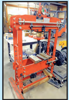
JET HYDRAULIC H-FRAME PRESS