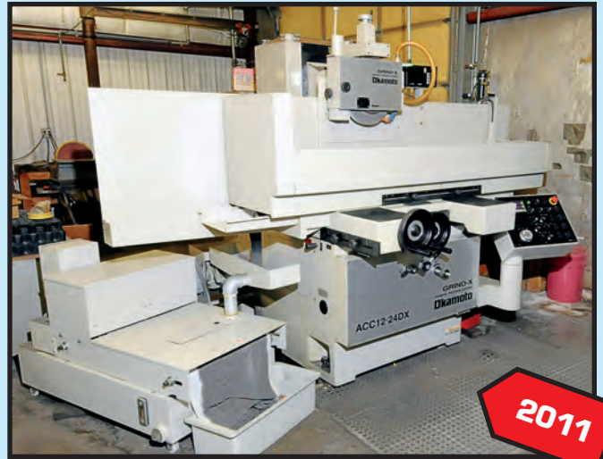
OKAMOTO MDL. ACC-12-24DX AUTOMATIC SURFACE GRINDER