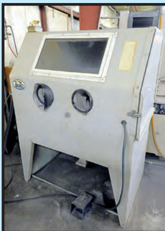
SKAT BLAST GLOVEBOX BLAST CABINET