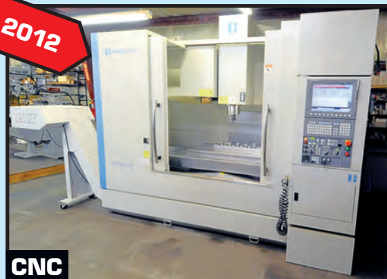
< HARDINGE BRIDGEPORT MDL. GX1000 OSP VERTICAL MACHINING CENTER