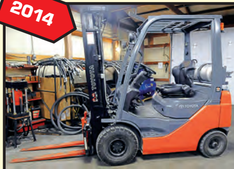
TOYOTA 3,000-LB. LPG FORKLIFT

Read Partial Terms and Conditions on Back Page of Brochure