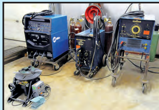
VIEW OF WELDING MACHINES AND POSITIONER