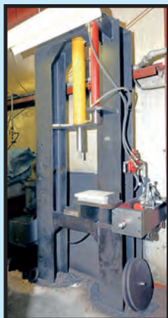
CUSTOM HYDRAULIC BROACHING PRESS