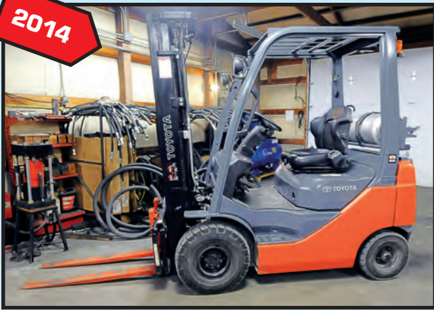
TOYOTA 3,000-LB. LPG FORKLIFT