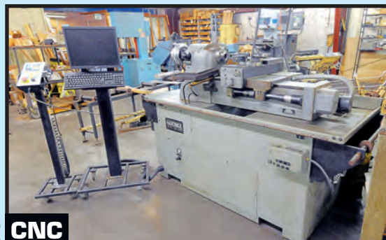
> HARDINGE/CENTROID CNC CHUCKER