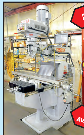
< ACER "E-MILL" VERTICAL TURRET MILLING MACHINE