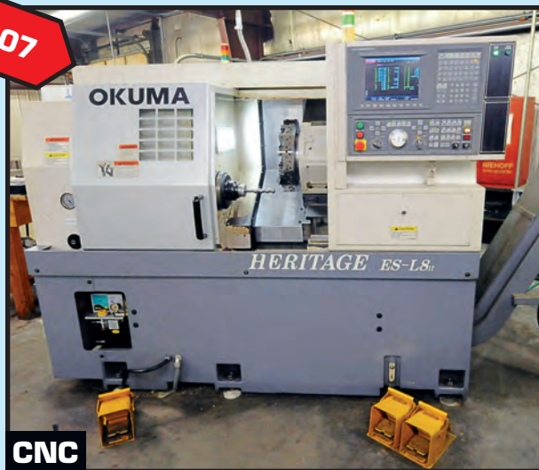
> OKUMA HERITAGE ES-L8II CNC LATHE