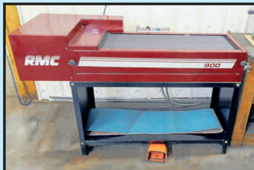
RMC BELT GRINDER