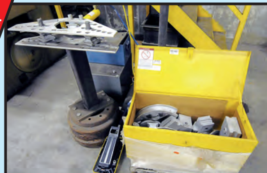
HYDRAULIC PIPE AND CONDUIT BENDER