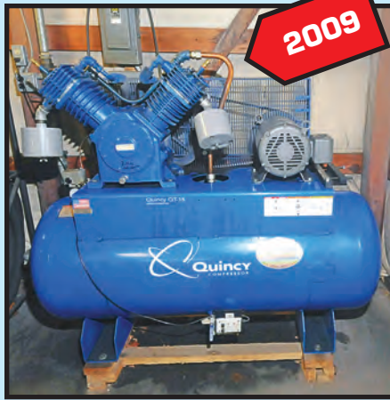
QUINCY 15 HP AIR COMPRESSOR