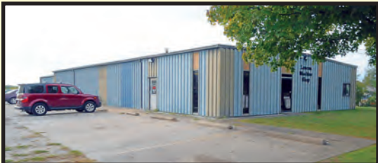
INDUSTRIAL REAL ESTATE FOR SALE AT AUCTION

BUYER'S PREMIUM: 15% ON-SITE 18% WEBCAST