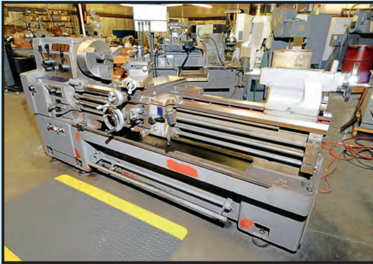
WEBB 17" X 60" GAP BED LATHE