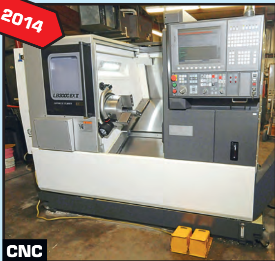
< OKUMA SPACE TURN LB3000EXII CNC LATHE