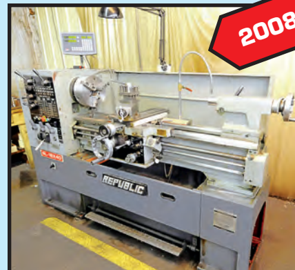
REPUBLIC 16" X 40" GAP BED LATHE