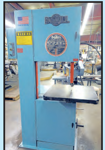
DOALL MDL. 2013-V VERTICAL BANDSAW