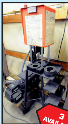
HYDRAULIC HOSE CRIMPING MACHINE