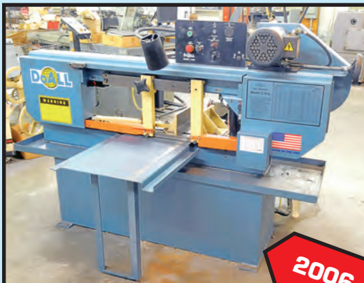
DOALL MDL. C-916 SEMI-AUTOMATIC HORIZONTAL BANDSAW