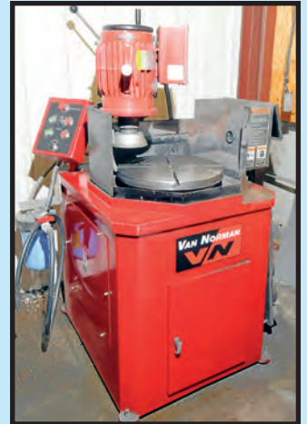
VAN NORMAN FLYWHEEL GRINDER

INSPECTION: Monday, December 3, 9:00 A.M. to 4:00 P.M. & Morning of Sale