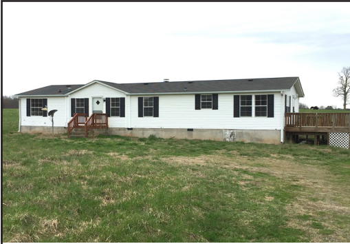
3729 Henrico Rd, Buffalo Junction VA Mecklenburg County