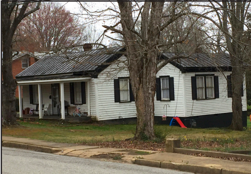
423 W. Sycamore St, Chase City Mecklenburg County