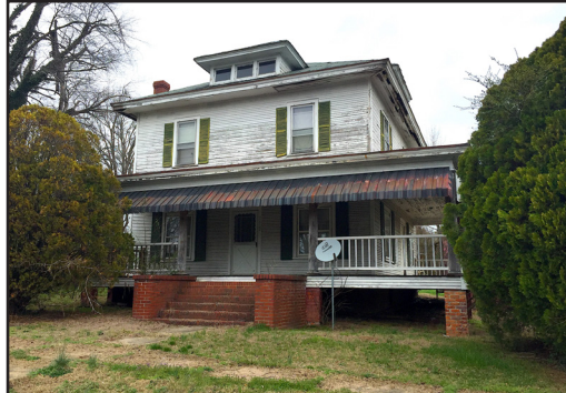
1620 Lee Ave, Victoria VA Lunenburg County