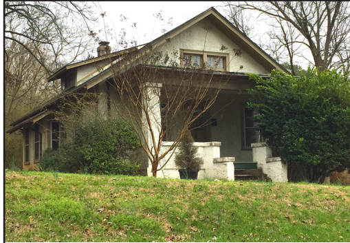
823 N. Main St, Chase City Mecklenburg County