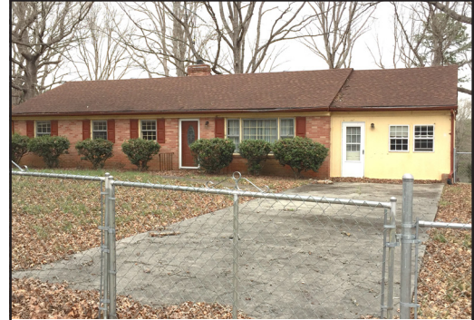
245 Evergreen Rd, Clarksville VA Mecklenburg County