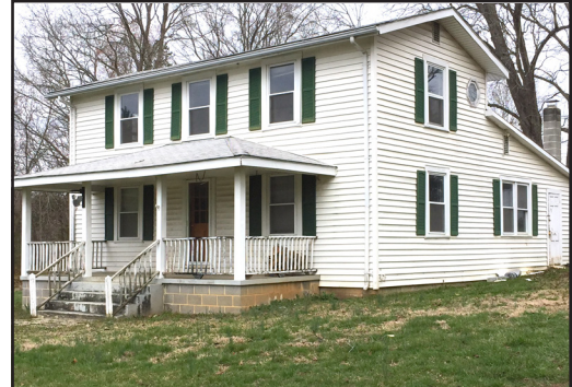
6897 Double Bridges Rd, Victoria VA Lunenburg County