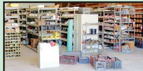
SAMPLE VIEW OF NEW PARTS INVENTORY