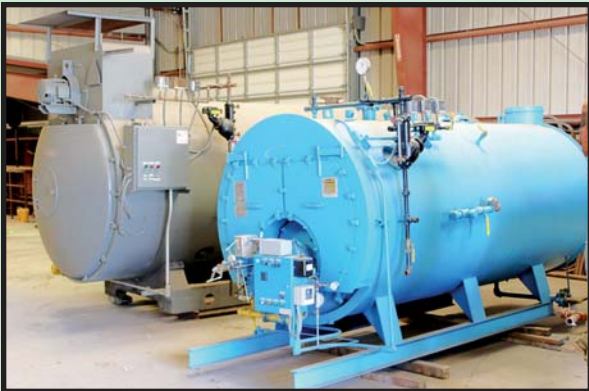
CONTINENTAL AND MOHAWK STEAM BOILERS