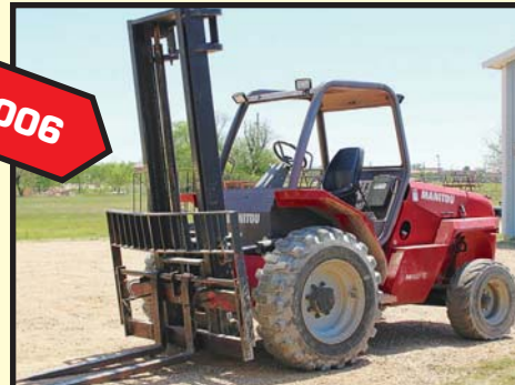
MANITOU 8,000-LB. CAP., 974 H.O.M. ROUGH TERRAIN FORKLIFT