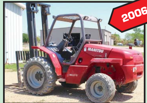
MANITOU 8,000-LB. CAP. ROUGH TERRAIN FORKLIFT