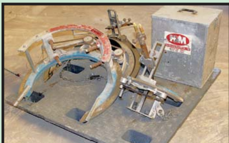
PIPE BEVELING MACHINES