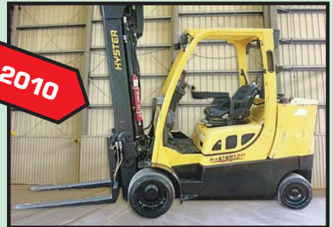
HYSTER 12,000-LB. CAP. FORKLIFT