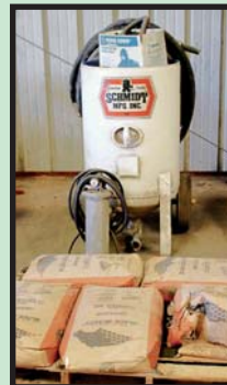
SCHMIDT SANDBLAST POT