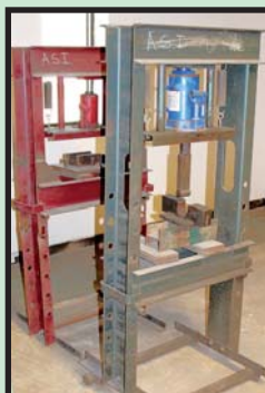
20 T. H-FRAME PRESSES