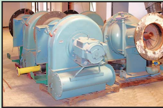
> (4) INDUSTRIAL COMBUSTION BOILER BURNERS