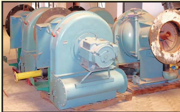
(4) INDUSTRIAL COMBUSTION BOILER BURNERS

Plant Downsizing, Selling Assets for the Continuing Operations of