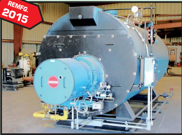
< ECLIPSE 350 HP STEAM BOILER