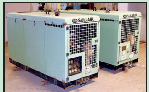
(2) SULLAIR PORTABLE AIR COMPRESSORS