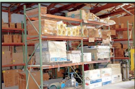
REFRACTORY AND INSULATION