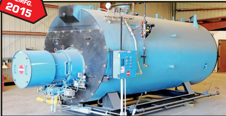
ECLIPSE 350 HP STEAM BOILER