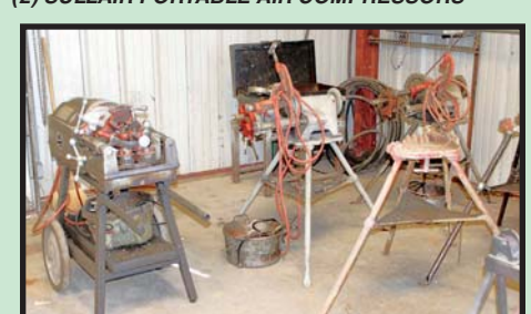
SAMPLE VIEW OF RIDGID PIPE THREADERS