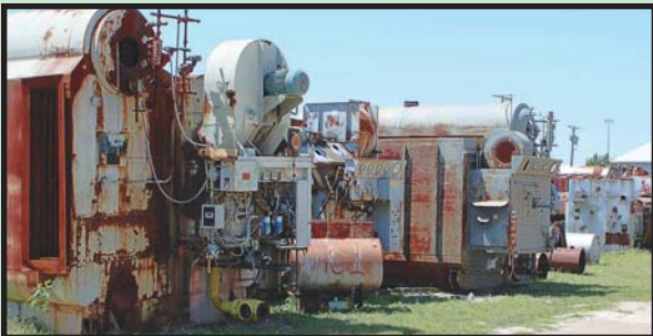
CLEAVER BROOKS, CONTINENTAL AND TRANE MURRAY STEAM BOILERS