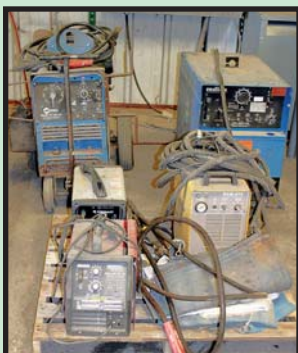
SAMPLE VIEW OF WELDERS