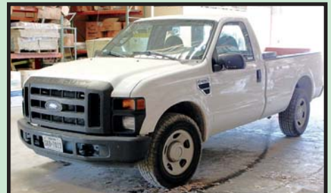
2008 FORD F-350 SUPER DUTY XL PICKUP TRUCK