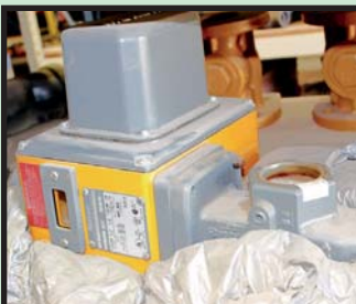
< SAMPLE VIEW OF MAXON VALVES