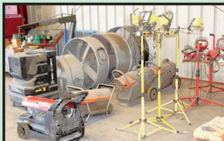
SAMPLE VIEW OF SHOP EQUIPMENT