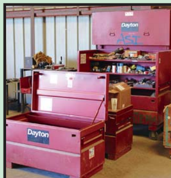
CONTRACTORS TOOL BOXES