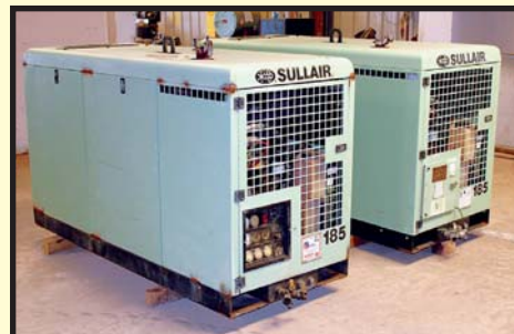
(2) SULLAIR PORTABLE AIR COMPRESSORS