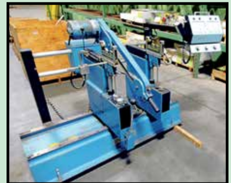
STEWART WARNER BALANCER

On-Site Bidding in Nashville, TN or Bid Via Webcast at