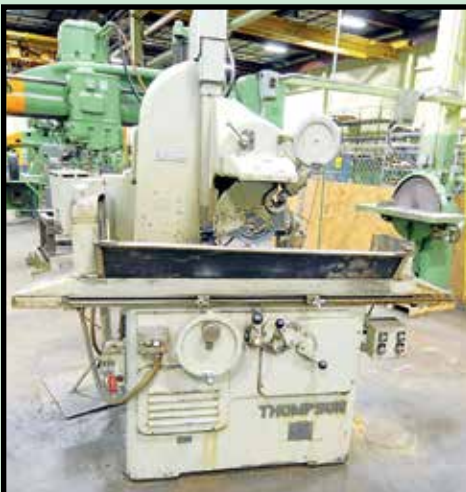
THOMPSON 8" X 24" HYDRAULIC SURFACE GRINDER

PRATT & WHITNEY MDL. 2A JIG BORER, 22" x 44" tbl., 2-axis D.R.O., spds.: 37-1,800 RPM, S/N 26159; DAVIS MDL. 15A AUTOMATIC KEYSEATER, overarm suppt., assorted keyseater tooling, S/N 15-449; STEWART WARNER 500-LB. CAP. MDL. 2000 ROTATIONAL BALANCE MACHINE, Analog electronics, approx. 56" swing, hard bearing design, approx. 48" max. dist. btwn. supports, S/N 347497; CRANE LAPMASTER 36" MDL. 36 LAPPING MACHINE, (3) 16" dia. conditioning rings, cycle timer, fluid controls, S/N 835189; SUNNEN MDL. MBB1600 HONING MACHINE, assorted honing mandrels, S/N 44766; BOYER SCHULTZ NO. 2 DUAL SPDL. PROFILE GRINDER w/cabinet base, S/N 2768; CINCINNATI ROYAL 18" DRILL PRESS, adj. ht. tbl.; WHITNEY JENSEN 6" MDL. 614 LEAF BRAKE, S/N 432-269; DAKE MDL. 501 RATCHET STYLE ARBOR PRESS, swing-away bed sections; KENT COLLINS 24" MDL. RT DISC SANDER, large tilting tbl., S/N 5045; PORTER-CABLE 9" H.D. BELT GRINDER, approx. 5 HP drive motor, tilt tbl.; POWERMATIC 12" DISC SANDER; POWERMATIC 20" MDL. 1200 DRILL PRESS, CUSTOM COMBINATION HYDRAULIC PRESS BRAKE AND SHEAR, for strip material, self-contained hyd. unit, 4-3/4" max. material width, 1/4" max. material thickness.