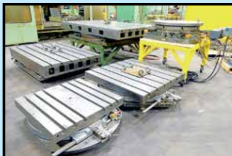
VIEW OF AIRLIFT ROTARY TABLES