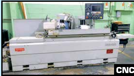
TOYODA MDL. GE4A-100 CNC ANGLE HEAD GRINDER