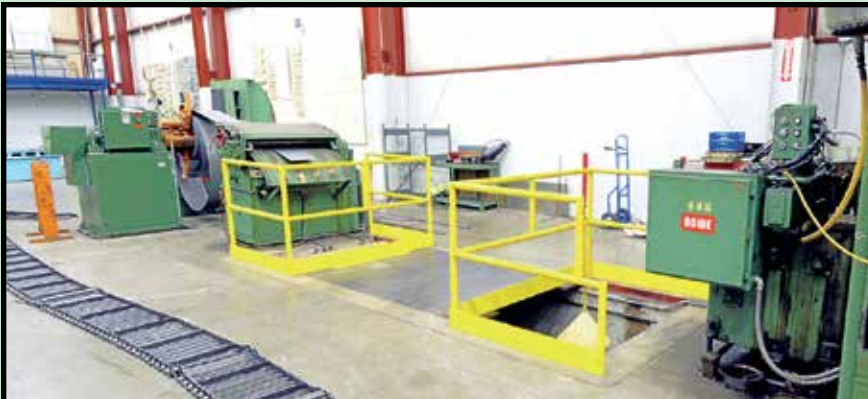
30" ROWE SERVO FEED LINE