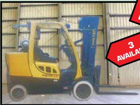
(1 OF 3) HYSTER 12,000-LB. CAP. FORKLIFTS

On-Site Bidding in Nashville, Tennessee or Bid Via Webcast at BidSpotter.com