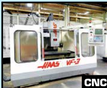
HAAS MDL. VF-3 CNC VERT. MACHINING CENTER