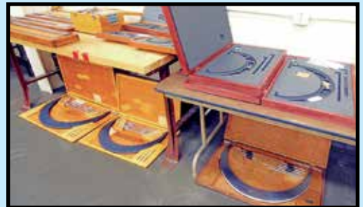
LARGE DIAMETER MICROMETERS

HUGE QTY. OF INCH/METRIC MEYER PIN GAUGES in (7) sorted multi-drawer cabinets; 1-2-3 BLOCKS ; THREADED RING AND PLUG GAUGES ; ASHCROFT PRESSURE TEST GAUGES ; DENSITY TESTING EQUIPMENT ; SARTORIUS MDL. CC50 BALANCE SCALE ; X-RAY VIEWING BOXES ; BOWERS METROLOGY HOLEMATIC BORE GAUGE SYSTEMS ; MITUTOYO MULTIPLE ANVIL BORE GAUGE SYSTEMS ; FLUKE TEST METERS ; OMEGA TEST METERS ; COATING THICKNESS GAUGES ; DIGITAL TACHOMETERS ; DIGITAL TEMPERATURE PROBES ; OXYGEN METERS ; MITUTOYO PORTABLE SURFACE TESTERS ; PRECISION HARDENED AND GROUND SQUARES ; MACHINE LEVELS ; END MEASURING RODS ; MITUTOYO DIGITAL END MEASURING RODS ; HUGE ASSORTED OF TRI-MICROMETER BORE GAUGES ; MITUTOYO TRI-MICROMETER BORE GAUGES ; BROWN & SHARPE DIGITAL BORE GAUGES ; SCHERR TUMICO AND MITUTOYO MICROMETERS up to 24" w/interchangeable anvils; VERNIER AND DIGITAL CALIPERS up to 40"; PLA-CHEK HT. GAUGES ; MITUTOYO HT. STANDARD ; DIGITAL DIAL TYPE AND VERNIER HT. GAUGES ; GAUGE BLOCKS ; OLYMPUS IPLEX MXR DIGITAL BORESCOPE ; OLYMPUS IF6D4 INDUSTRIAL FIBER SCOPE ; (2) ARMSTRONG TOOL COMPUTORQ MDL. 6004CFII ELECTRONIC TORQUE WRENCHES , 60 to 600 ft./lb.; (3) ARMSTRONG TOOL COMPUTORQ MDL. 2503CFII ELECTRONIC TORQUE WRENCHES , 25 to 250 ft./lb.; ARMSTRONG TOOL COMPUTORQ MDL. 64-552 ELECTRONIC TORQUE WRENCH , .4 to 4 ft./lb.; OTHER ASSORTED TORQUE EQUIPMENT ; HUGE ASSORTMENT OF HARDENED AND GROUND PARALLELS of every size; 6" DIA. X 48"H. PRECISION CYLINDER SQUARE w/wooden case.