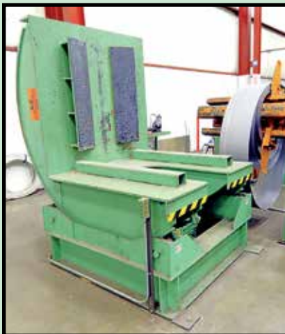
BUSHMAN COIL TIPPER