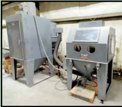
TRINCO CABINET BLAST W/DUST COLLECTOR