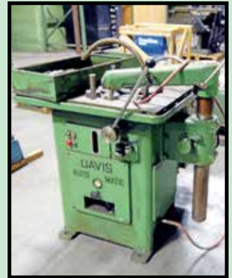
DAVIS MDL. 15A KEYSEATER