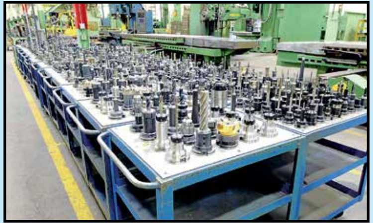
THOUSAND'S OF CAT-50 TAPER TOOL HOLDERS