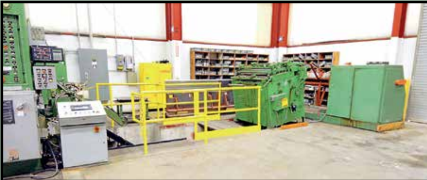
60" SERVO FEED LINE