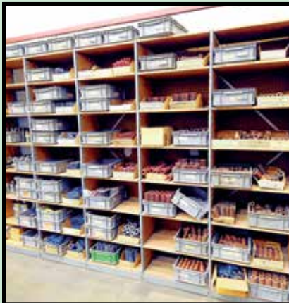
LARGE ASSORTMENT OF DIE SPRINGS AND NITROGEN CYLINDERS