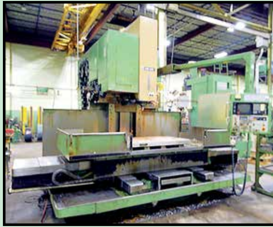
MORI SEIKI MDL. MV-80 VERT. MACHINING CENTER