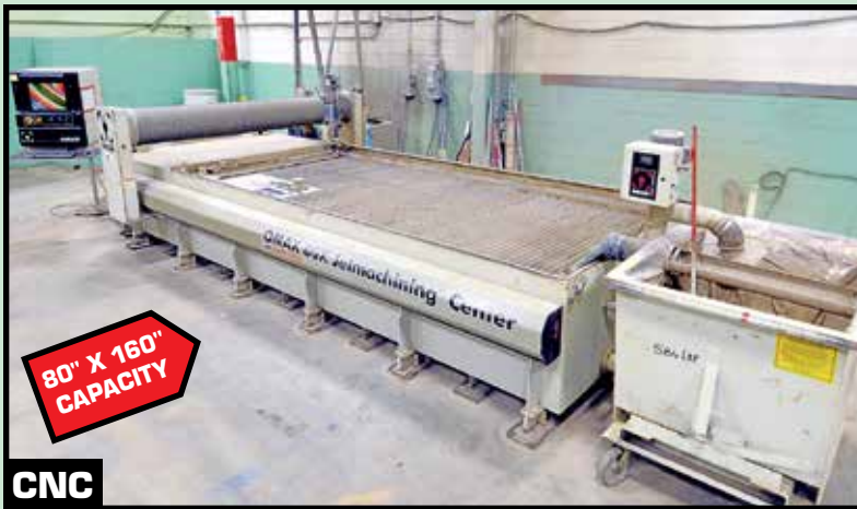
OMAX MDL. 80X CNC WATERJET CUTTING MACHINE