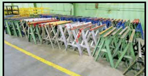
STEEL AND ALUMINUM HORSES