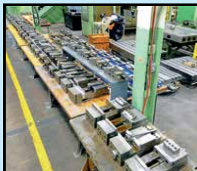
HUGE QTY. OF MACHINE VISES

VISIT OUR WEBSITE FOR ADDITIONAL DETAILED PHOTOS, ASSORTED VIDEO DEMONSTRATIONS & OVERALL FACILITIES FLYOVER AT www.pmi-auction.com