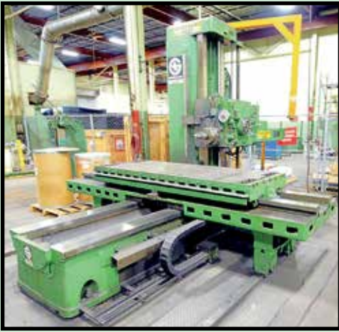
4" GIDDINGS & LEWIS FRASER TABLE TYPE HORIZ. BORING MILL