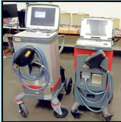
SPECTROTEST PORTABLE SPECTROMETER SYSTEMS