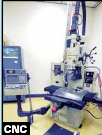
MOORE MDL. 450-CP CNC JIG GRINDER