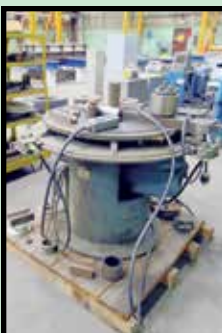
PEDRICK MDL. A7 ROTARY BAR BENDER 12

CALL 1-800-282-8466 FOR A CONFIDENTIAL CONSULTATION