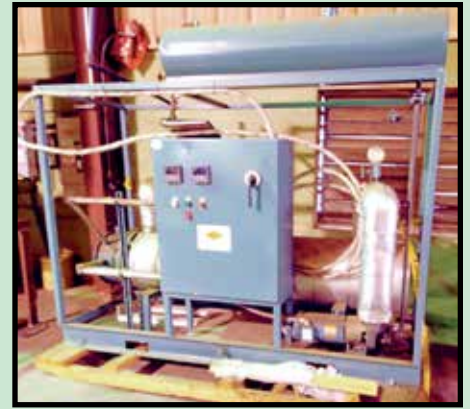
PACKAGE BOILER UNIT