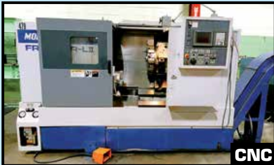
MORI SEIKI FRONTIER LII CNC LATHE