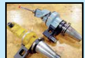
ANGULAR TOOL HOLDERS