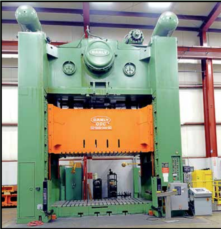
DANLY MDL. S2-800-144-60 QDC STRAIGHT SIDE PRESS