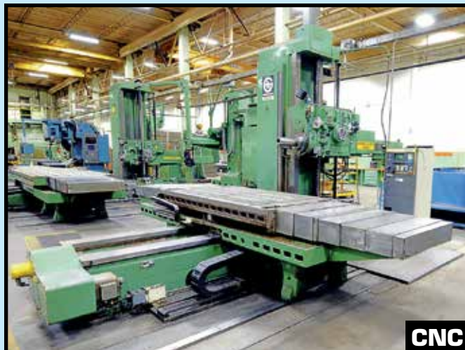
5" CINCINNATI GILBERT CNC TABLE TYPE HORIZ. BORING MILL