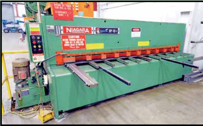
NIAGARA 10' X 1/4" HYDRAULIC SHEAR