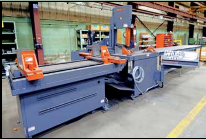
HEM MDL. VT100 HLA 60TS TILT FRAME VERT. BAND SAW