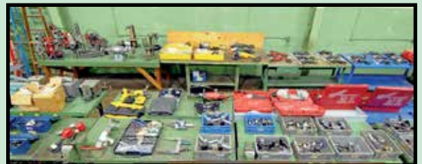
HUGE ASSORTMENT OF POWER TOOLS