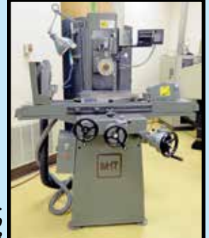
MITSUI HANDFEED SURFACE GRINDER