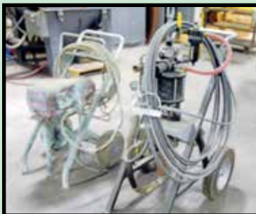
AIRLESS PAINT SPRAY EQUIPMENT

BOTTLE JACKS; ENERPAC HYDRAULIC POWER SUPPLIES; JACK HEADS up to 100 T. cap.; EXTENDED HOLLOW SPDL. JACK HEADS ; (2) MILWAUKEE MAGNETIC BASE DRILLS ; BLACK & DECKER MAGNETIC BASE DRILLS ; BALDOR BUFFING HEADS ; NEW DEWALT 6" ANGLE GRINDERS in box; 4" ANGLE GRINDERS by Metabo, Milwaukee and Dewalt; NEEDLE SCALERS ; BLACK & DECKER STRAIGHT GRINDER w/flap wheel; (3) POLYDEX PTX FLAP WHEEL GRINDERS ; ELECTRIC DRILLS ; HECK MDL. 9000 BEVEL MILL ; PECK MDL. 5000 BEVEL MILL ; ELECTRIC NIBBLERS ; MILWAUKEE PORTABLE BANDSAWS ; MILWAUKEE RECIPROCATING SAW ; MILWAUKEE CARBIDE SAW ; ELECTRIC POP RIVET GUNS ; L-BAR SEALERS ; DYNABRADE PNEUMATIC BELT SANDERS ; INGERSOLL RAND RIGHT ANGLE PNEUMATIC GRINDERS ; EAGLE PNEUMATIC ANGLE GRINDERS ; INGERSOLL RAND PNEUMATIC STRAIGHT AND RIGHT ANGLE SANDERS AND GRINDERS ; PNEUMATIC DRILLS ; HAMMERS ; TEES ; HANDLED HEX WRENCHES ; SOFT BLOW HAMMERS ; MEASURING TAPES ; BRUSHES ; SAWS ; SCREWDRIVERS ; PLIERS .