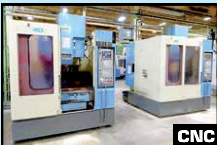
(2) OKK MDL. PCV40II CNC VERT. MACHINING CENTERS