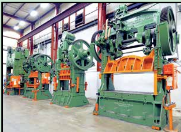
VIEW OF TRY-OUT PRESSES

(2) OKAMOTO LINEAR 6" X 18" MDL. PFG450C HAND FEEDS , 6" x 18" fine line electromagnetic chuck, 1 HP direct drive spd., cast iron base, S/N 60005, S/N 60007.