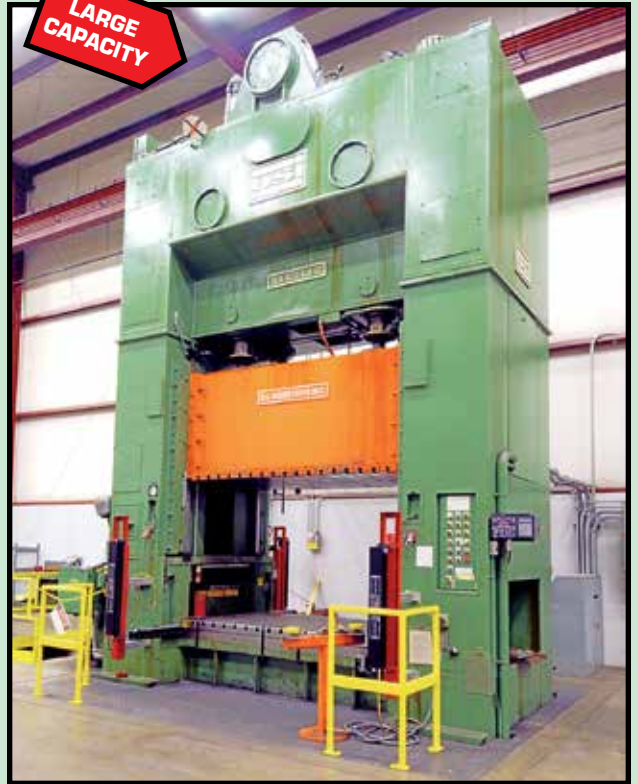
USI CLEARING MDL. SE4-600-108-60 STRAIGHT SIDE PRESS