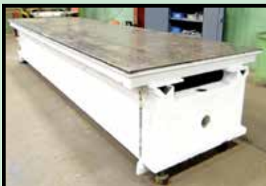
PRECISION WELDING TABLE