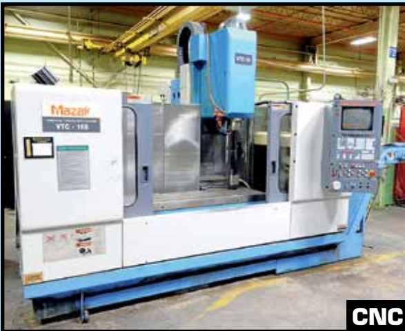
MAZAK MDL. VTC-16B CNC VERT. MACHINING CENTER