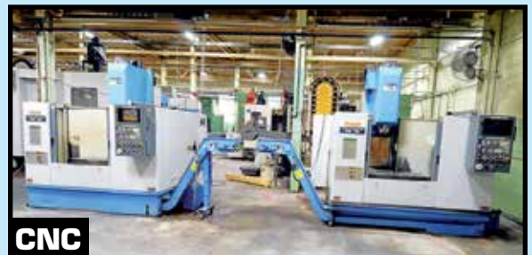
(2) MAZAK MDL. VTC-16A CNC VERT. MACHINING CENTERS