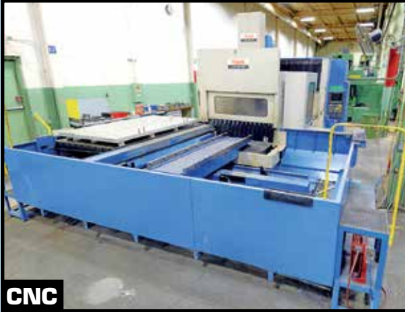
MAZAK MDL. AJV-60/80 CNC TWIN PALLET BRIDGE TYPE VERT. MACHINING CENTER