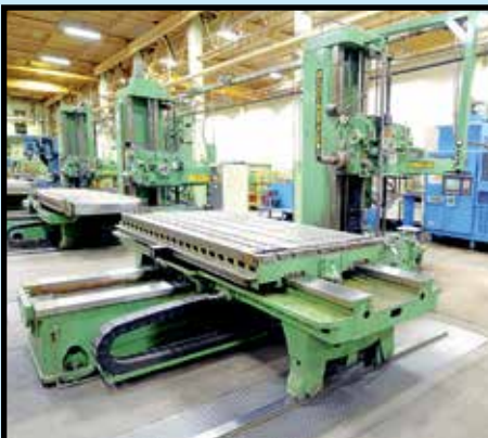
4" GIDDINGS & LEWIS MDL. 340T TABLE TYPE HORIZ. BORING MILL