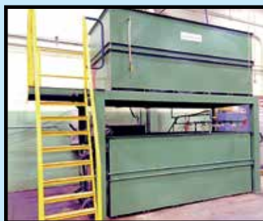
COOLANT RECYCLING SYSTEM