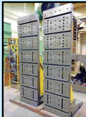
WRIGHT 84" X 24" X 32" ANGLE PLATE SET