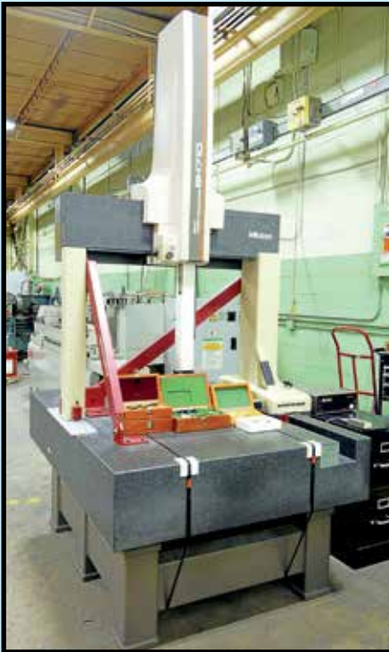
MITUTOYO BH710 COORDINATE MEASURING MACHINE