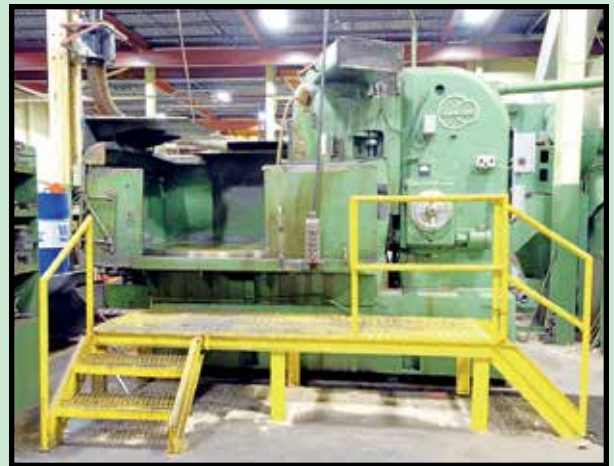
60" BLANCHARD VERT. ROTARY SURFACE GRINDER