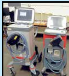
< SPECTROTEST PORTABLE SPECTROMETER SYSTEMS

Read Partial Terms and Conditions on Back Page of Brochure