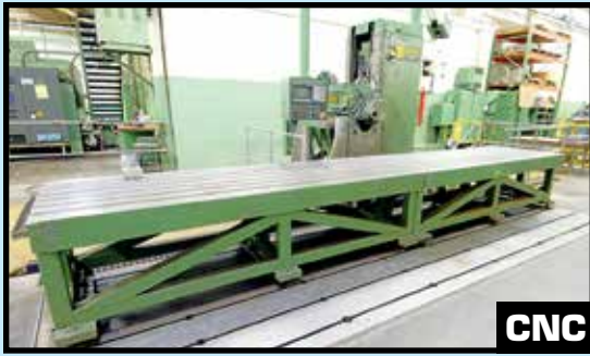
ZAYER 236" TRAVELING COLUMN CNC BED TYPE MILLING MACHINE