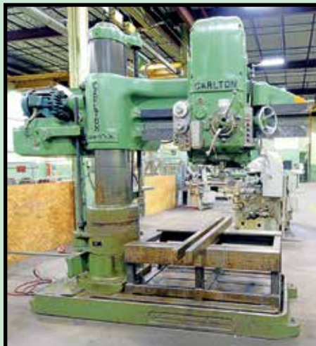
CARLTON 5' X 15" RADIAL ARM DRILL