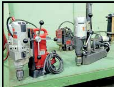
MAGNETIC BASE DRILLS