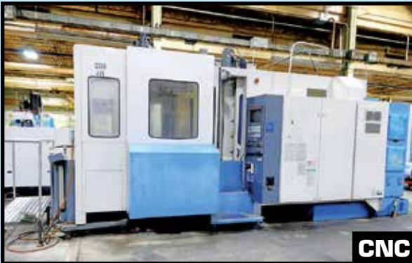
MAZAK MDL. FH680 CNC HORIZ. MACHINING CENTER