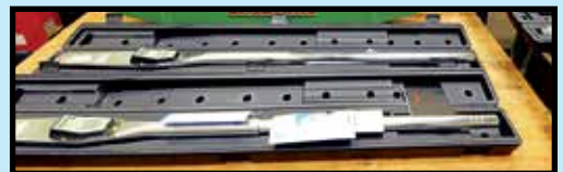
DIGITAL TORQUE WRENCHES