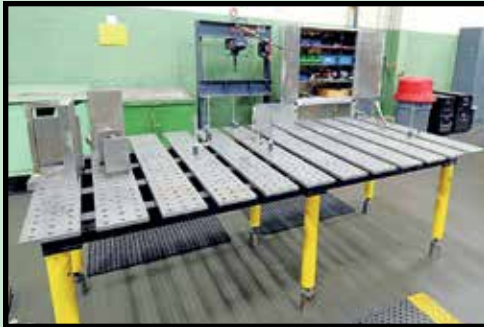
PRECISION WELDING FIXTURE TABLE