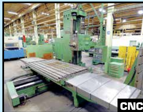
5" GIDDINGS & LEWIS FRASER CNC TABLE TYPE HORIZ. BORING MILL