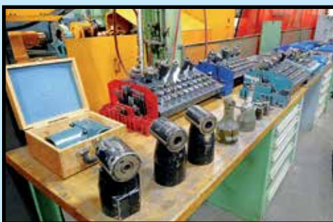
MILLING MACHINE ACCESSORIES