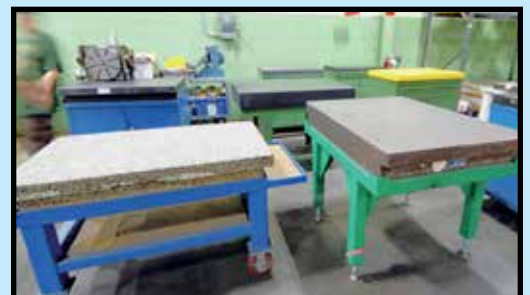
GRANITE SURFACE PLATES