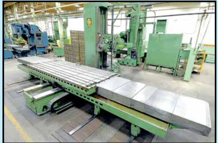
5" GIDDINGS & LEWIS MDL. 70A-DP5-T TABLE TYPE HORIZ. BORING MILL