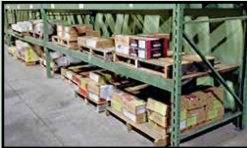
HUGE ASSORTMENT OF WELDING WIRE