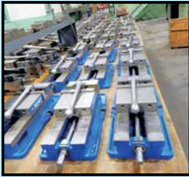
(OVER 60) KURT VISES