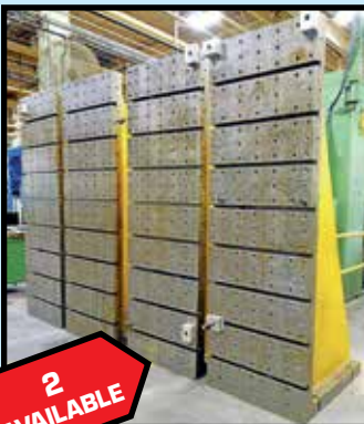
WRIGHT 106" X 36" X 40" ANGLE PLATE SETS

(4) WRIGHT INDUSTRIES 26-1/2"W. X 60"L. X 30"H. SET-UP BLOCKS , T-slotted top, drilled and tapped on 2" centers on the periphery, arranged to be keyed together w/leveling pockets.