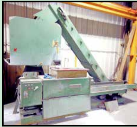
ALMCO VIBRATORY DEBURRING SYSTEM