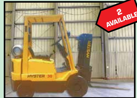
(1 OF 2) HYSTER 3,000-LB. CAP. FORKLIFTS