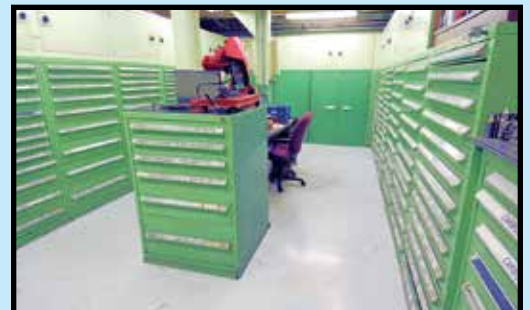
LARGE HIGH QUALITY EXPENDABLE TOOL CRIB