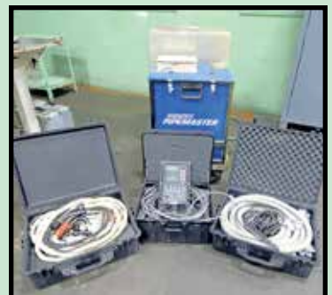
PIPEMASTER ORBITAL WELDING SYSTEM