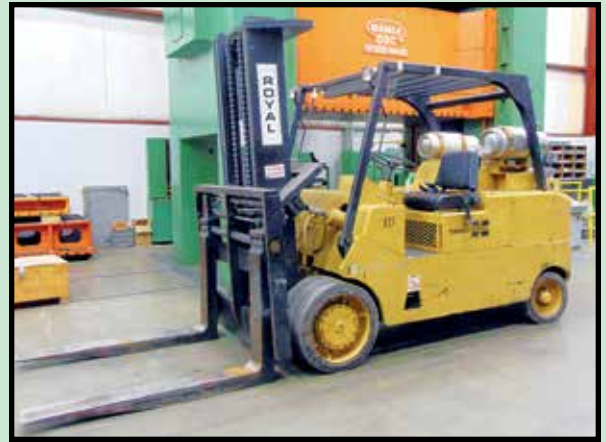
ROYAL 25,000-LB. CAP. FORKLIFT

GENIE MDL. Z30/20 , 796 H.O.M., 20' reach, 30' max. ht., electric, new batteries, S/N Z30-3177.