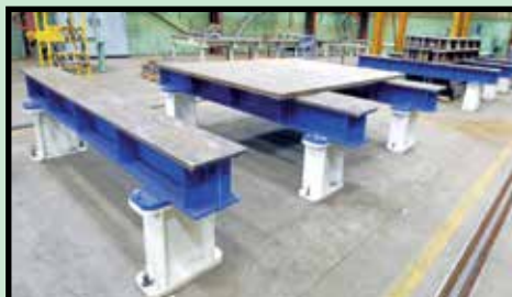
PRECISION GROUND STEEL SET-UP HORSES