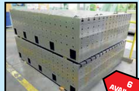
WRIGHT 24" X 88" X 24" PRECISION SET-UP BLOCKS