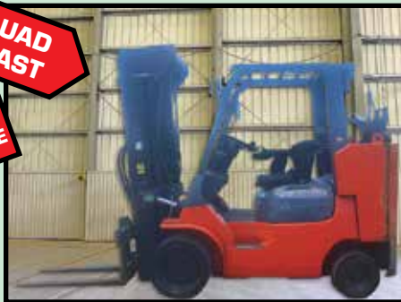
TOYOTA 10,000-LB. CAP FORKLIFT