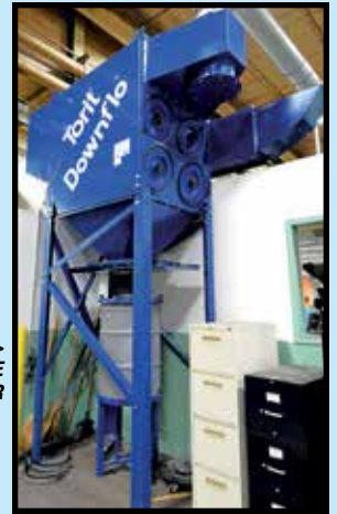
> TORIT CARTRIDGE-STYLE DUST COLLECTOR

Tuesday, July 10, 9:00 A.M. to 4:00 P.M. & Morning of Sales