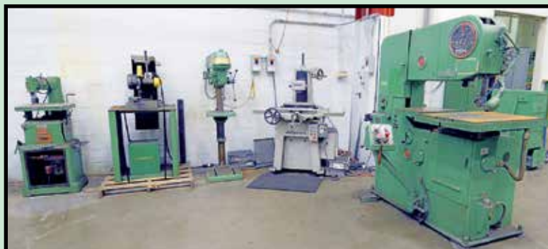
MISCELLANEOUS TOOLROOM MACHINES