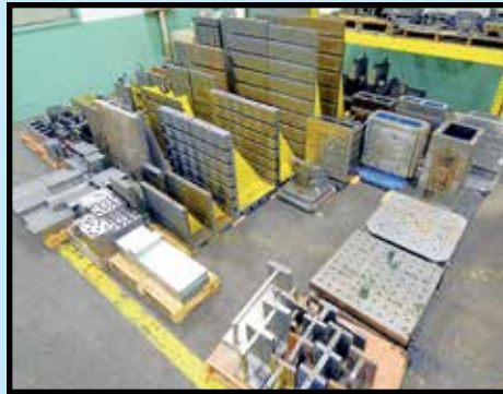
< PRECISION SET-UP ACCESSORIES

Tuesday, July 10, 9:00 A.M. to 4:00 P.M. & Morning of Sales