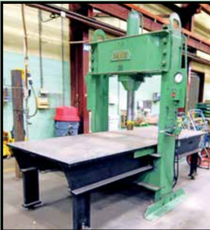
DAKE PLATE STRAIGHTENING PRESS