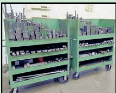
DIE SET UP CARTS