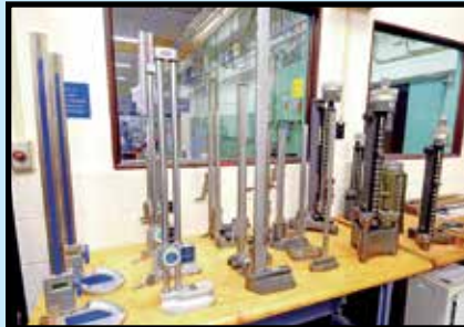
PRECISION HEIGHT GAUGES

Tuesday, July 10, 9:00 A.M. to 4:00 P.M. & Morning of Sales