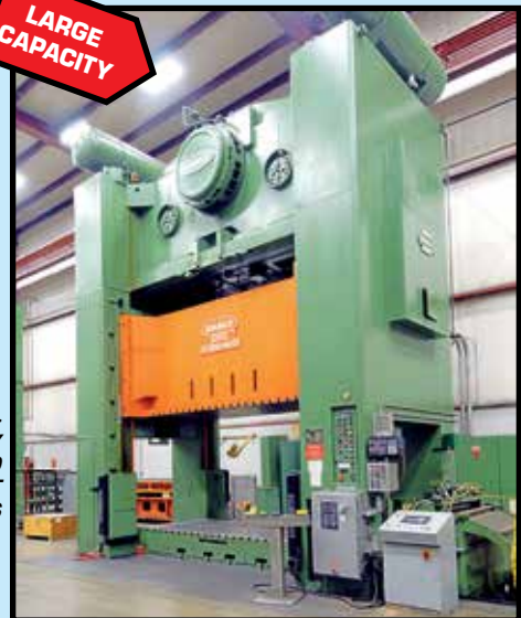
> DANLY MDL. S2-800-144-60 STRAIGHT SIDE PRESS