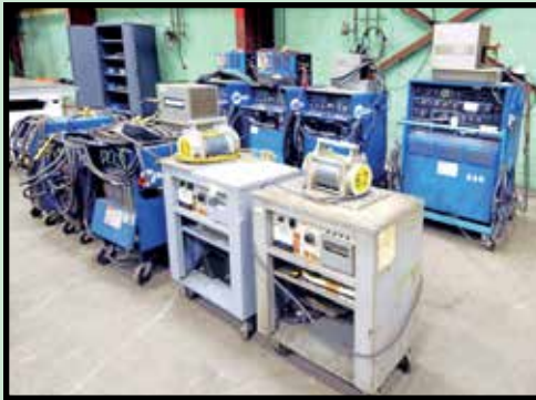
VIEW OF WELDERS AND STRESS RELIEVERS