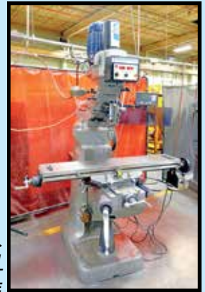
BRIDGEPORT SERIES 1 VERT. TURRET MILLING MACHINE