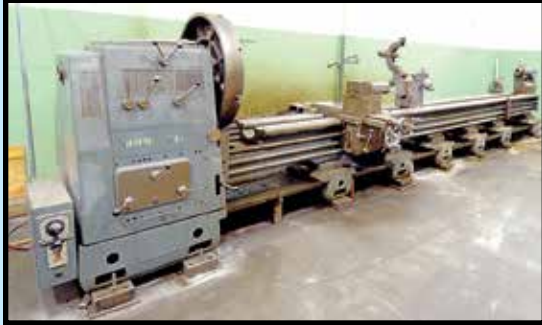
MEUSER 36" X 20' GAP BED ENGINE LATHE