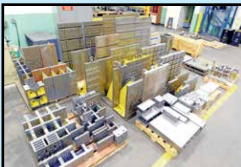
PRECISION SET-UP ACCESSORIES