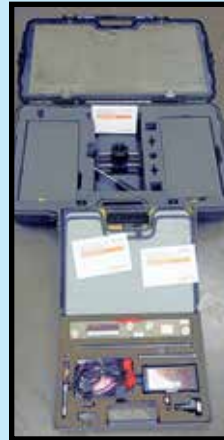
RENISHAW BALL BAR AND LASER SYSTEMS