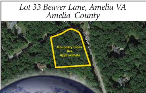
Lot 33 Beaver Lane, Amelia VA Amelia County

Additional information & preview dates available online! Live On-Site Auction - Online Bidding Offered www.countsauction.com