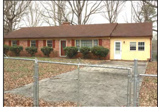
245 Evergreen Rd, Clarksville VA Mecklenburg County