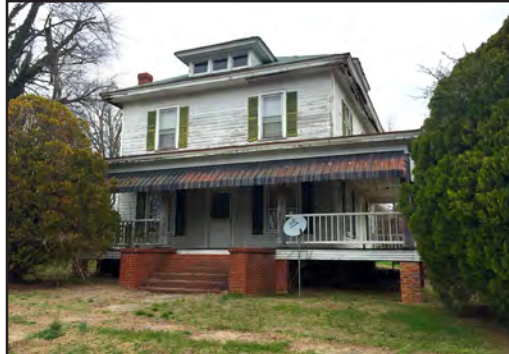
1620 Lee Ave, Victoria VA Lunenburg County