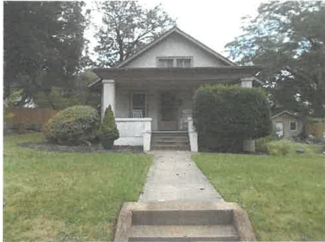
Main Structure Photo