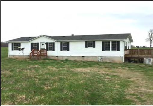
3729 Henrico Rd, Buffalo Junction VA Mecklenburg County