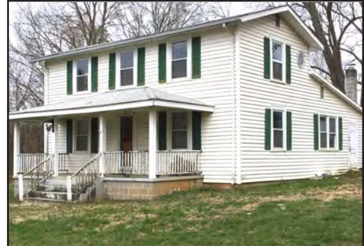
6897 Double Bridges Rd, Victoria VA Lunenburg County