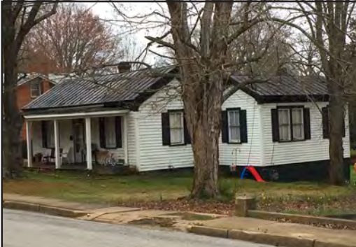
423 W. Sycamore St, Chase City Mecklenburg County