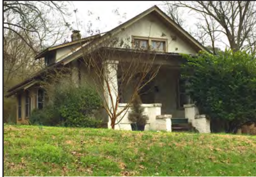
823 N. Main St, Chase City Mecklenburg County