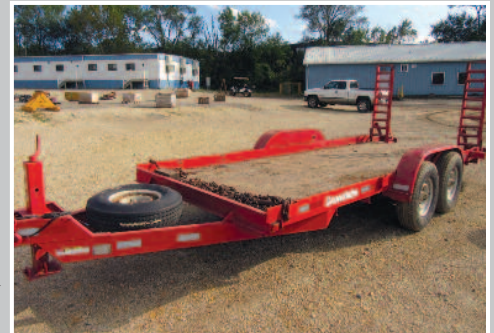
CRONKITE Flatbed Trailer