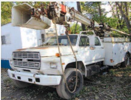
FORD F800 Pickup Truck, w/Pilman Boom