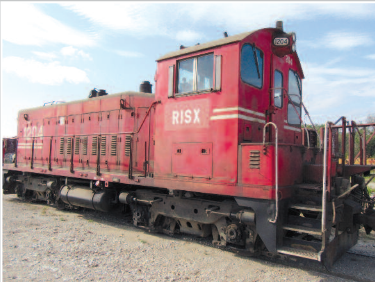
SWITCHING LOCOMOTIVE EMD SW1200