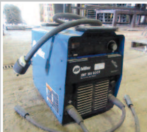
MILLER XMT304 Welder