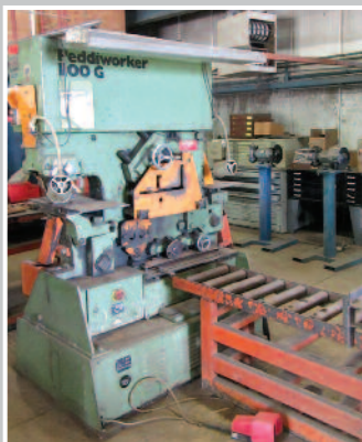
PEDDINGHAUS 1100G Ironworker