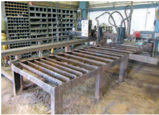
OPTICAL TORCH Cutting Table