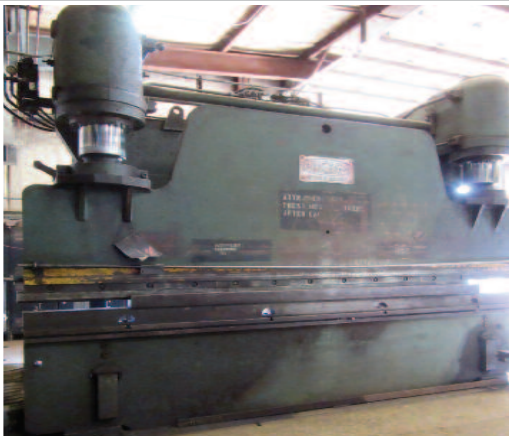
DREIS & KRUMP 400F10 Press Brake