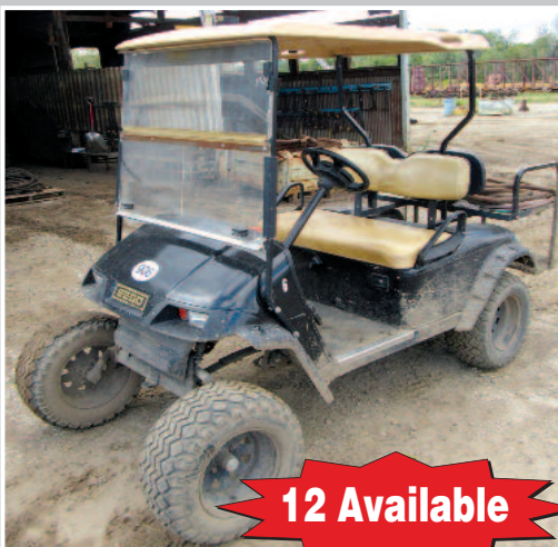
EZ-GO Golf Cart