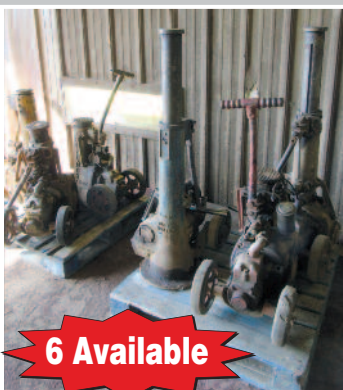
View of DUFF NORTON Air Jacks