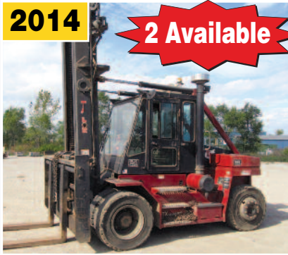
2014 2 Available TAYLOR TX 300S Forklift