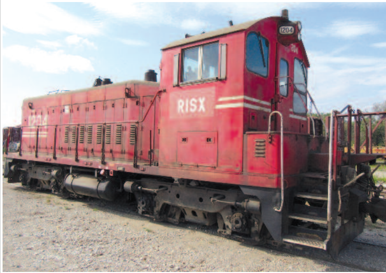
SWITCHING LOCOMOTIVE EMD SW1200

Assets of RAILWAY & INDUSTRIAL SERVICES, INC.