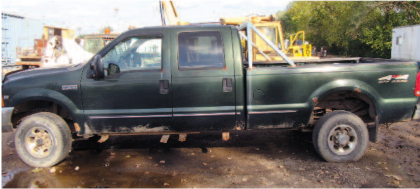
FORD F-350 Pickup Truck