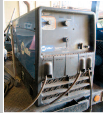
MILLER Trailblazer 275DC Welder