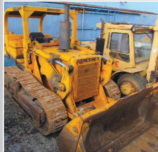
DRESSER 175E Dozer