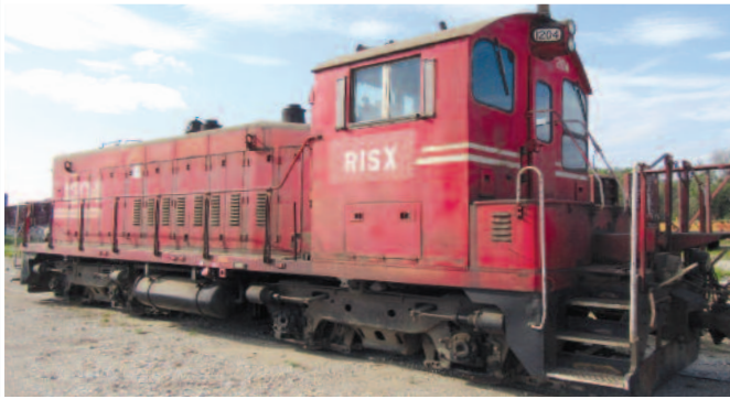
SWITCHING LOCOMOTIVE EMD SW1200

21700 Northwestern Hwy. Suite 1180 Southfield, MI 48075