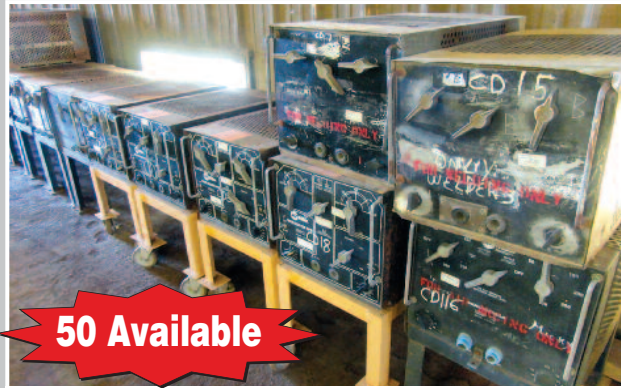
View of MILLER MOG 250/250 Welders