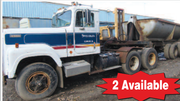
INTERNATIONAL F-4370 Tractor, w/Dump Trailer