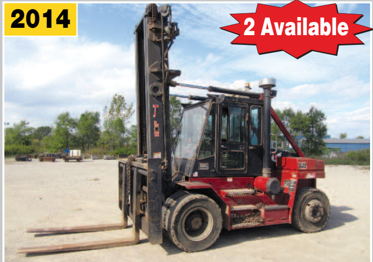
TAYLOR TX 300S Forklift