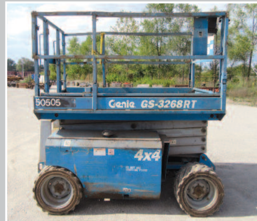
GENIE GS-3268RT Platform Lift