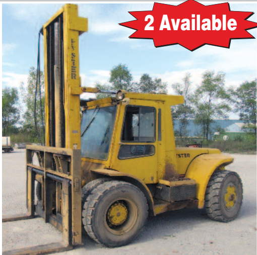
Hyster H180H Forklift