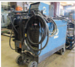
MILLER Deltaweld 451 Welder