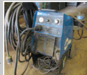
MILLER Plasma Cutter