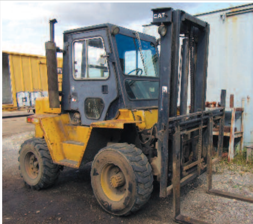
CAT 835-1 Forklift