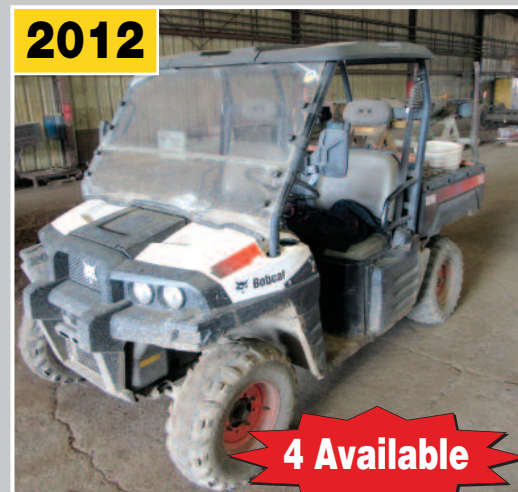
BOBCAT 3200 Utility Cart