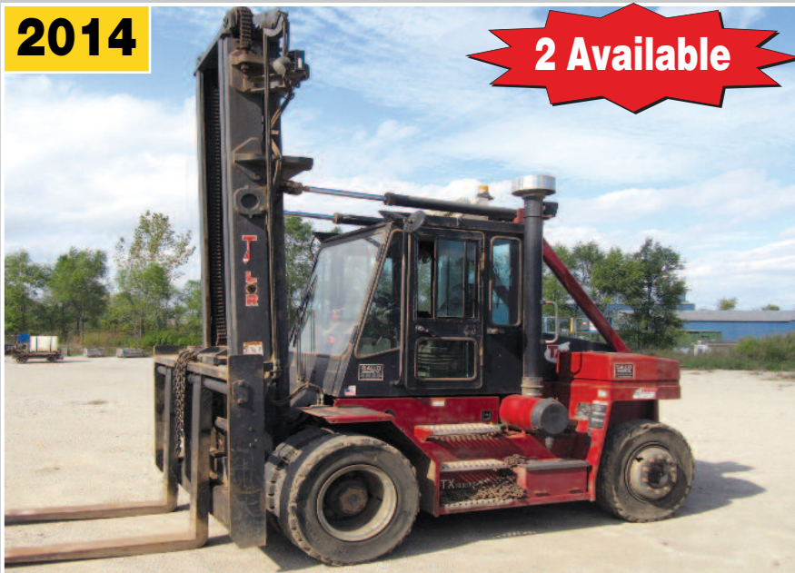
TAYLOR TX 300S Forklift