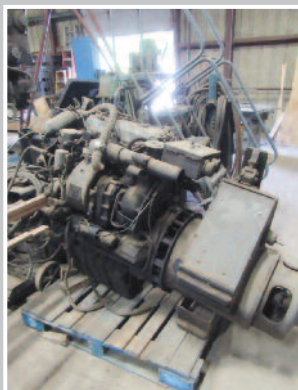
AC DELCO E711 Generator