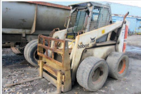
BOBCAT 943 Skid Steer