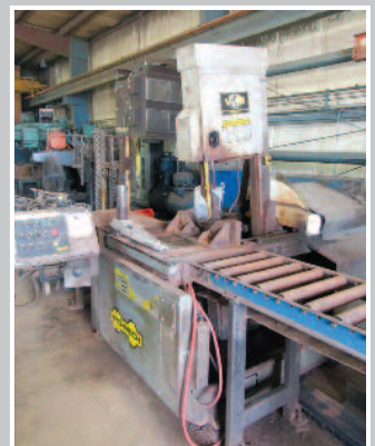
HYD-MECH V-18 Vert. Bandsaw