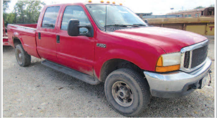
FORD F-350 Lariat Pickup Truck