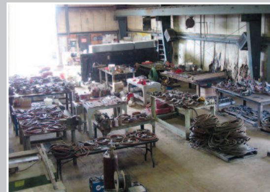
View of Pneuematic and Hand Tools