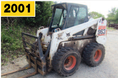
BOBCAT 963 Skid Steer