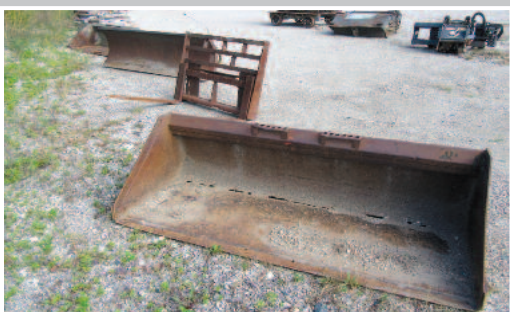
View of Skid Steer Attachments