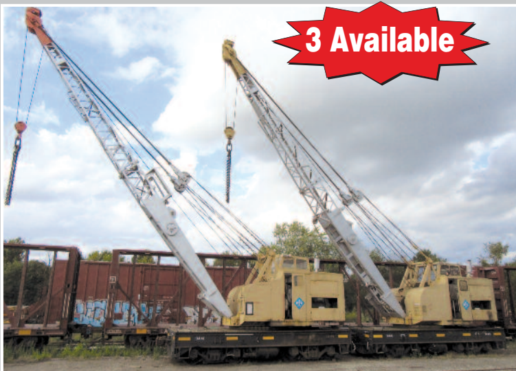
View of INDUSTRIAL BROWNHOIST Rail Cranes

2201 N. Center Street, Crest Hill, IL 60403