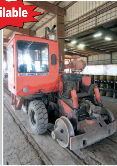
SWITCHMASTER 10,000 Rail Car Movers