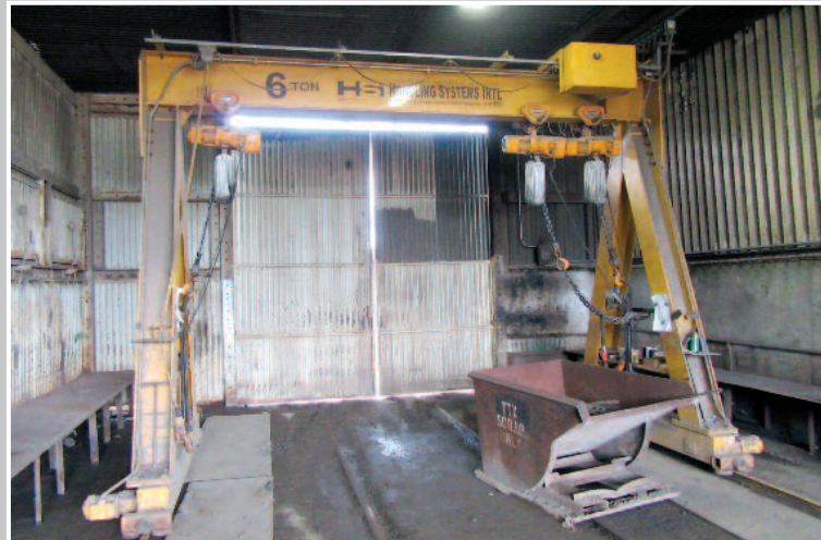
MATERIAL HANDLING SYSTEMS 6-Ton Mobile A-Frame Crane