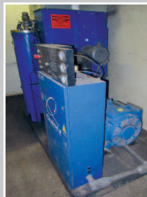
QUINCY Air Compressor