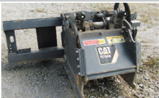
CAT PC104B Standard Flow Cold Planer Attachment