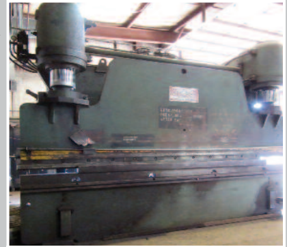
DREIS & KRUMP 400F10 Press Brake

TERMS & CONDITIONS | PAYMENT: Full payment within 24 hours. Payment is Cash, Cashier's check, Certified Check, or Wire Transfer. No other forms of payments will be accepted. Full Payment Must be Made before removal of Purchase. Everything is Sold "As-Is, Where-Is". All Sales Final. Cost and Responsibility for Removal of Purchase Remains with the Purchaser. Every Effort will be Made to Facilitate Removal. While Quantities and Descriptions are Believed to be Accurate, the Auctioneer, Owners or Counsel Make no Warranties or Guarantees Either Expressed or Implied as to Authenticity, Genuineness of, or Defects in Any Lot and will not be Held Responsible for any Advertising Discrepancies or Inaccuracies. No Warranties Whatsoever are Made as to Condition Merchantability or Fitness for Use of Any Item. May we Suggest you Take Full Advantage of the Preview and Inspection Period. Sale Subject to Additions, Deletions and Prior Sales. Please Check Availability of Equipment.