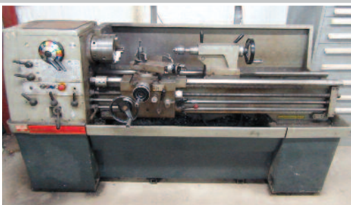
CLAUSING COLCHESTER Mdl. 15 Lathe