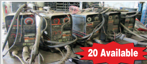
View of LINCOLN LN-25 Wire Feeders