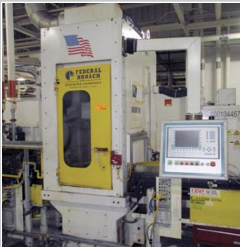
FEDERAL BROACH 90Kn x 1000 mm MVRT Vertical Broach Machine