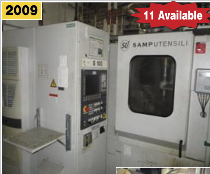
STAR SAMPUTENSILI CNC S100 CNC Gear Hobbers