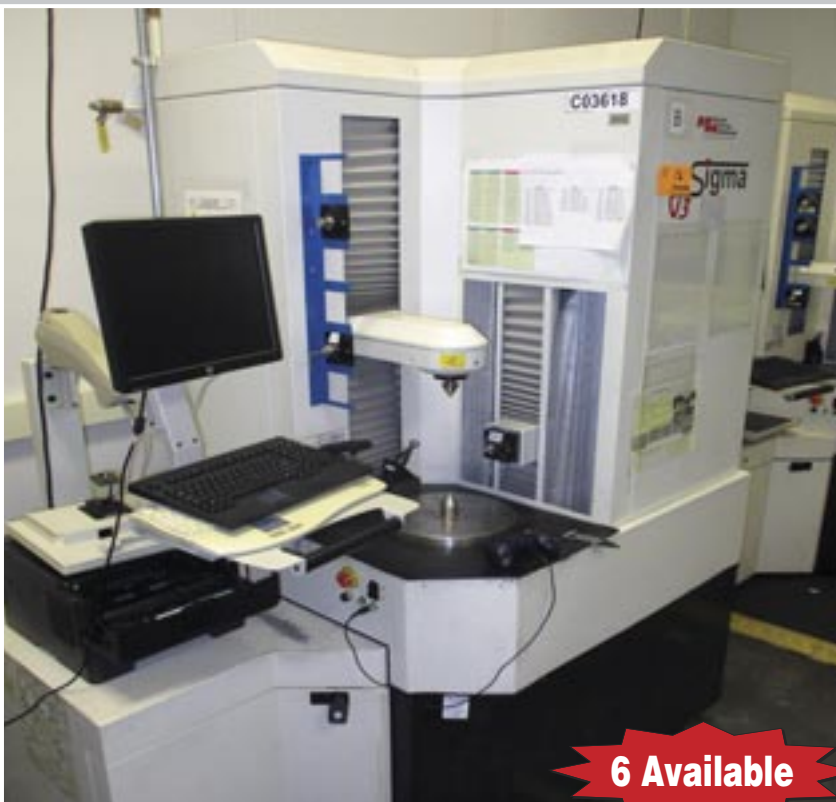
GLEASON M&M Sigma V3 Gear Testers