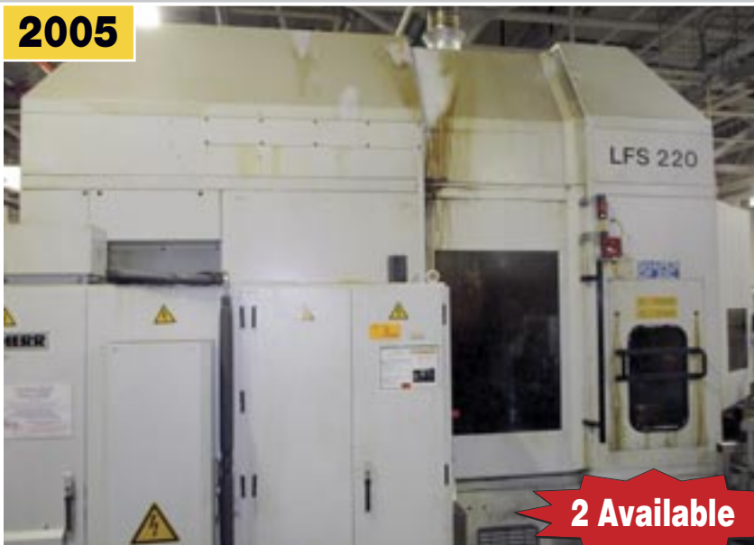
LIEBHERR Liebherr LFS-220 CNC Gear Shapers