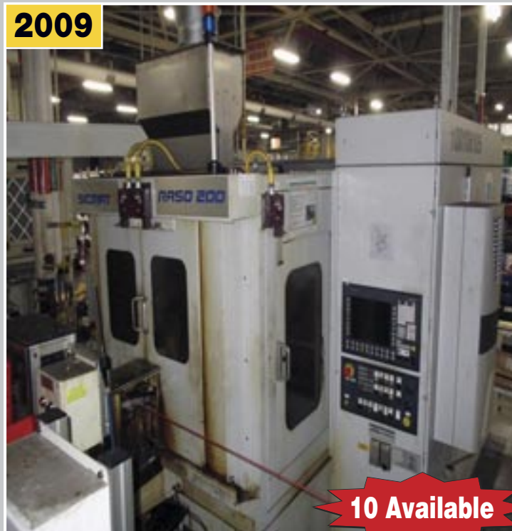
SICMAT Raso 2000 CNC Gear Shavers