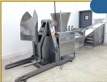
Bowl Lifter / Dough Divider