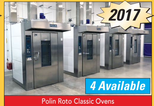
Polin Roto Classic Ovens