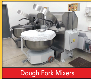
Dough Fork Mixers