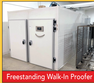
Freestanding Walk-In Proofer