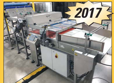
Farhat 3-Lane Pita Stacker