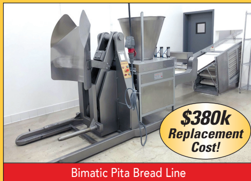
Bimatic Pita Bread Line

Turnkey Business Opportunity – Available in its Entirety Prior to Sale