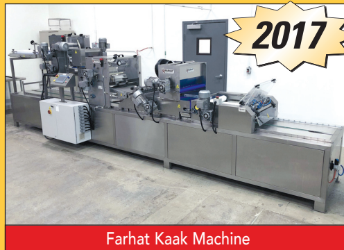
Farhat Kaak Machine