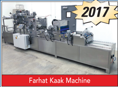
Farhat Kaak Machine

Complete Pita Bread and Breadsticks (KAAK) Baking Facility, Equipment Purchased New in 2016/2017