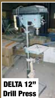
DELTA 12" Drill Press