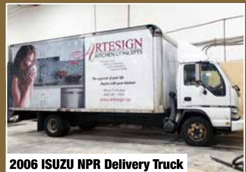
2006 ISUZU NPR Delivery Truck