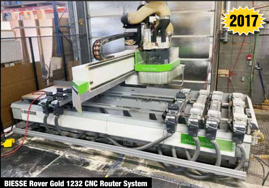
BIESSE Rover Gold 1232 CNC Router System