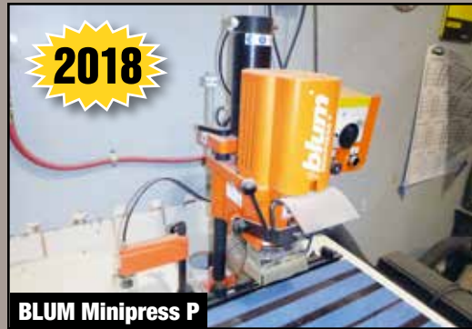
BLUM Minipress P