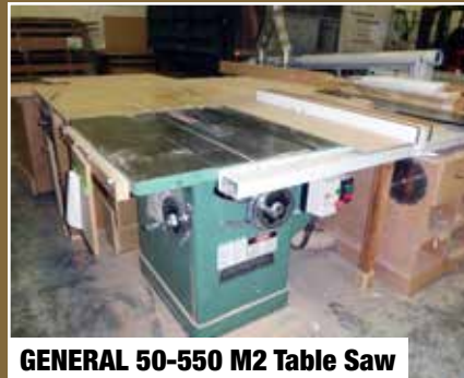
GENERAL 50-550 M2 Table Saw