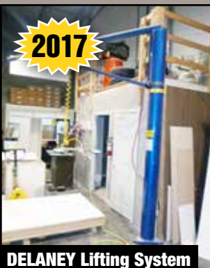
DELANEY Lifting System