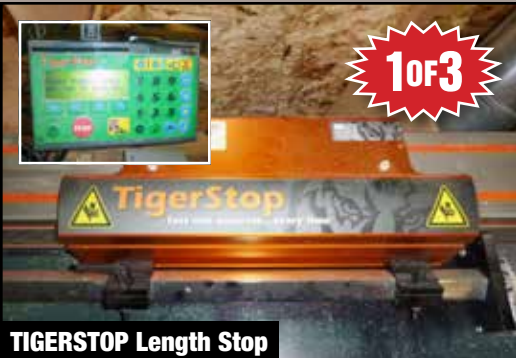
TIGERSTOP Length Stop