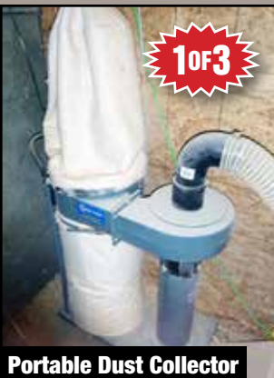
Portable Dust Collector