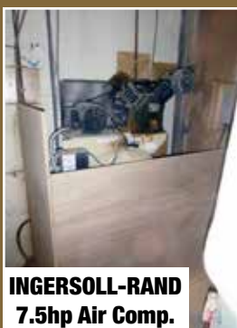
INGERSOLL-RAND 7.5hp Air Comp.