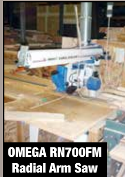
OMEGA RN700FM Radial Arm Saw