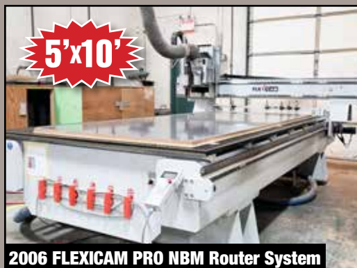
2006 FLEXICAM PRO NBM Router System