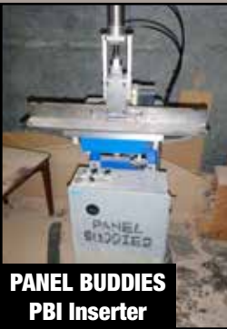
PANEL BUDDIES PBI Inserter