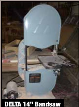
DELTA 14" Bandsaw