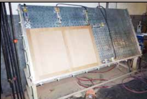
UNIQUE 280 Table Clamp System