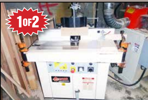
CANWOOD CWD18-375 Shaper