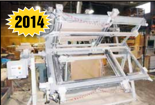
DOUCET RDM-5-30-72 Door Clamping System

PLACE YOUR BID NOW! Register at bidspotter.com