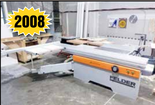
FELDER K500 5/06 9' Sliding Table Saw