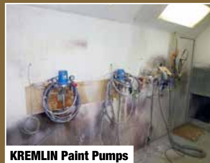
KREMLIN Paint Pumps