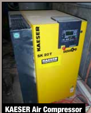
KAESER Air Compressor