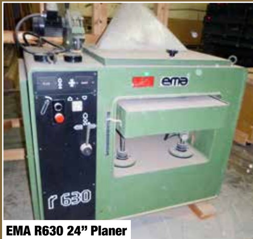
EMA R630 24" Planer