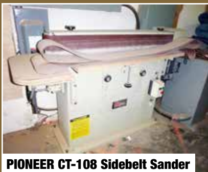
PIONEER CT-108 Sidebelt Sander