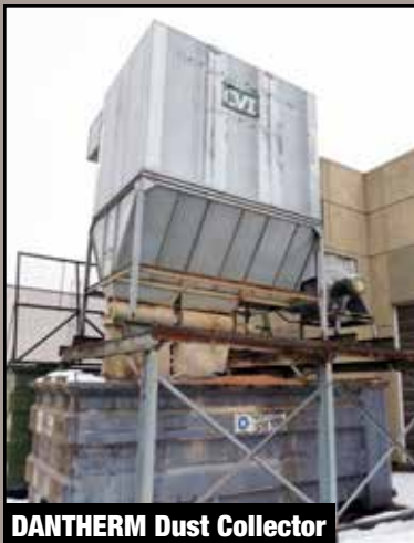
DANTHERM Dust Collector