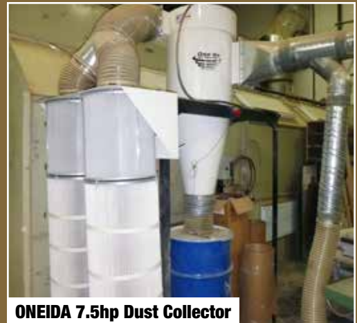
ONEIDA 7.5hp Dust Collector