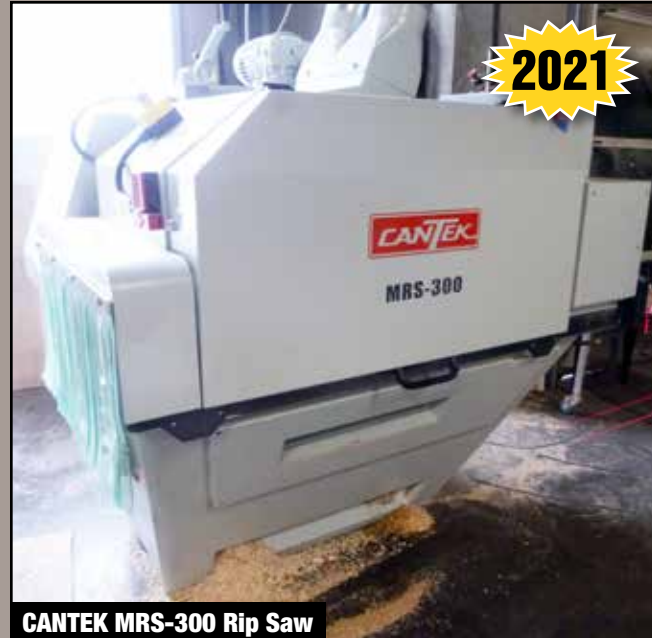
CANTEK MRS-300 Rip Saw