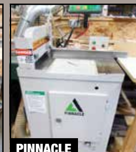
PINNACLE Chop Saw