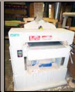
CANTEK Pro Planer