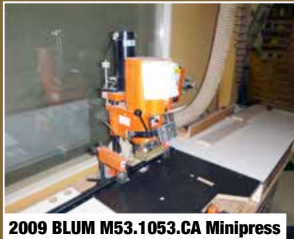
2009 BLUM M53.1053.CA Minipress