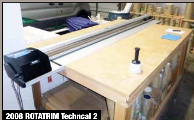
2008 ROTATRIM Techncl 2