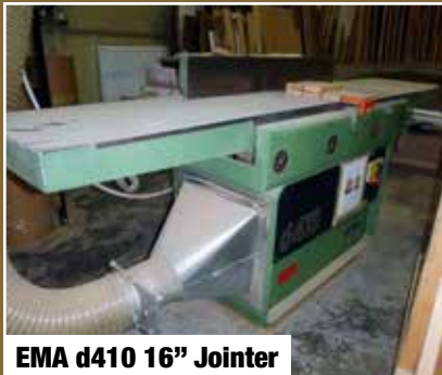
EMA d410 16" Jointer