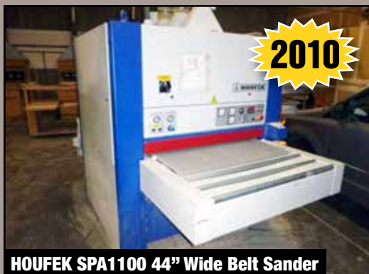
HOUFEK SPA1100 44" Wide Belt Sander