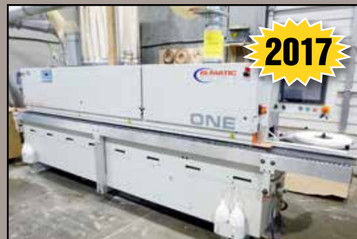
BI-MATIC Prima 7.3-r.A Plus One Edge Bander