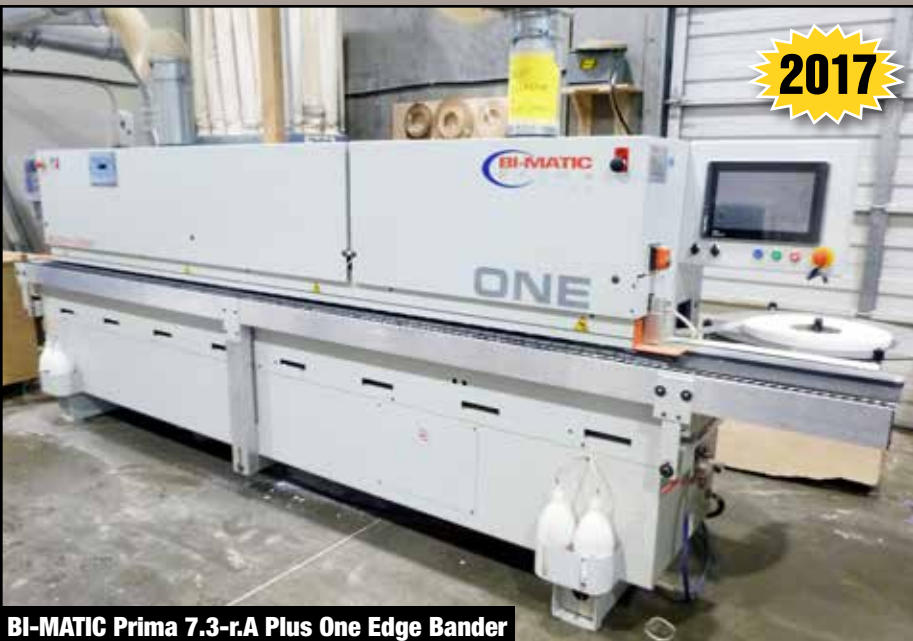
BI-MATIC Prima 7.3-rA Plus One Edge Bander