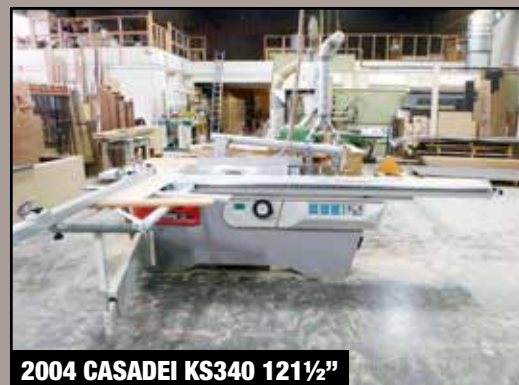
2004 CASADEI KS340 121 1/2"