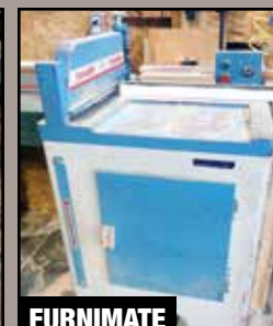
FURNIMATE Chop Saw