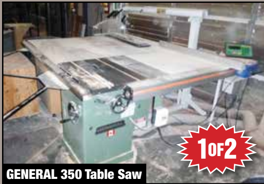
GENERAL 350 Table Saw