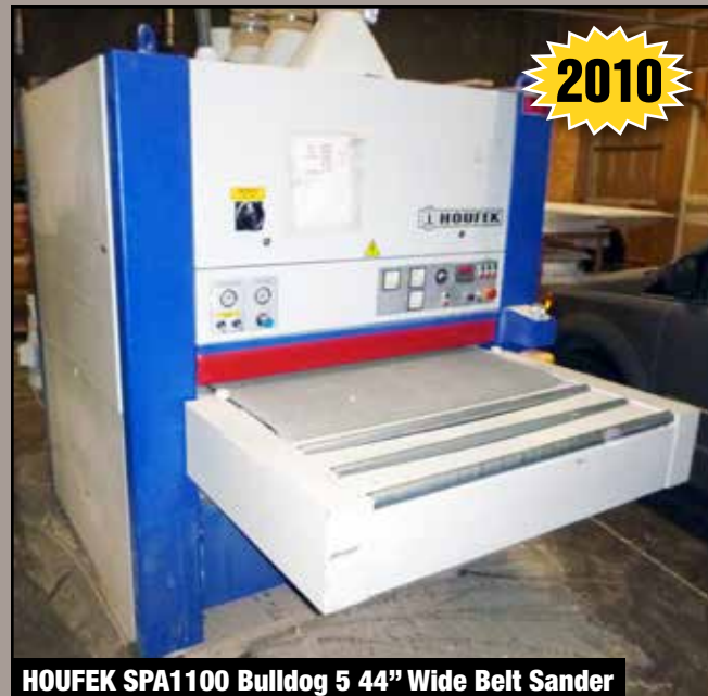
HOUFEK SPA1100 Bulldog 5 44" Wide Belt Sander

For Complete Information Please Contact: Mike Seibold | 604-813-1135 | Mike.Seibold@maynards.com