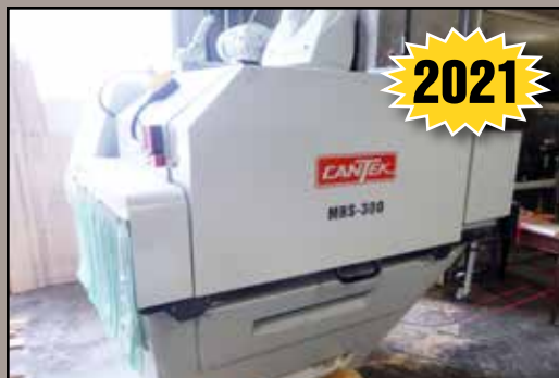
CANTEK MRS-300 Rip Saw