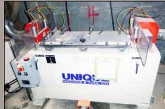
UNIQUE 31140 Dbl End Tenon/Cope System