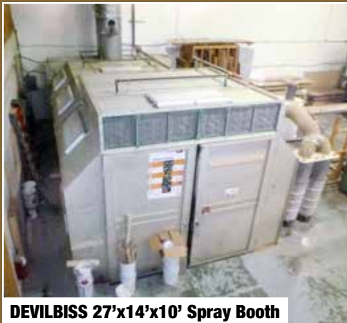
DEVILBISS 27'x14'x10' Spray Booth