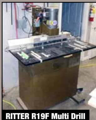
RITTER R19F Multi Drill