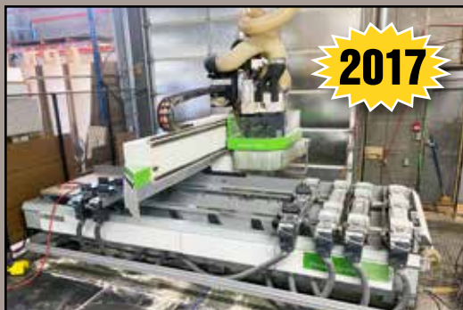
BIESSE Rover Gold 1232 CNC Router System

Monday, March 20 from 9am-5pm or by appointment