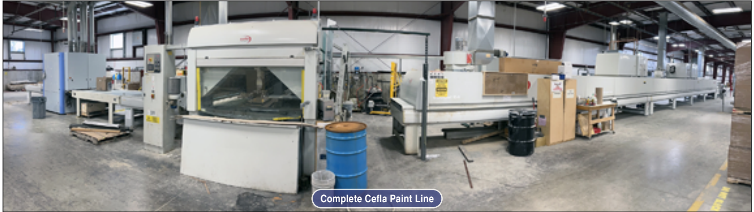
Complete Cefla Paint Line