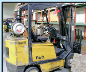
YALE 6,000-LB. CAP. FORKLIFT