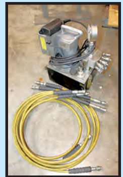
HYTORC POWER SOURCE