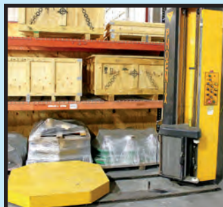
PHOENIX MDL. PHP-22008 STRETCH WRAPPING PACKAGING MACHINE

(2) TOYOTA 3,000-LB. CAP. MDL. 8FGCU15 , new 2013, LPG, 84" 2-stage mast, cushion tires, 42" forks, S/N 21142, S/N 21151.