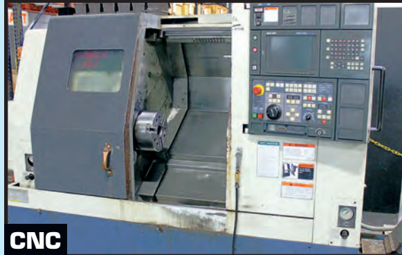
MORI SEIKI MDL. SL-200 CNC LATHE