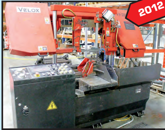
VELOX MDL. VX-330-DC AUTOMATIC HORIZONTAL BANDSAW