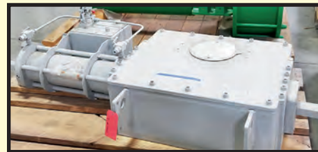
HYD. MDL. HYS-118-201-DA-120BAR-HP VALVE ACTUATOR

The required Sealed Bid package will contain necessary forms and descriptions to allow bidders to bid on specific lots, or, to bid on whichever combination of lots they desire.