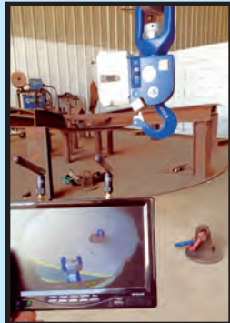
(1 OF 2) ELEBIA 5,000 KG AUTOMATED CRANE HOOKS