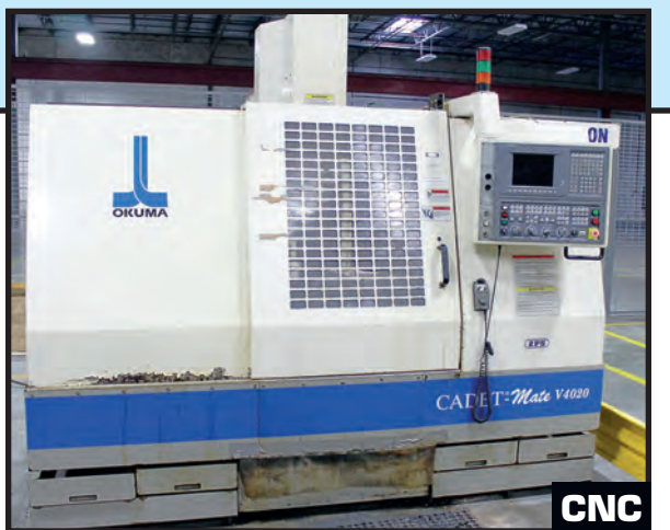
OKUMA CADET-MATE V4020 CNC VERTICAL MACHINING CENTER