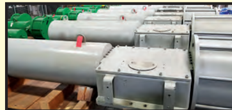
PNEU. MDL. PNC-118-3216-SRC3K VALVE ACTUATOR