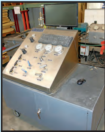
(1 OF 4) HYDRAULIC VALVE TEST UNITS