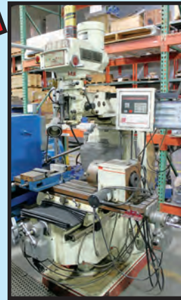
ACER MDL. 3VKH VERTICAL TURRET MILL