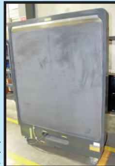
(3) COOL-A-ZONE PORTABLE EVAPORATIVE FANS