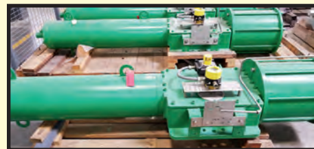
PNEU. MDL. PNC-31-1590-SRC3H VALVE ACTUATOR