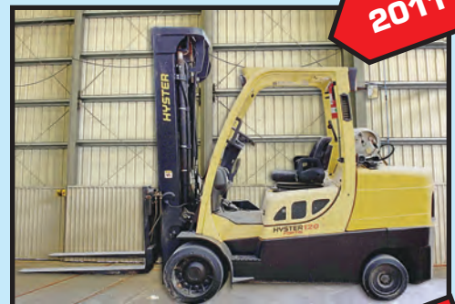
HYSTER 12,000-LB. CAP. LPG FORKLIFT