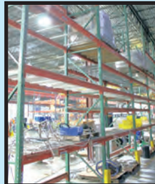
(10) SECTIONS OF PALLET RACK