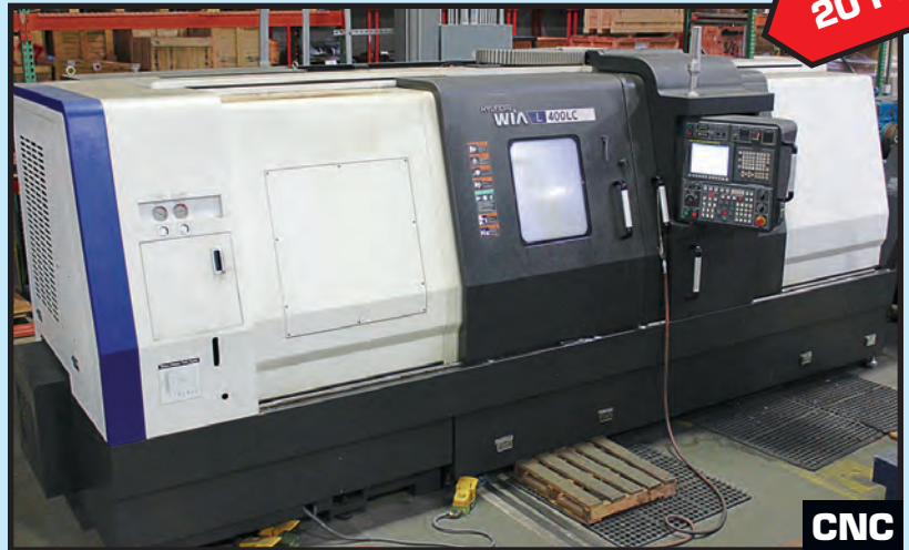
HYUNDAI WIA MDL. L400LC CNC LATHE