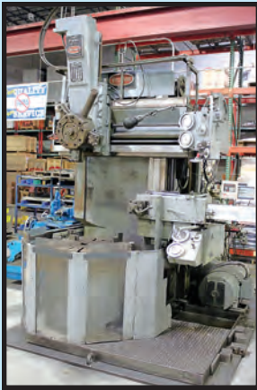
36" BULLARD DYNATROL VERTICAL TURRET LATHE