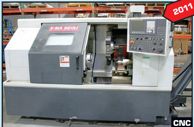
YAMA SEIKI MDL. GA-3300 CNC LATHE