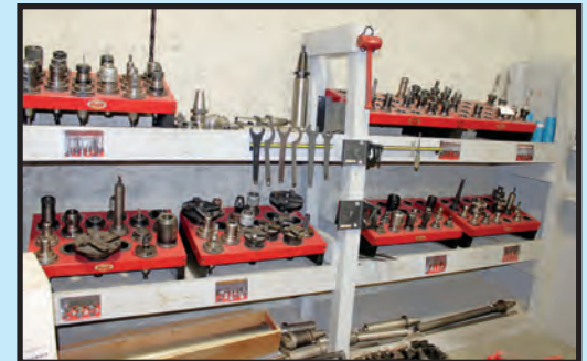
SAMPLE VIEW OF TOOLING