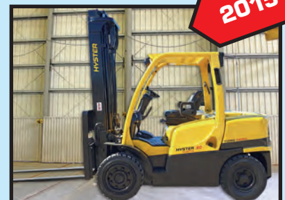
HYSTER 8,000-LB. CAP. FORKLIFT