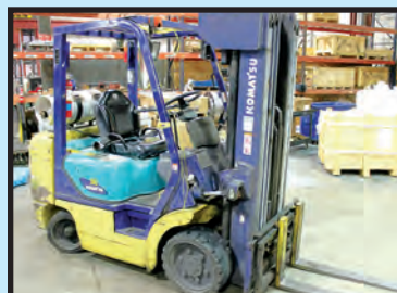
KOMATSU 4,200-LB. CAP. FORKLIFT