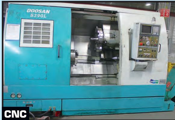
DOOSAN MDL. S390L CNC LATHE

MORI SEIKI MDL. SL-200 , MSC-500 CNC control, 26.8" swing over bed, 20.1" swing over cross slide, 15.3" max. turning dia., 18.9" max. turning length, 22" btwn. centers, 2.9" spdl. bore, 15 HP, 4-4,000 RPM, 12-pos. turret, 10" pwr. chuck, S/N 1015.