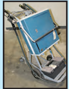
WORLDWIDE ANALYTICAL PMI MASTER-PLUS SPECTROMETER