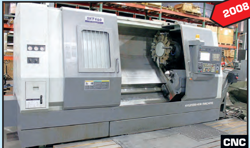
HYUNDAI KIA MDL. SKT-460 CNC LATHE