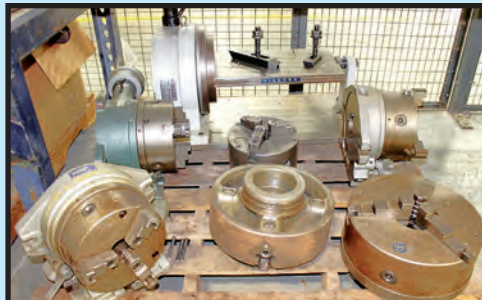
SAMPLE VIEW OF PRECISION MACHINE ACCESSORIES