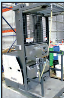
CROWN MDL. SP3200 ELECTRIC ORDER PICKER