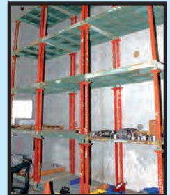
SAMPLE VIEW OF STACKABLE STEEL PALLETS