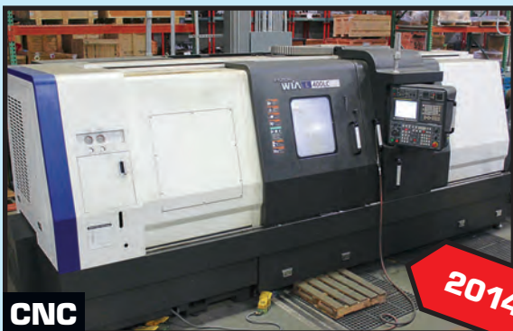
HYUNDAI WIA MDL. L400LC CNC LATHE