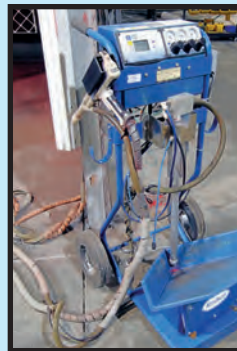
NORDSON SURECOAT POWDER SPRAY SYSTEM