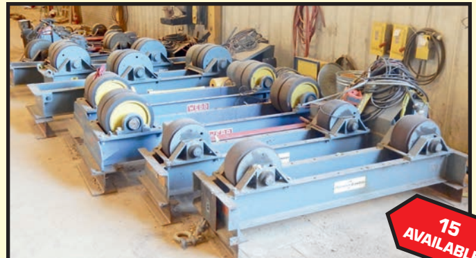
SAMPLE VIEW OF TANK TURNING ROLLS

Read Partial Terms and Conditions on Back Page