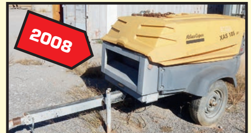
ATLAS COPCO AIR COMPRESSOR