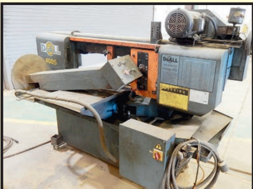
DOALL 8" X 20" CAP. HORIZONTAL BANDSAW