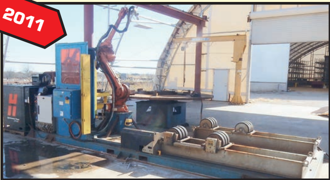
ABB ROBOTIC PLASMA SADDLE CUTTING SYSTEM