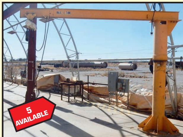
SAMPLE VIEW OF PEDESTAL JIB CRANES