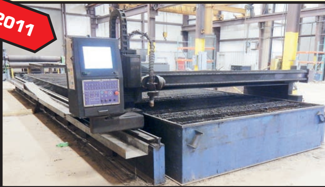
HORNET (RETRO SYSTEMS) 10' X 40' CNC PLASMA CUTTING SYSTEM

Read Partial Terms and Conditions on Back Page