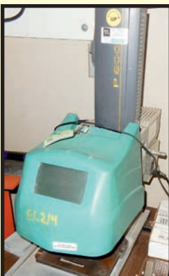
(1 OF 2) PROPEN MARKING MACHINES