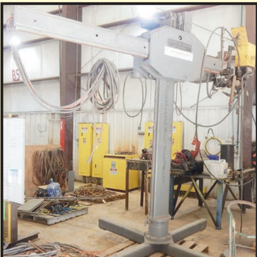
PRESTON EASTIN 6' X 6' WELDING MANIPULATOR