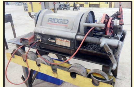
(1 OF 2) RIDGID PIPE THREADER

2008 ATLAS COPCO MDL. XAS185 JD7, VIN 4500A10188R031490, 160 PSI, single axle, bumper pull.