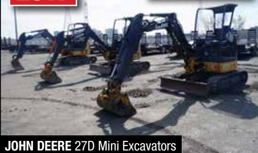
JOHN DEERE 27D Mini Excavators