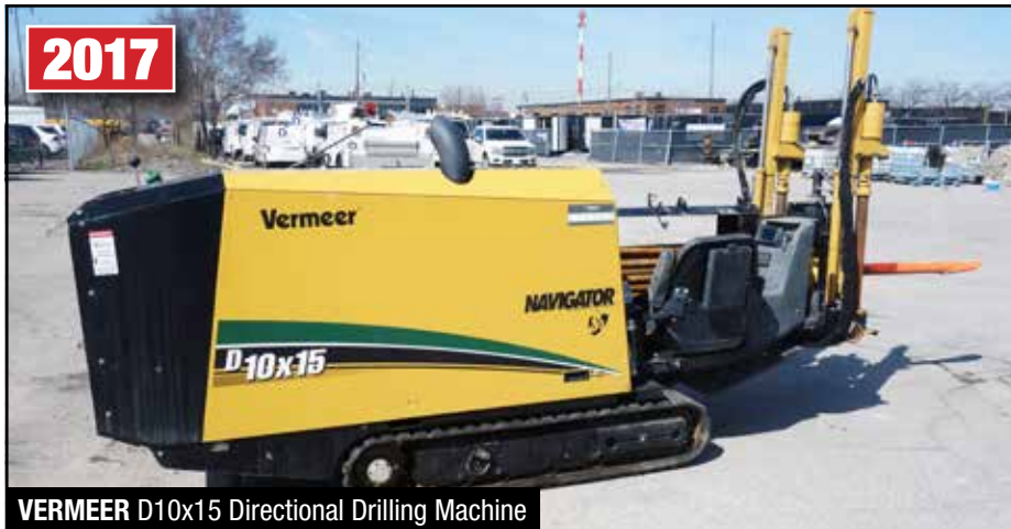
VERMEER D10x15 Directional Drilling Machine