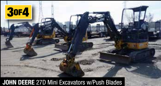
JOHN DEERE 27D Mini Excavators w/Push Blades