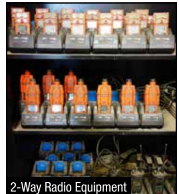
2-Way Radio Equipment