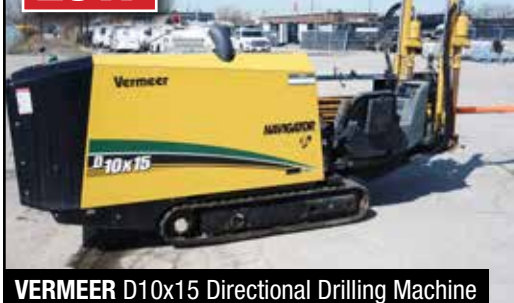
VERMEER D10x15 Directional Drilling Machine