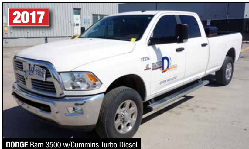
DODGE Ram 3500 w/Cummins Turbo Diesel