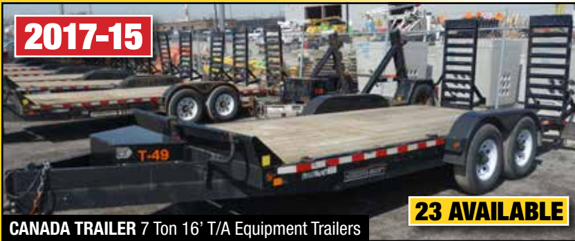
CANADA TRAILER 7 Ton 16' T/A Equipment Trailers