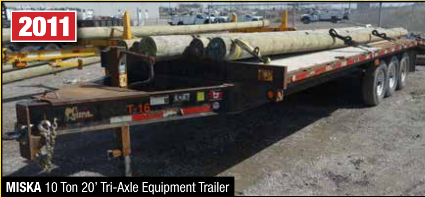
MISKA 10 Ton 20' Tri-Axle Equipment Trailer