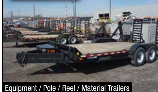
Equipment / Pole / Reel / Material Trailers