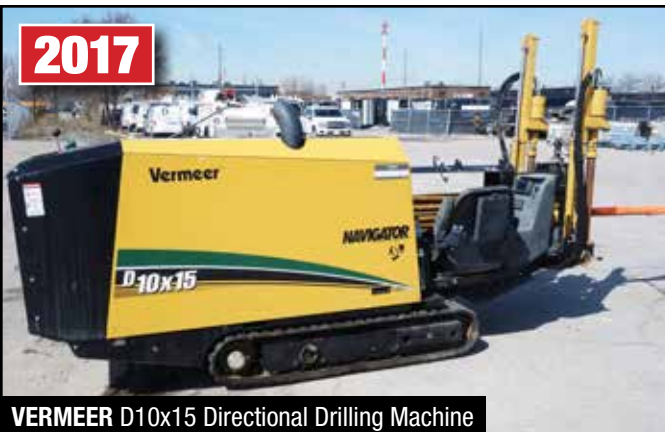
VERMEER D10x15 Directional Drilling Machine

77 Belfield Rd. • Etobicoke (Toronto), Ontario