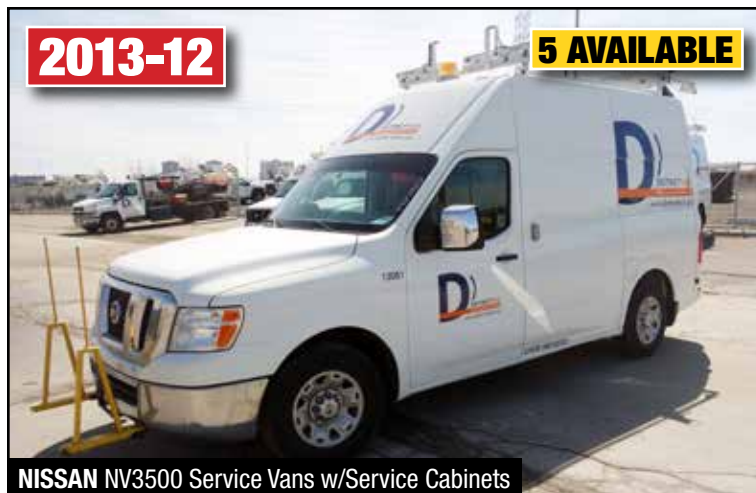
NISSAN NV3500 Service Vans w/Service Cabints