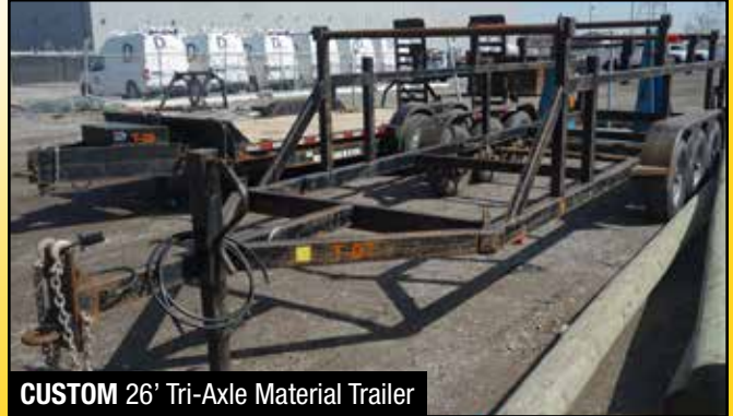
CUSTOM 26' Tri-Axle Material Trailer