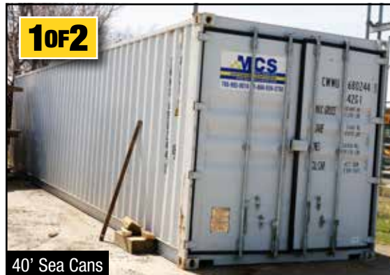
40' Sea Cans