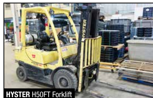
HYSTER H50FT Forklift