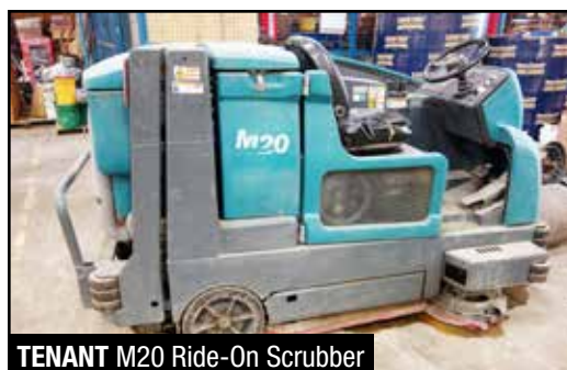
TENANT M20 Ride-On Scrubber