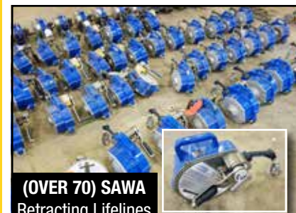
(OVER 70) SAWA Retracting Lifelines