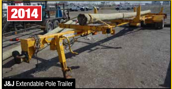
J&J Extendable Pole Trailer