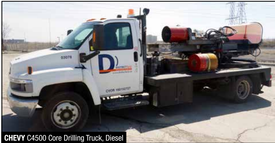
CHEVY C4500 Core Drilling Truck, Diesel