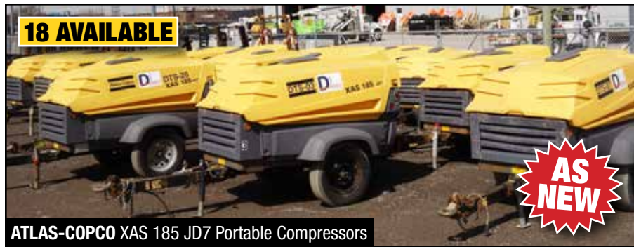
ATLAS-COPCO XAS 185 JD7 Portable Compressors