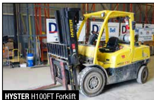
HYSTER H100FT Forklift