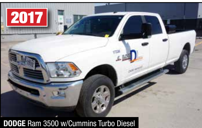
DODGE Ram 3500 w/Cummins Turbo Diesel