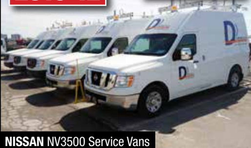
NISSAN NV3500 Service Vans