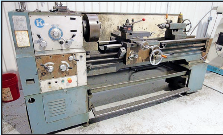
15" X 50" ENGINE LATHE