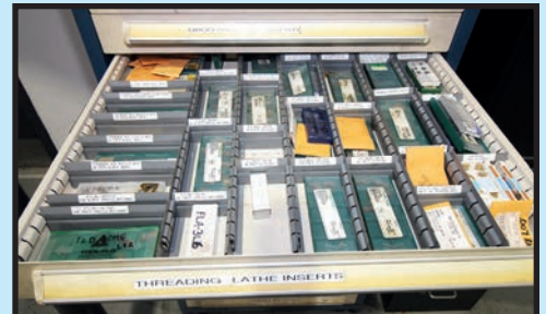
SAMPLE VIEW OF DRAWERS FULL OF CARBIDE INSERTS

At the Premises of QUICK TURN MACHINING INC. 428 SOUTH PERSIMMON STREET TOMBALL, TX 77375 Wearing masks and social distancing are required.