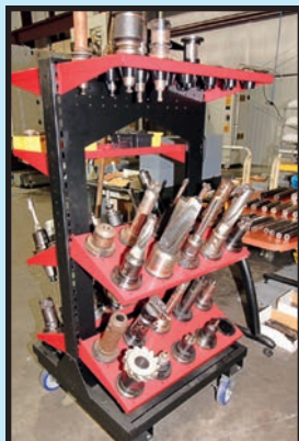
SAMPLE VIEW OF CAT-50 TOOLING