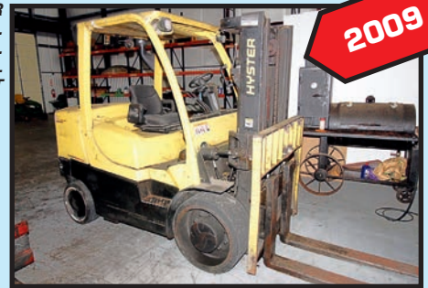
HYSTER 15,000-LB. BASE CAP. DIESEL FORKLIFT