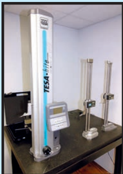
VIEW OF HEIGHT GAUGES