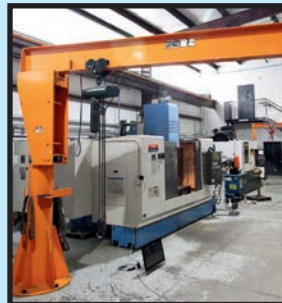
SAMPLE VIEW OF PEDESTAL JIB CRANES