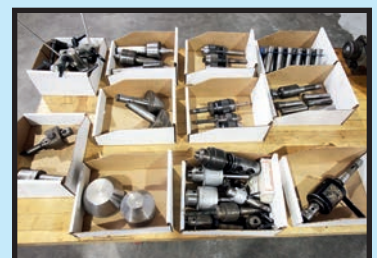
SAMPLE VIEW OF TOOLING

CABINETS W/INSERTS, CARBIDE; SANDVIK DEBIBE BORING BARS, COLLETS AND MUCH MORE.