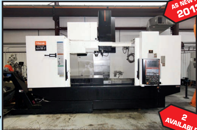
MAZAK NEXUS 700E-II/50 VERTICAL MACHINING CENTER