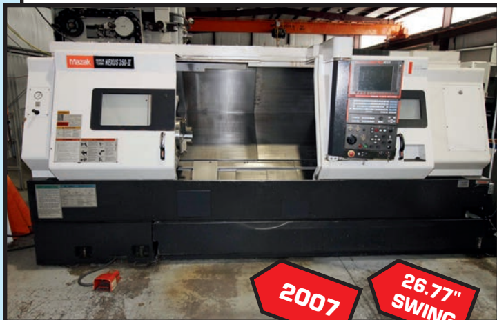
MAZAK QTN-350-II CNC LATHE

MAZAK SUPER QUICKTURN 15 MARK II MDL. SQT15M , Mazatrol T Plus, 20.9" swing over bed, 15.7" swing over carriage, 20.8" max. turning length, 20 HP, 5,000 RPM, VDI 12-pos. turret, 10" dia. 3-jaw chuck, chip conveyor, S/N 121900.