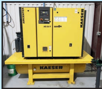
KAESER 25 HP AIR COMPRESSOR