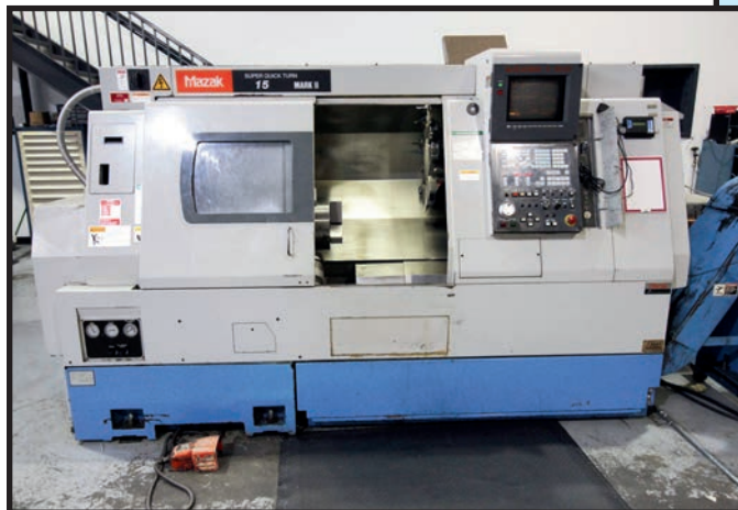
MAZAK SQT15M CNC LATHE

THE TWO MACHINES BELOW ARE LOCATED OFF SITE AND WILL BE SOLD BY PHOTO AT THE QUICK TURN MACHINING AUCTION