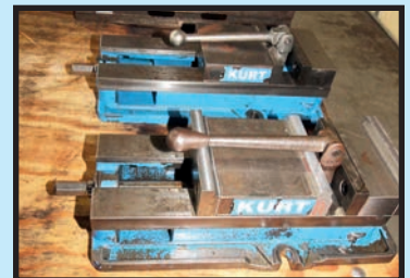
SAMPLE VIEW OF KURT VISES