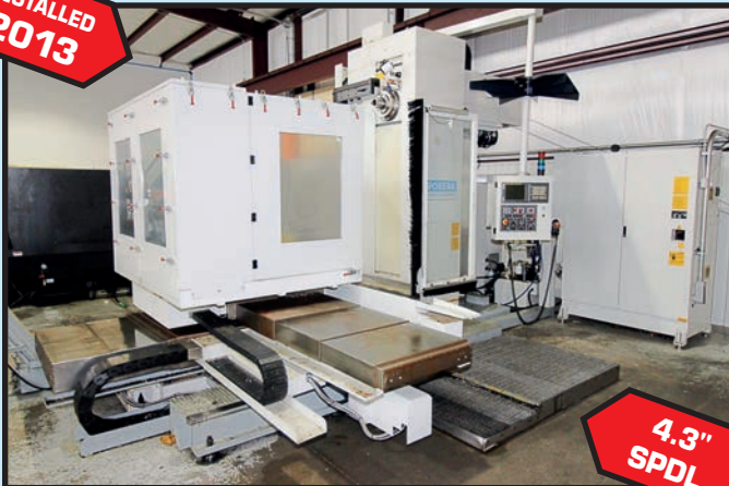
POREBA HBM4 HORIZONTAL CNC BORING MILL