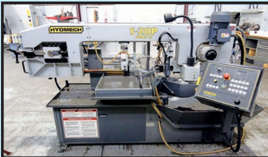
HYD-MECH S-20P SERIES III HORIZONTAL BANDSAW

At the Premises of QUICK TURN MACHINING INC. 428 SOUTH PERSIMMON STREET TOMBALL, TX 77375 Wearing masks and social distancing are required.