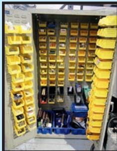
SAMPLE VIEW OF SUPPLY CABINETS