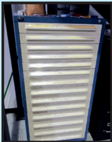
SAMPLE VIEW OF ROLLER DRAWER CABINETS

Wearing masks and social distancing are required.