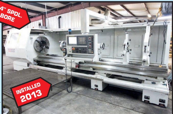
MICRO CUT CHALLENGER FLATBED HOLLOW SPDL. CNC LATHE