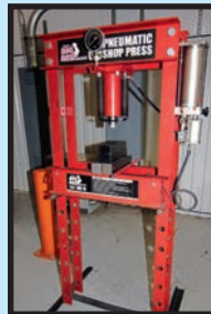
TORIN 40 T. PNEUMATIC H-FRAME PRESS