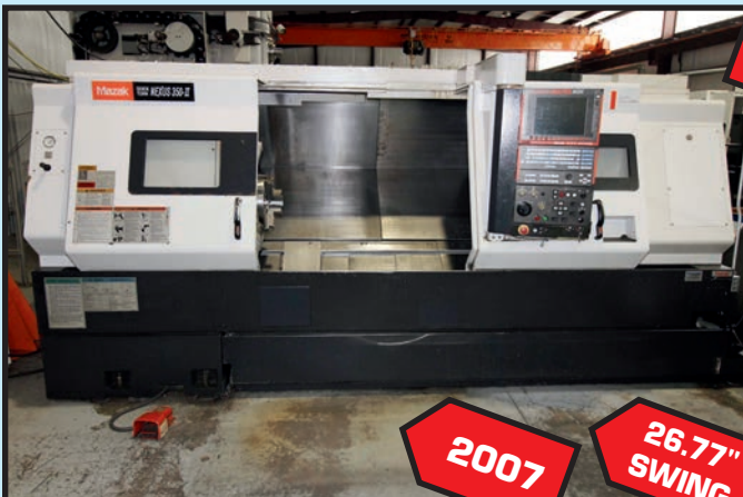
MAZAK QTN-350-II CNC LATHE

BUYER'S PREMIUM: 15% ON-SITE • 18% WEBCAST