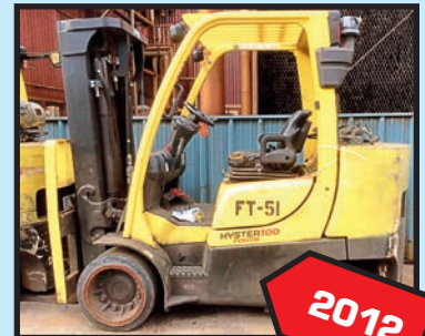
HYSTER 10,000-LB. BASE CAP. LPG FORKLIFT