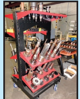
SAMPLE VIEW OF CAT-50 TOOLING