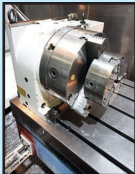
SAMPLE VIEW OF 4TH AXIS ROTARY INDEXERS