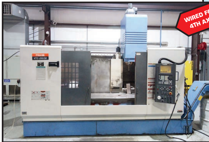
MAZAK VTC-250/50 VERTICAL MACHINING CENTER