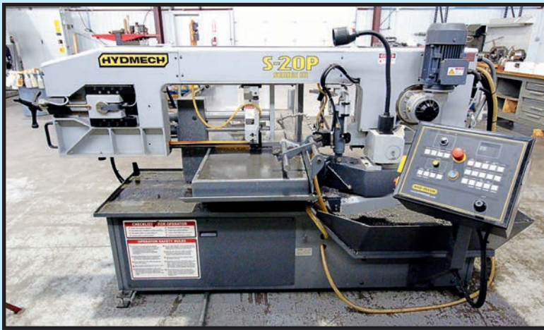
HYD-MECH S-20P SERIES III HORIZONTAL BANDSAW