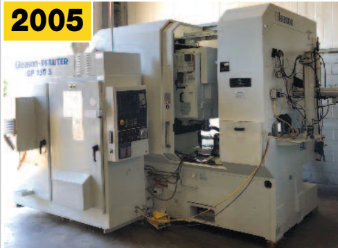
GLEASON/PFAUTER GP-150S CNC Gear Shaper