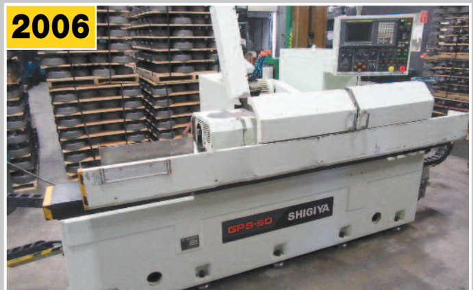
SHIGIYA GPS-30-100 CNC Cylindrical Grinder