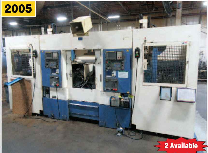
TAKAMATSU XW-150 4-Axis CNC Twin Spindle Lathe