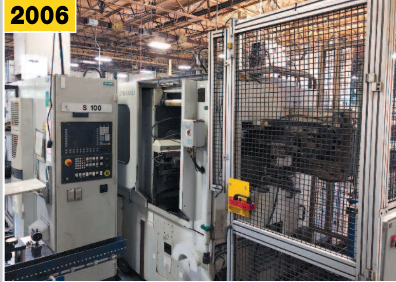
SAMPUTENSILI S-100 PD2 5-Axis CNC Gear Hobber