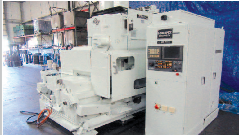
LORENZ LS-180 CNC Gear Shaper