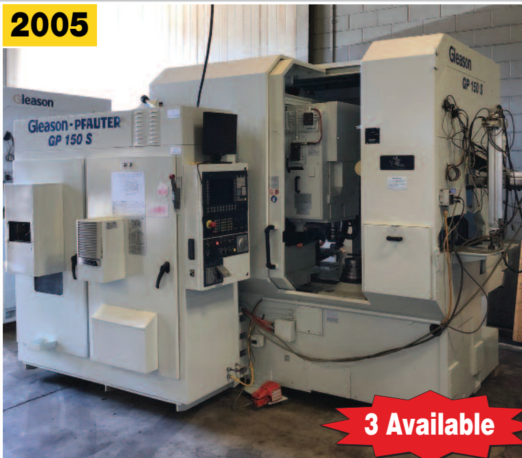
GLEASON/PFAUTER GP-150S 6-Axis CNC Gear Shaper