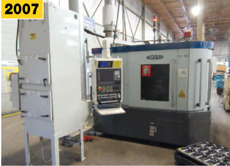
REISHAUER RZ-150 CNC Gear Grinder