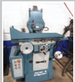
J&S Surface Grinder