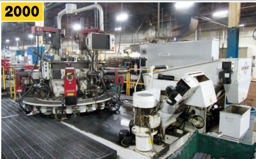
HYDROMAT Epic HB45-12 CNC Rotary Transfer Machine