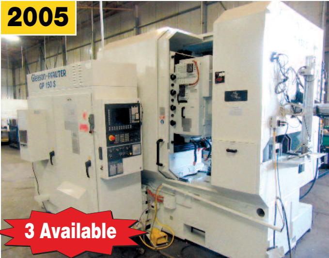
GLEASON GP-150S CNC Gear Shaper