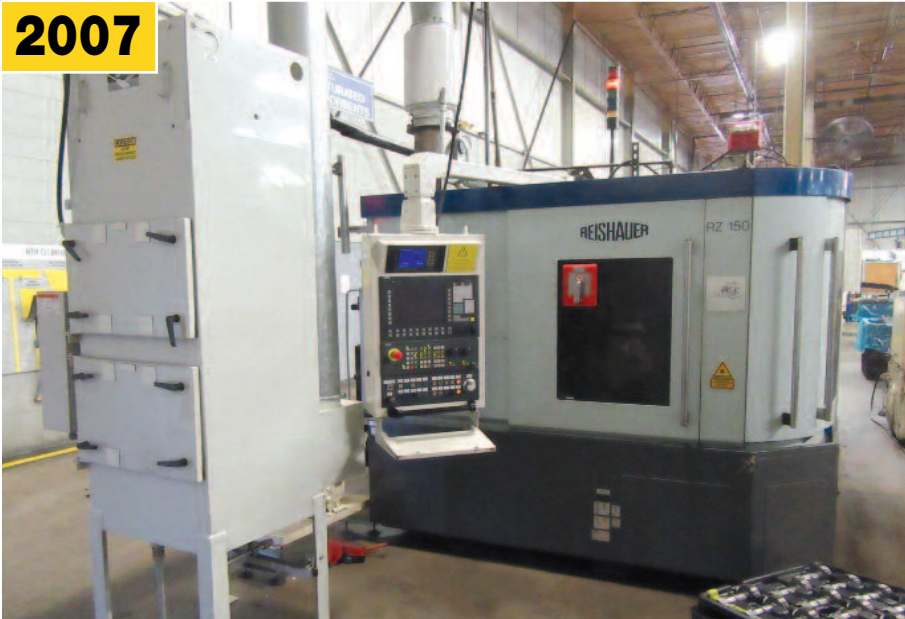
REISHAUER RZ-150 CNC Gear Grinder