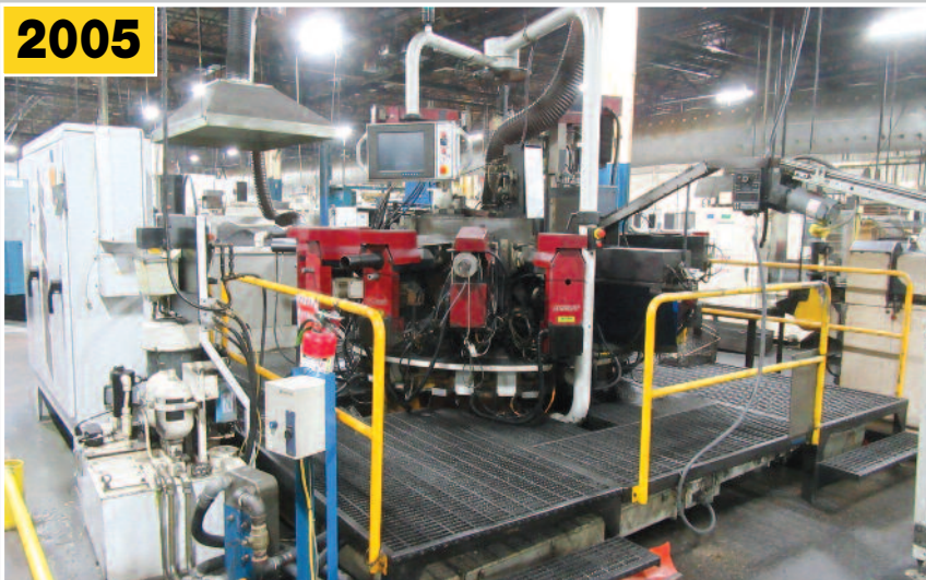
HYDROMAT Epic HS16 CNC Rotary Transfer Machine