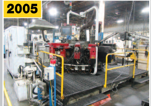
HYDROMAT HS16 Rotary Transfer Machine

TERMS & CONDITIONS | PAYMENT: Full payment within 24 hours. Payment is Cash, Cashier's check, Certified Check, or Wire Transfer. No other forms of payments will be accepted. Full Payment Must be Made before removal of Purchase. Everything is Sold "As-Is, Where-Is." All Sales Final. Cost and Responsibility for Removal of Purchase Remains with the Purchaser. Every Effort will be Made to Facilitate Removal. While Quantities and Descriptions are Believed to be Accurate, the Auctioneer, Owners or Counsel Make no Warranties or Guarantees Either Expressed or Implied as to Authenticity, Genuineness of, or Defects in Any Lot and will not be Held Responsible for any Advertising Discrepancies or Inaccuracies. No Warranties whatsoever are Made as to Condition Merchantability or Fitness for Use of Any Item. May we Suggest you Take Full Advantage of the Preview and Inspection Period. Sale Subject to Additions, Deletions and Prior Sales. Please Check Availability of Equipment.