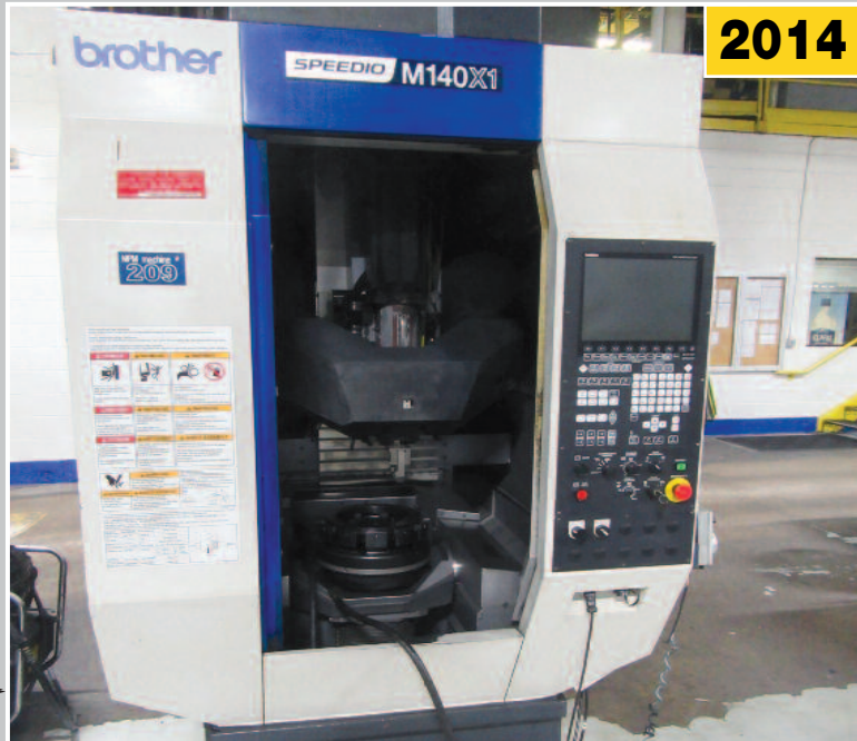
BROTHER SPEEDIO CNC 5-Axis Compact VMC