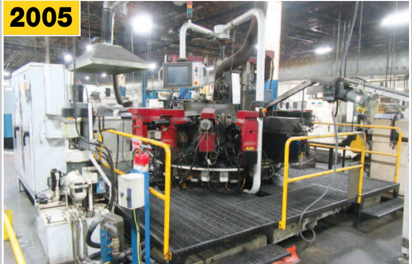
HYDROMAT Epic HS16 CNC Rotary Transfer Machine