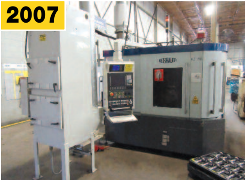
REISHAUER RZ-150 CNC Gear Grinder