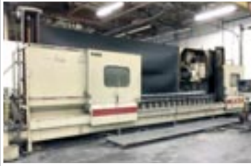
KOMO VMC 40/240 Traveling Column VMC