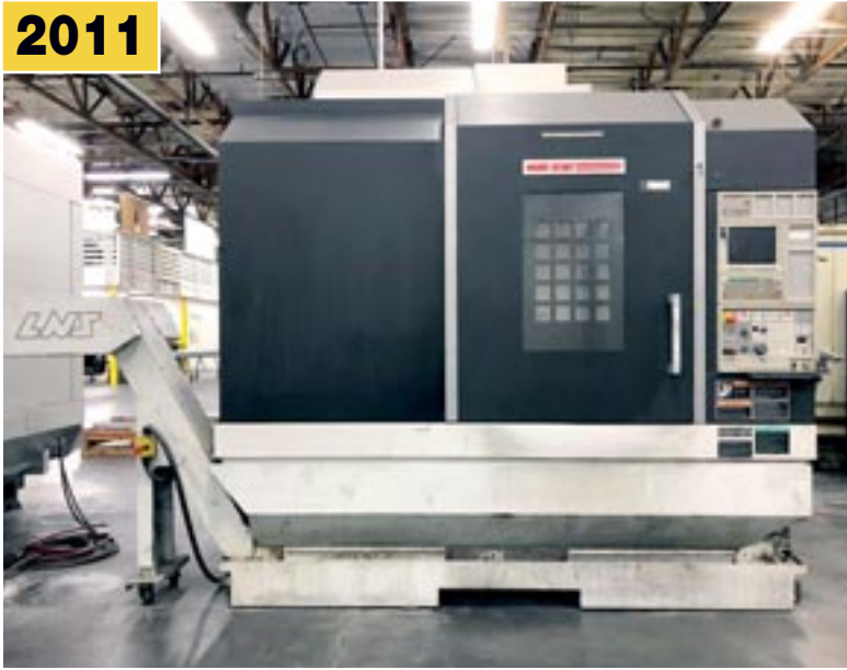
MORI SEIKI DuraVertical 5100 CNC Vertical Machining Center