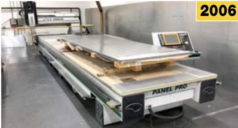
ONSRUD 288G18 CNC Router