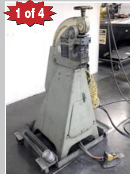
MARCHANT 4A Shrinker-Stretcher