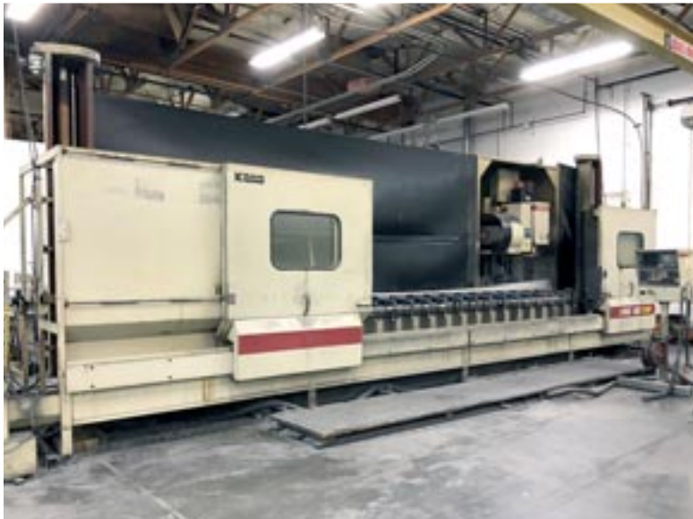
KOMO VMC 40/240 Traveling Column Vertical Machining Center