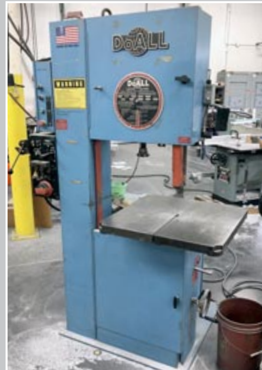
20" DOALL 2013-7 Bandsaw

FOR FURTHER INFORMATION CONTACT: Nyk Westbrook at (818) 738-0800 or nwestbrook@maynards.com