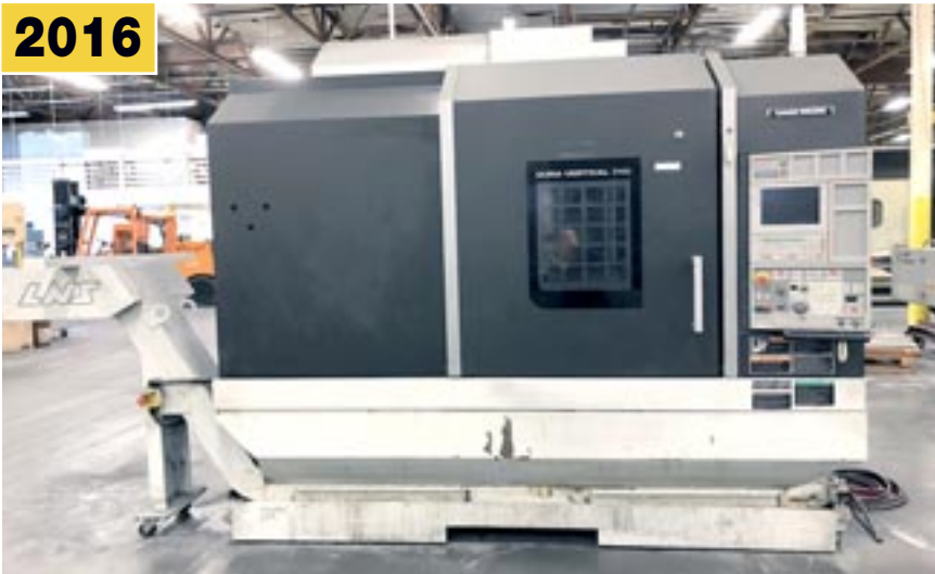
DMG MORI DuraVertical 5100 CNC Vertical Machining Center