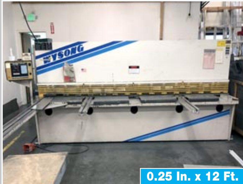
WYSONG H-2512 Power Shear