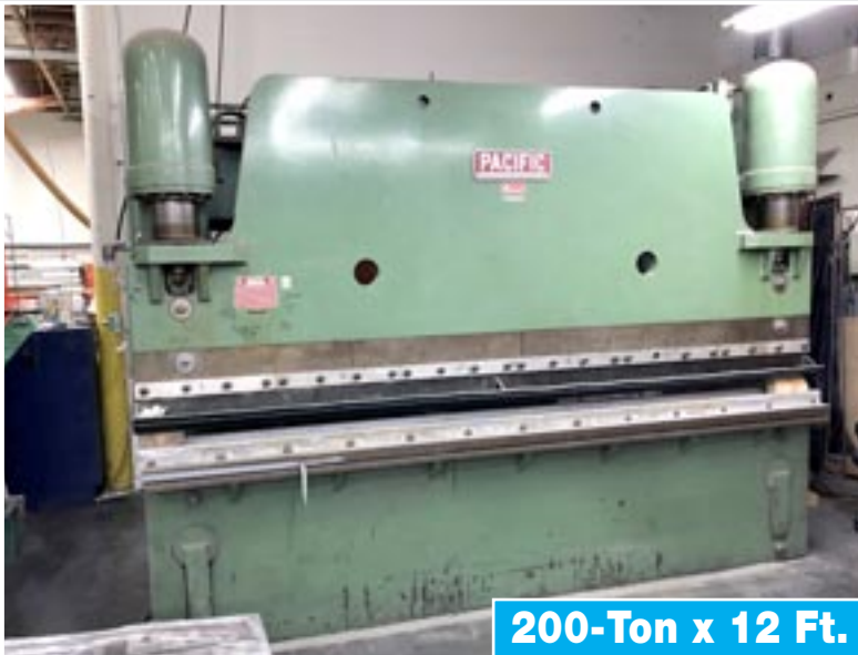
PACIFIC Hydraulic Press Brake