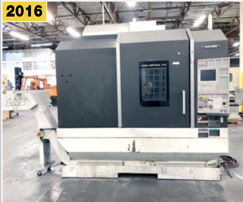
DMG MORI DuraVertical 5100 CNC Vertical Machining Center