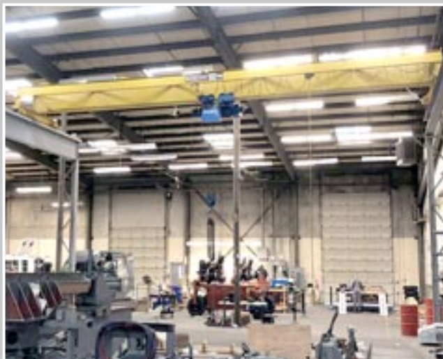
10-TON F.T. CROWE Overhead Bridge Crane