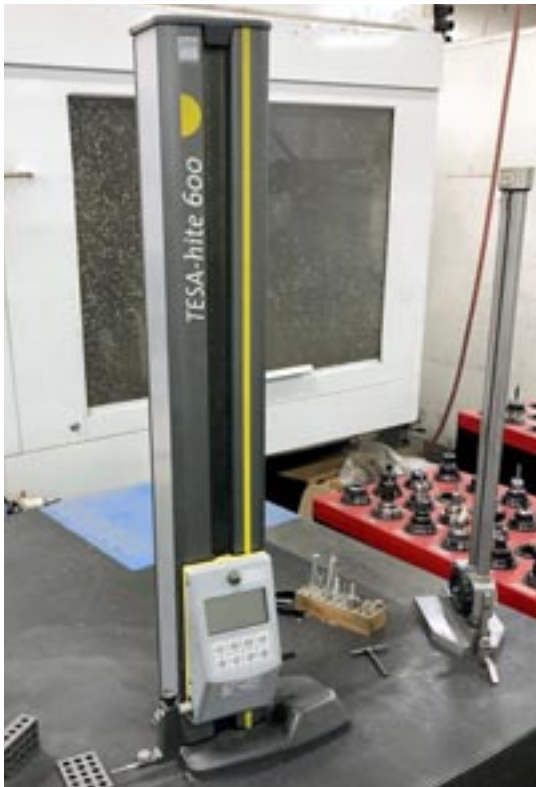
TESA-HITE 600 Digital Height Gage