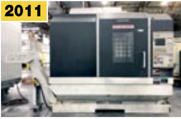
MORI SEIKI DuraVertical 5100 CNC VMC