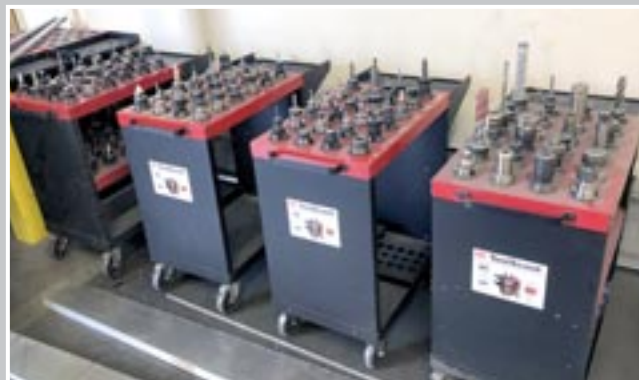
View of Tooling