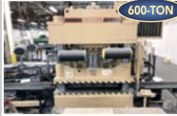
STANDARD INDUSTRIAL AP600 Press