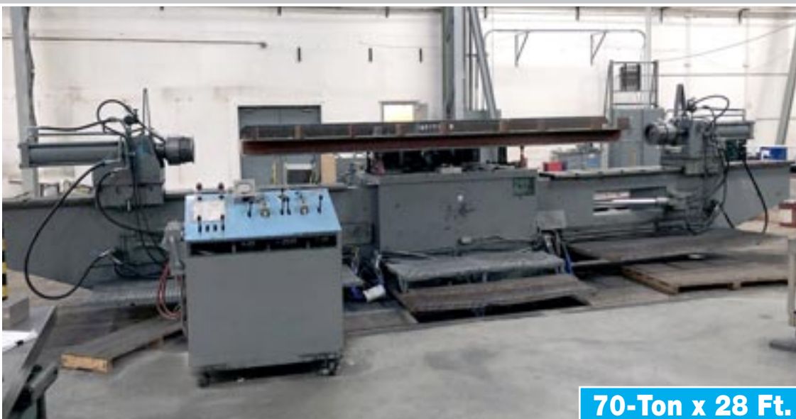
VERSAFORM Stretch Former