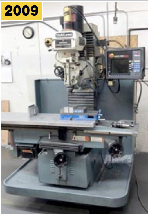
SOUTHWESTERN INDUSTRIES TRAK CNC Vertical Mill