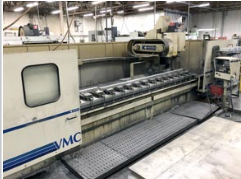
KOMO VMC 40/180 Traveling Column Vertical Machining Center