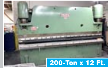
PACIFIC Hydraulic Press Brake

TERMS & CONDITIONS | PAYMENT: Full payment within 24 hours. Payment is Cash, Cashier's check, Certified Check, or Wire Transfer. No other forms of payments will be accepted. Full Payment Must be Made before removal of Purchase. Everything is Sold "As-Is, Where-Is". All Sales Final. Cost and Responsibility for Removal of Purchase Remains with the Purchaser. Every Effort will be Made to Facilitate Removal. While Quantities and Descriptions are Believed to be Accurate, the Auctioneer, Owners or Counsel Make no Warranties or Guarantees Either Expressed or Implied as to Authenticity, Genuineness of, or Defects in Any Lot and will not be Held Responsible for any Advertising Discrepancies or Inaccuracies. No Warranties Whatsoever are Made as to Condition Merchantability or Fitness for Use of Any Item. May we Suggest you Take Full Advantage of the Preview and Inspection Period. Sale Subject to Additions, Deletions and Prior Sales. Please Check Availability of Equipment.