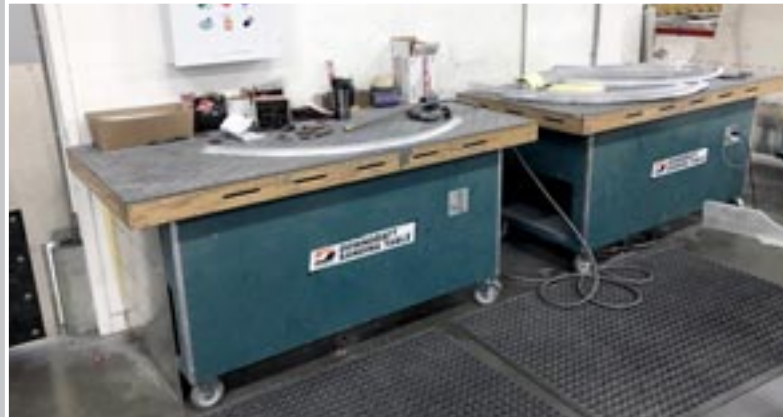
DYNABRADE Downdraft Tables