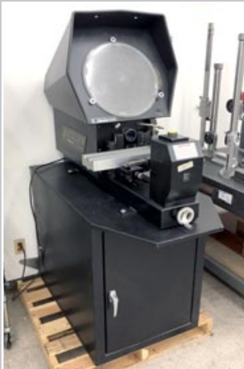
SUBURBANT TOOL MV-14 Optical Comparator