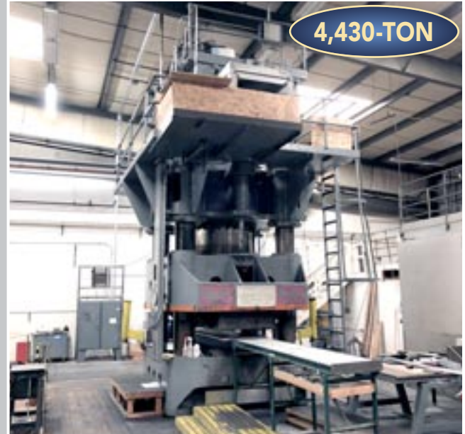
LAKE ERIE 4-Post Press

FOR FURTHER INFORMATION CONTACT: Nyk Westbrook at (818) 738-0800 or nwestbrook@maynards.com