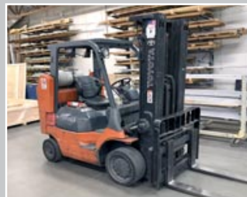
TOYOTA 5,000 Lb. Cap. Forklift