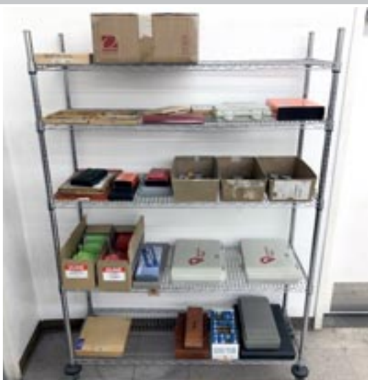
Miscellaneous Inspection Equipment