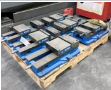
8" KURT Vises