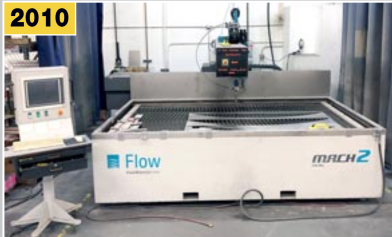
FLOW MACH 2 3120b CNC Waterjet