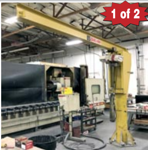
ABELL-HOWE 1/2 Ton Jib Crane