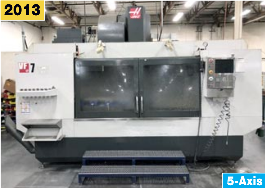
HAAS VF-7/40 CNC Vertical Machining Center