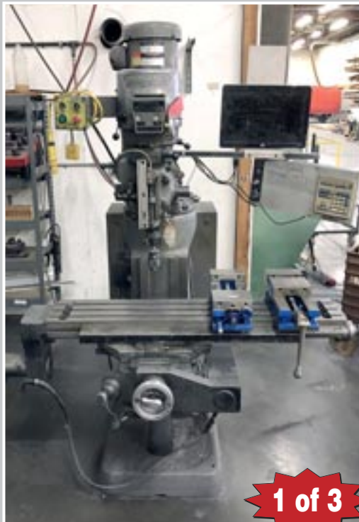
BRIDGEPORT EZ TRAK CNC Vertical Mill