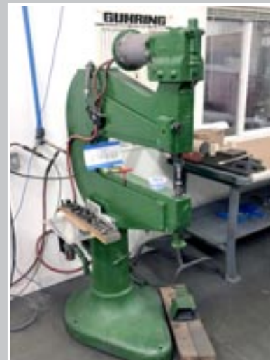
CHICAGO 450-EA Riveter