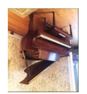
.M.A 00:6@ gnihat2 Saturday, August 11, 2018